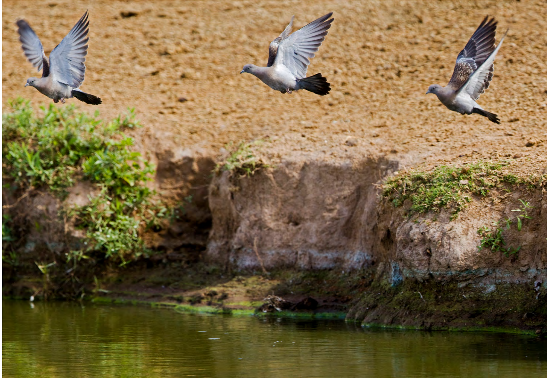
Pigeons not only fly fast and erratically, but they are also a smart and observant quarry, providing an all around sporting challenge over the decoy spread.