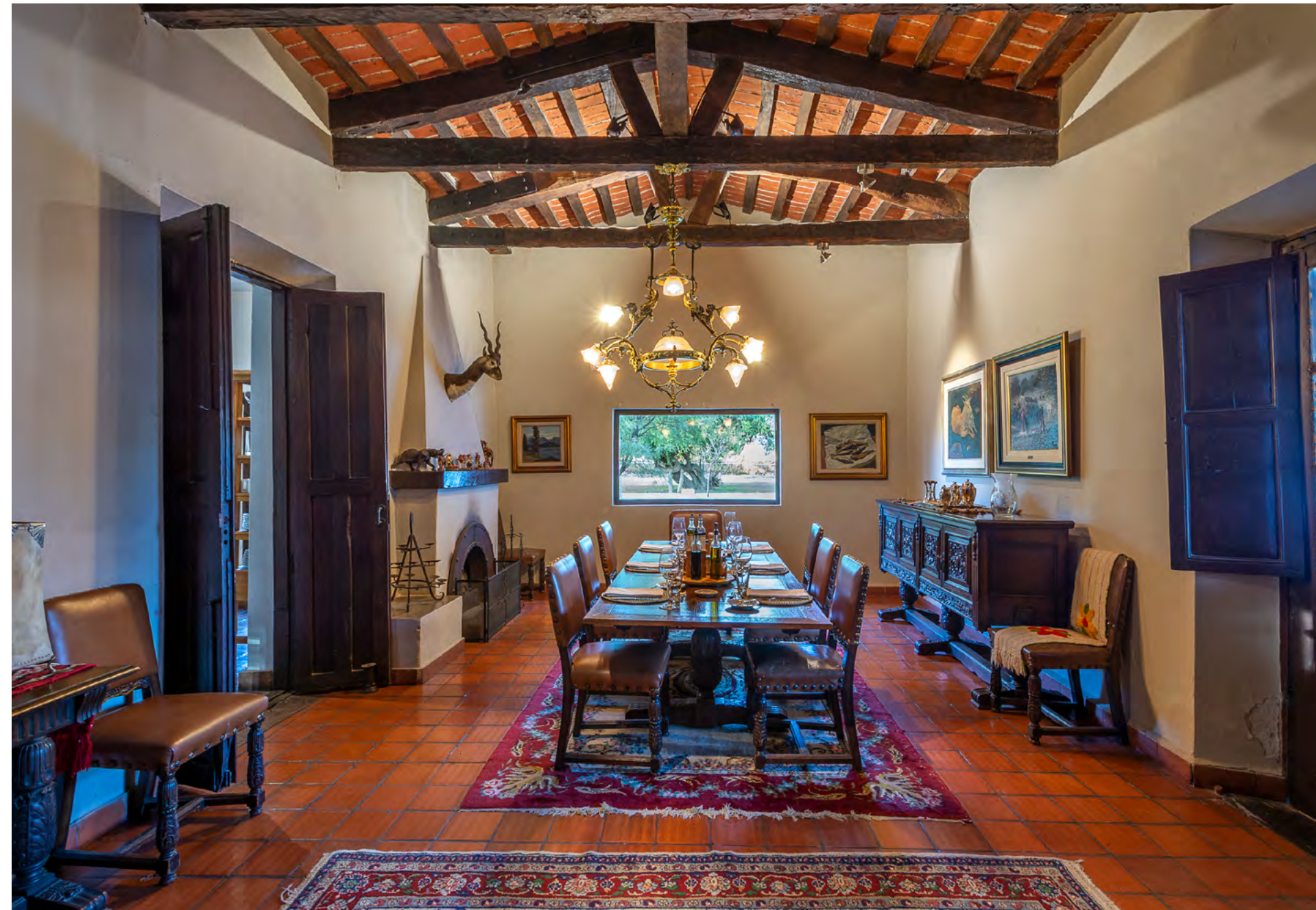
Upon arrival at La Torcaza Lodge, you will be immediately transported back in time. In this antique Jesuit Estancia, the atmosphere of history and elegance abounds.