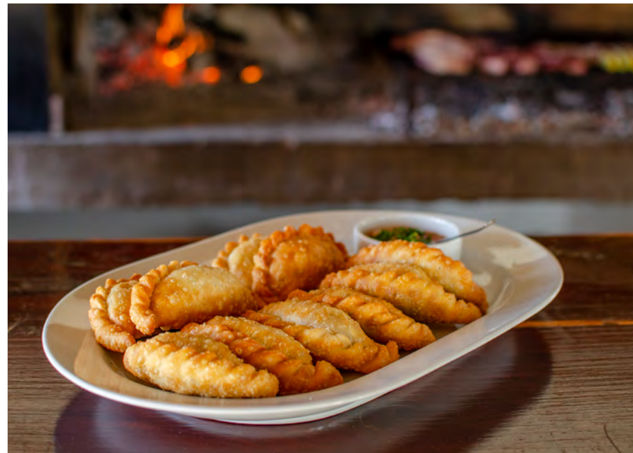
Our traditional Argentinean empanadas suffed with pigeon.