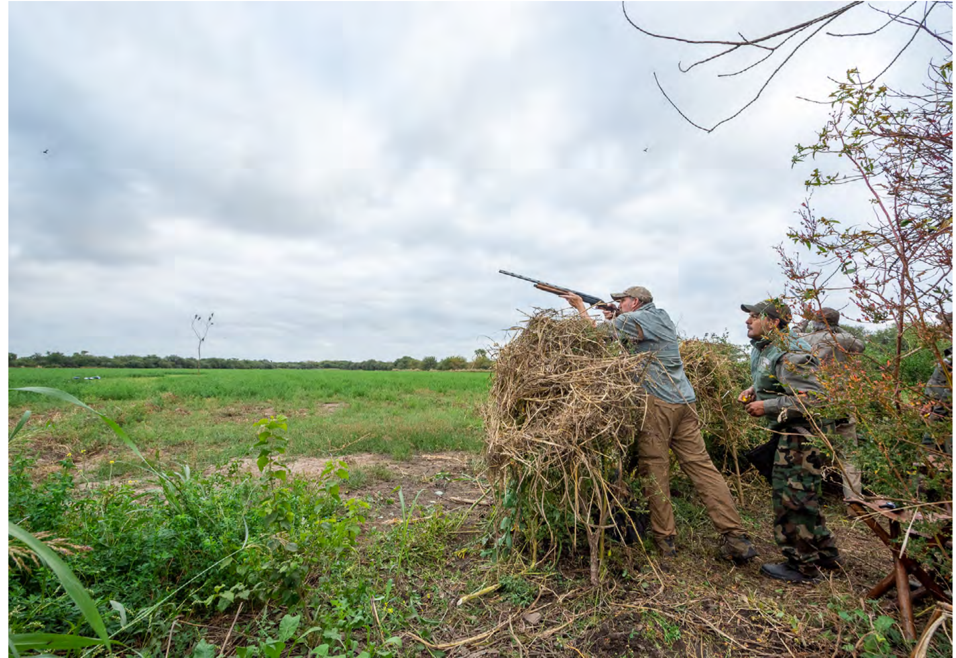
At La Torcaza, pigeon hunting takes place in traditional hunting style, from natural blinds over decoys, which are strategically placed based upon skilled scouting and planning, to ensure success.