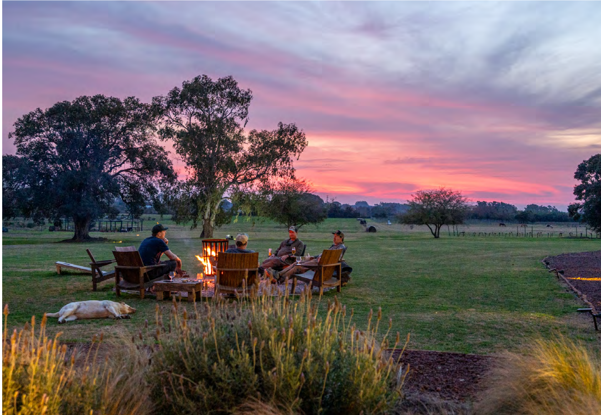
The inviting fire pit in the main courtyard often becomes the center of the lodge life once the hunting day is complete, offering a relaxing respite from the fast paced days in the dove fields.