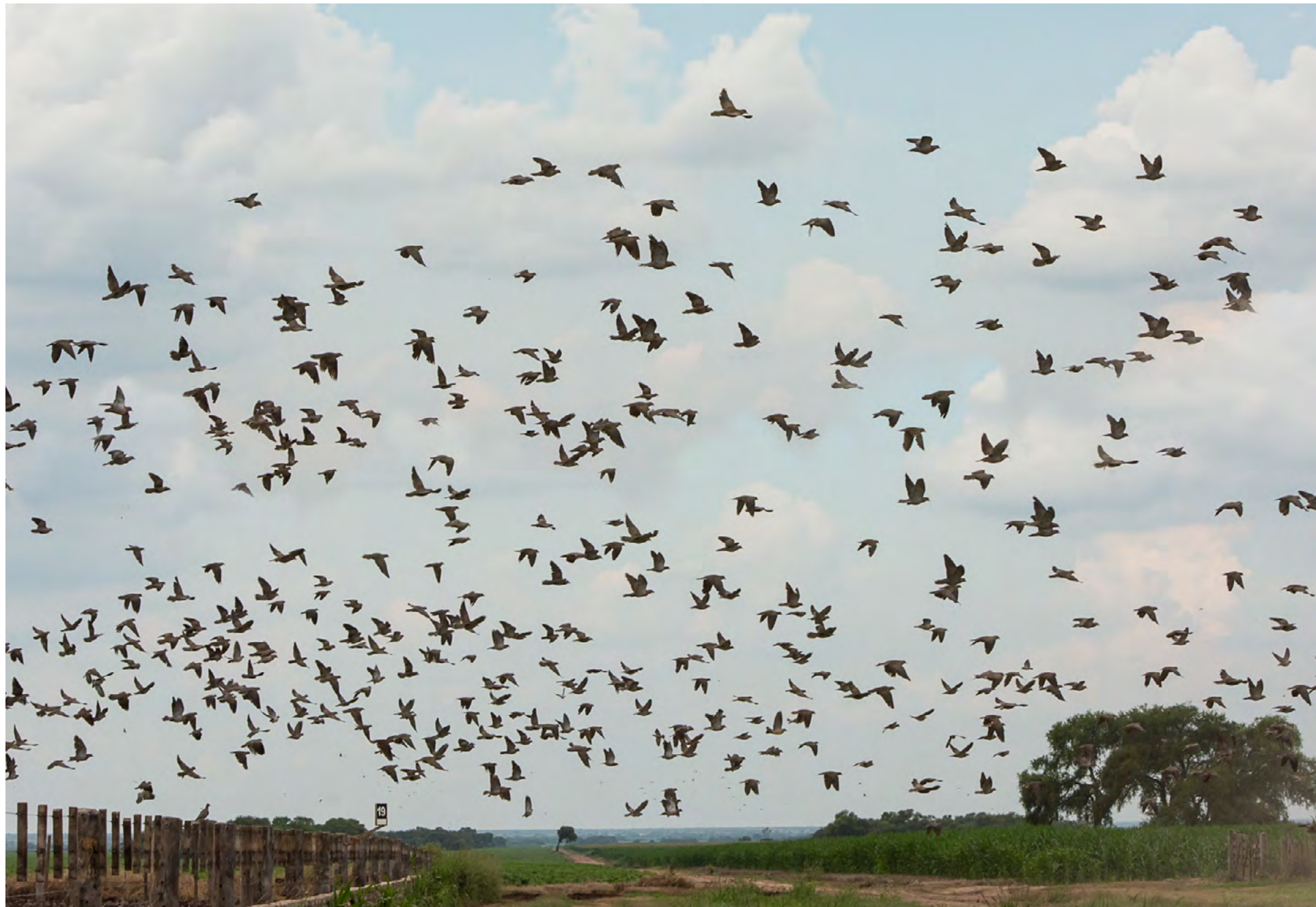
Shoot doves in the rolling slopes and vineyards of this rich wine producing area, with flights of birds that rival any population of doves you'll see anywhere in South America.