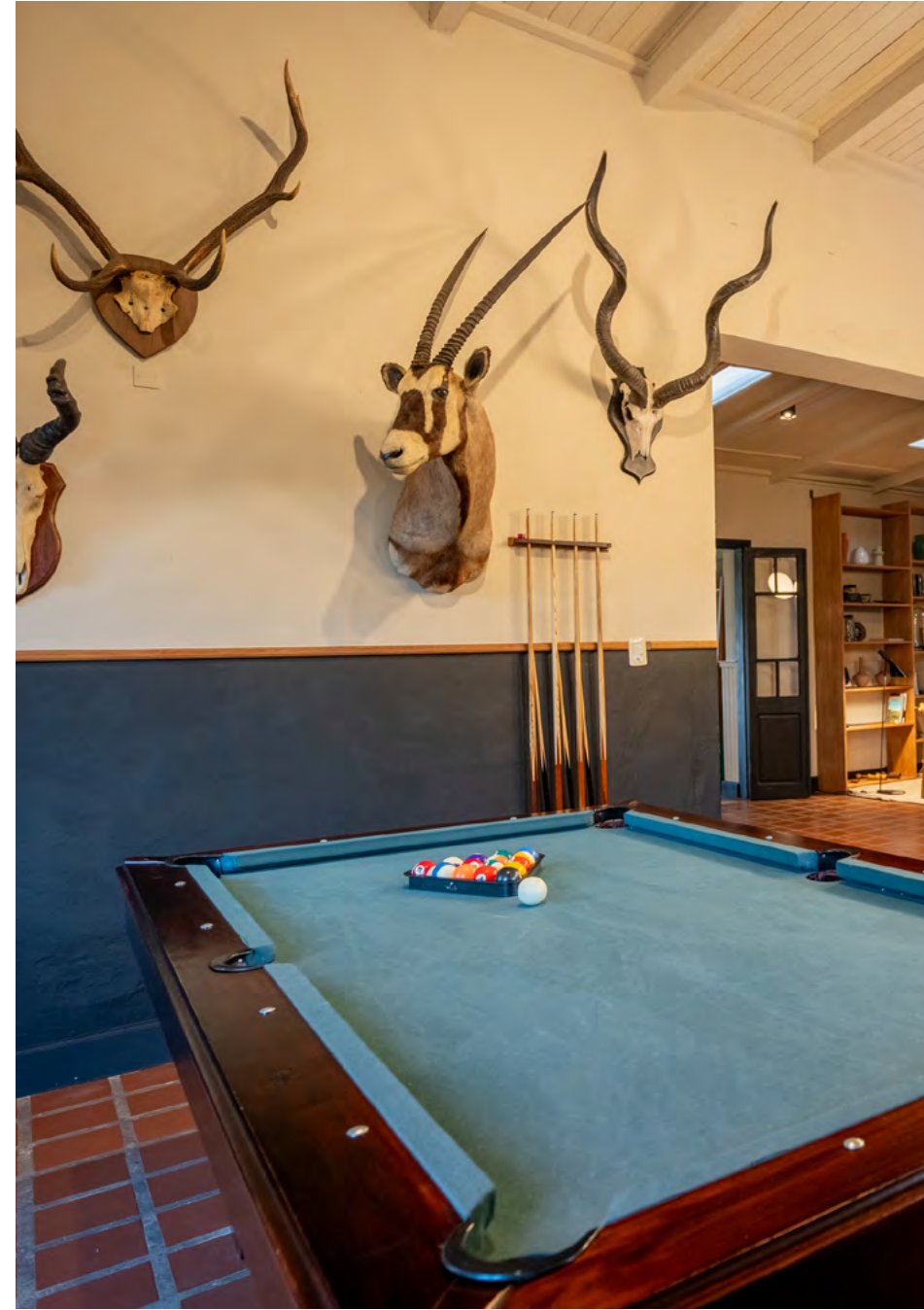
The lodge's facilities are second to none, boasting a brand new game room complete with a billiards table and adjacent bar.