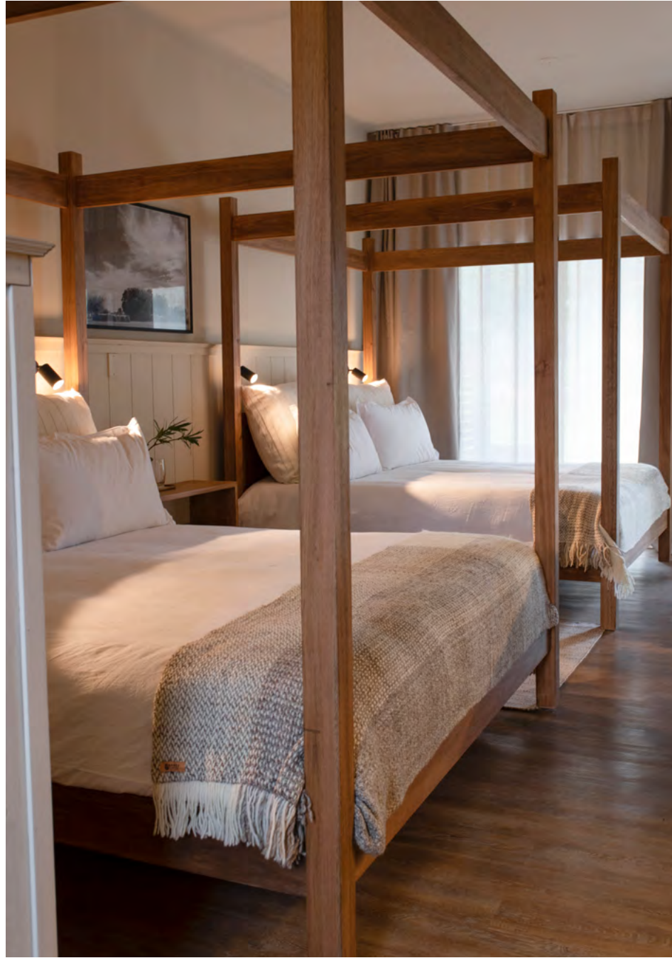
Carmelo has 10 beautifully appointed and fully-equipped en suite rooms, with Queen and King-size beds.