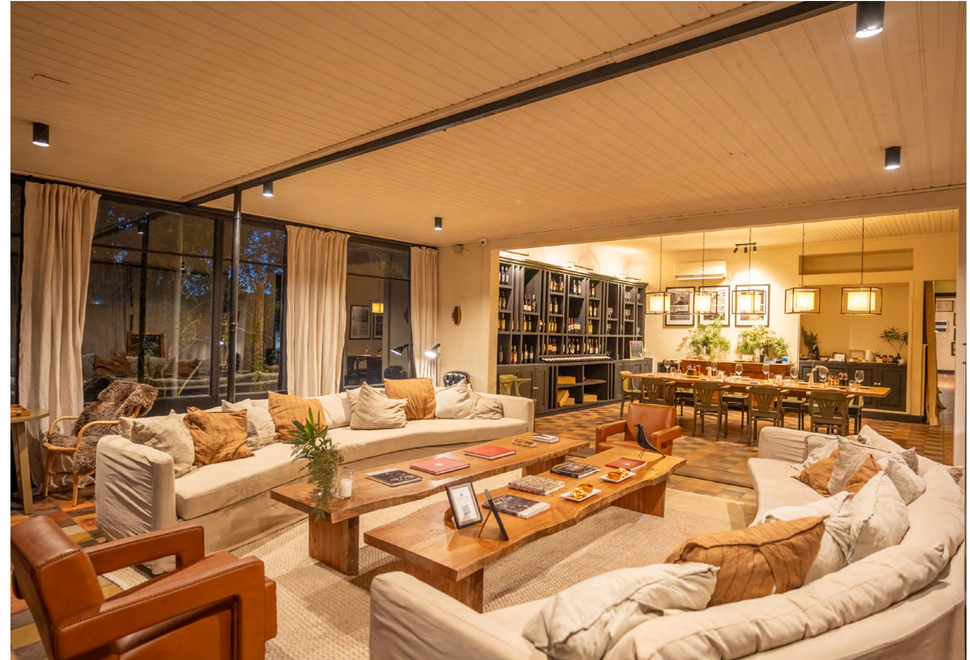
Carmelo Lodge features fine accommodations combined with a refined and inviting vineyard, right in the heart of Uruguay's high volume dove hunting.