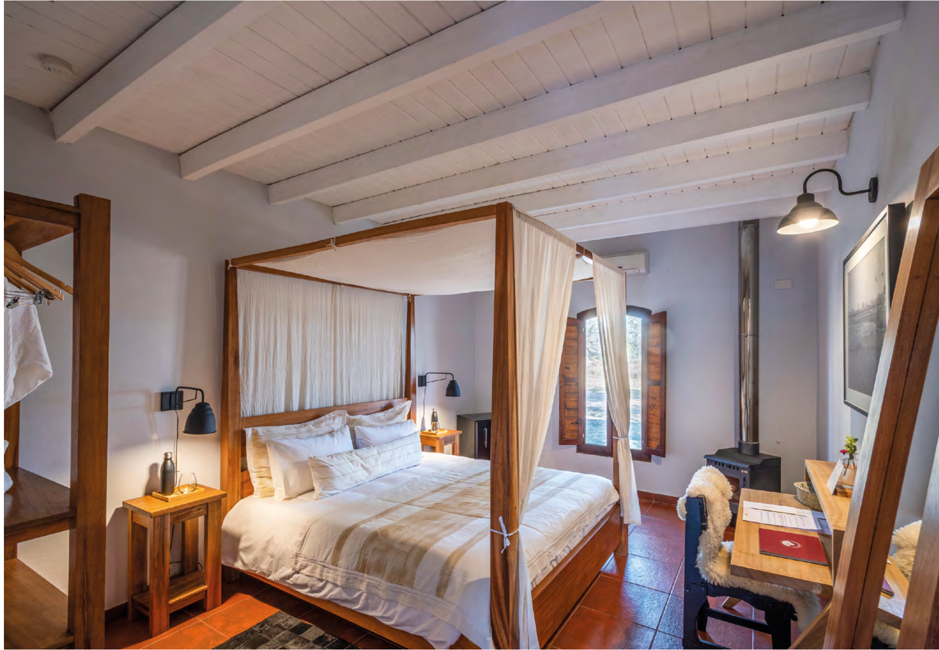
Santiago del Estero offers 11 en-suite rooms, some single and some double; all are furnished with king-size beds, air-conditioning, heating, and room safes.