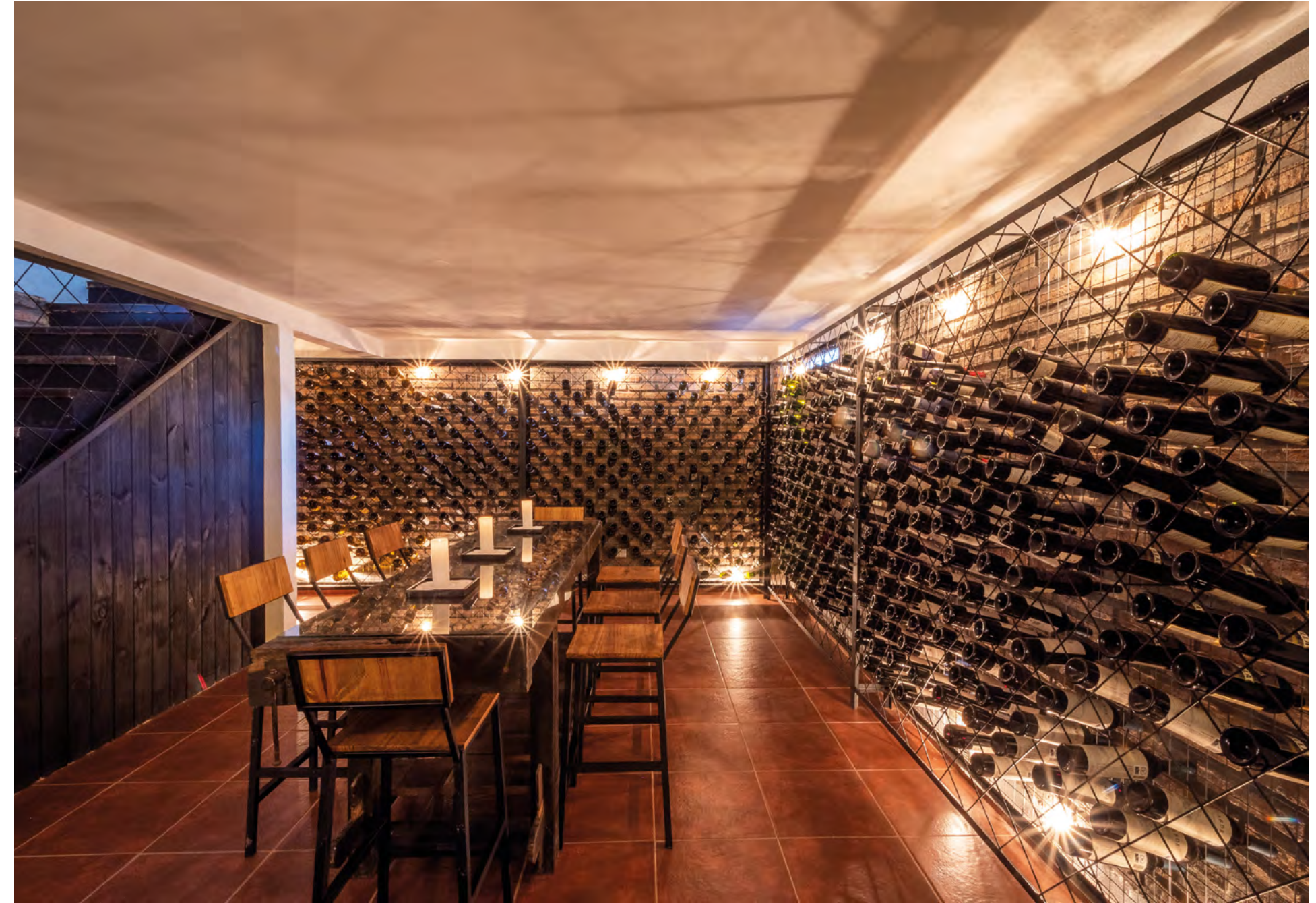
The facilities and amenities at the lodge are without peer in the shooting world, featuring an outdoor pool, a magnificent wine cellar and TV room.