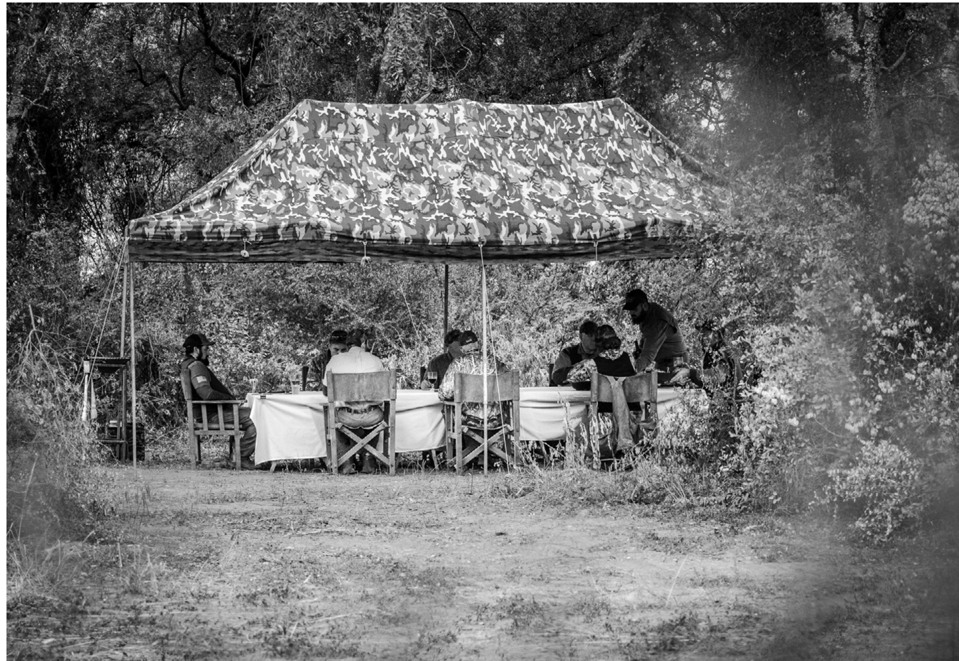
On pigeon hunts, you'll spend the entire day in the field. While you're shooting, we'll ready tents and Asado for a delicious meal.