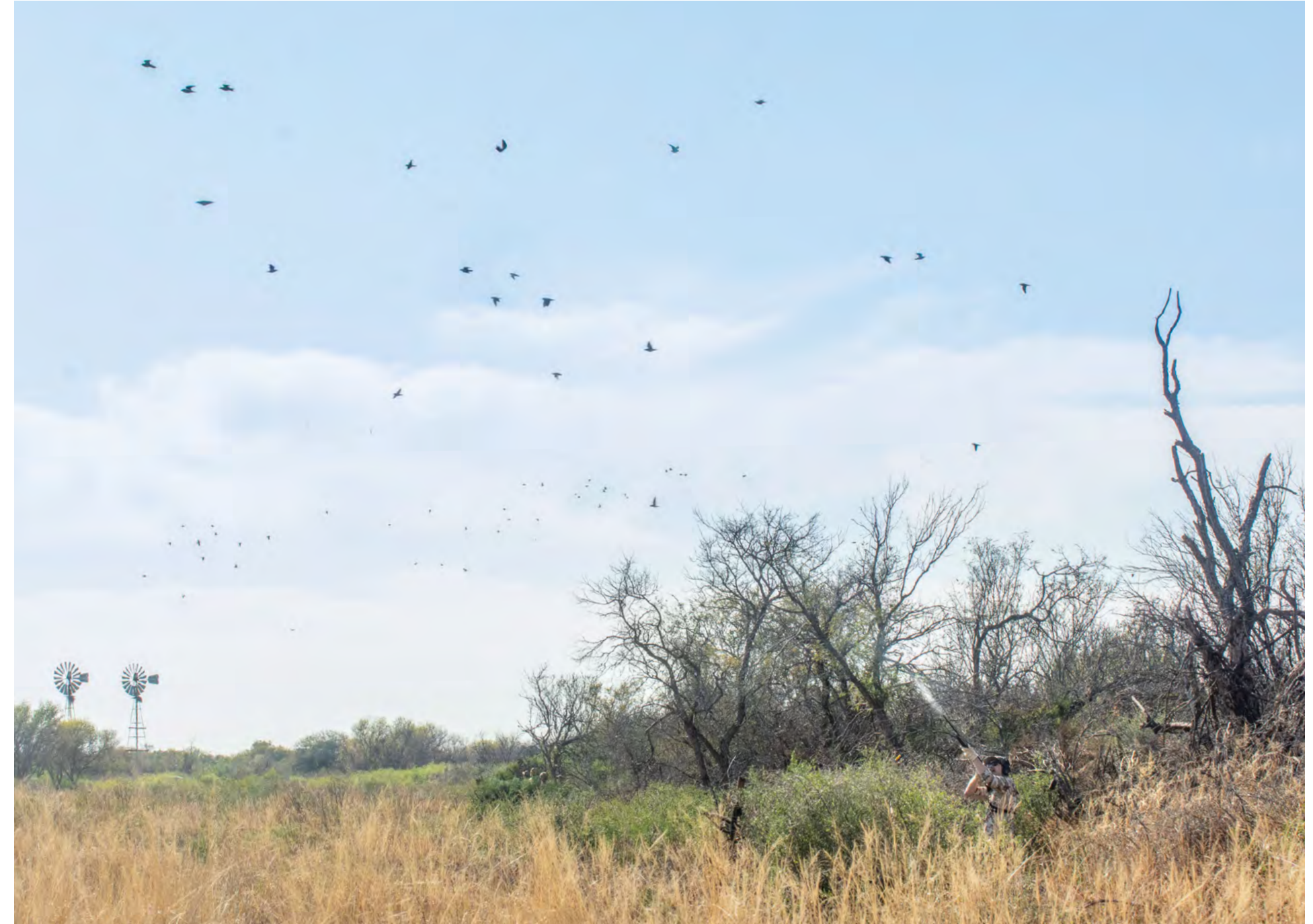
Waves and waves of doves that fly all day every day- it truly must be seen to be believed.