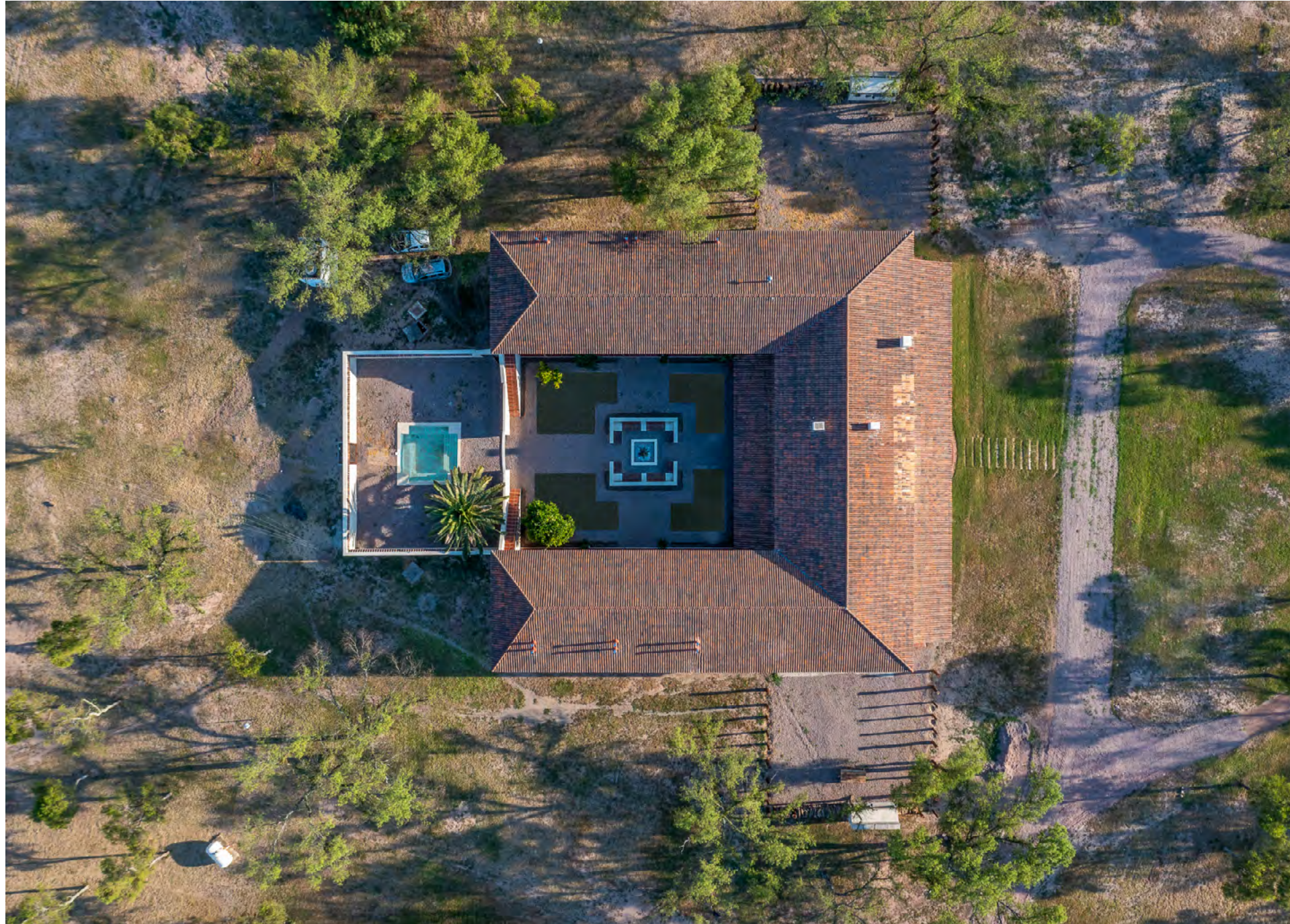
A sprawling Spanish-style manse on the vast frontier of dove and pigeon shooting.