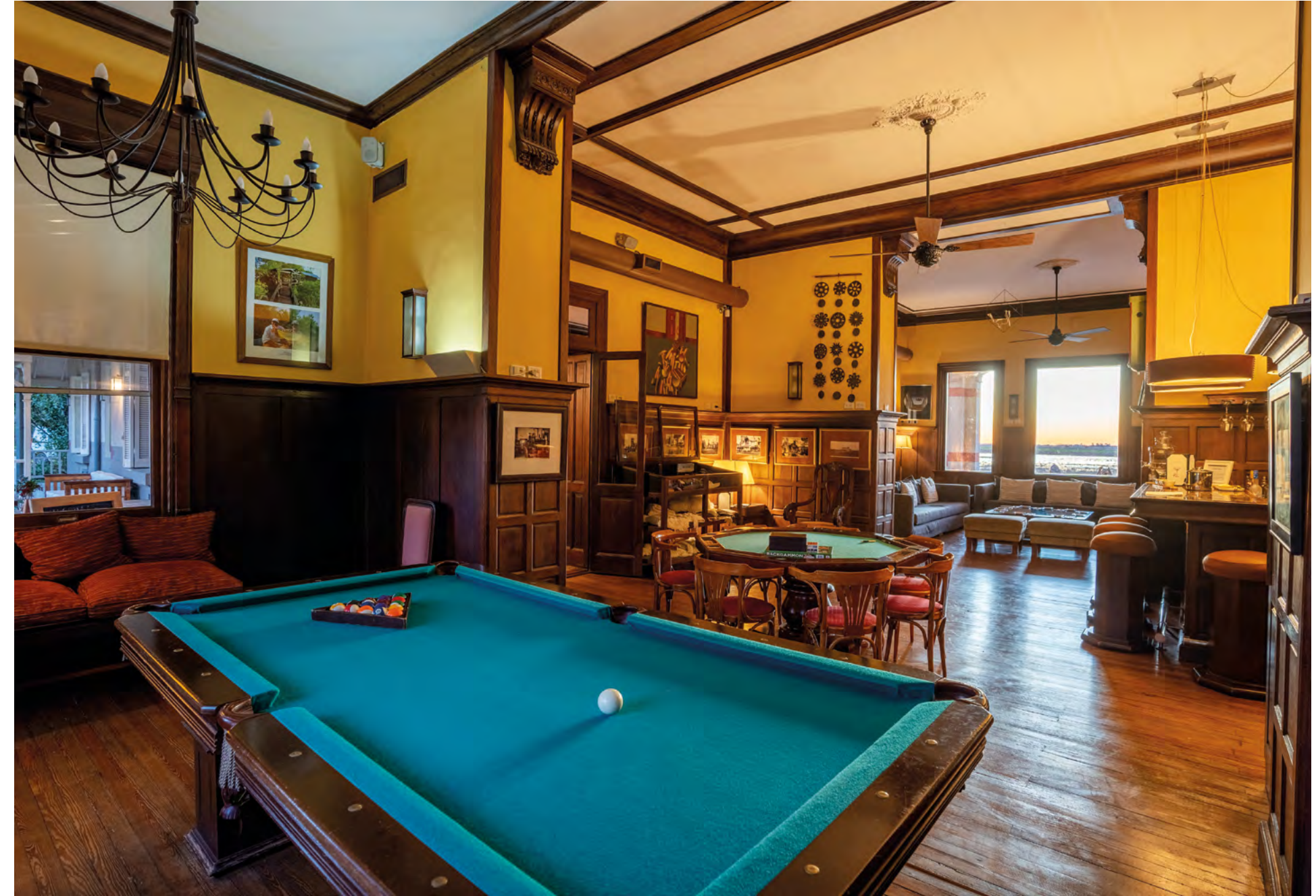
Our recreation room is the perfect place for those looking to continue challenging themselves, and their lodge mates, over a fun game of billiards.