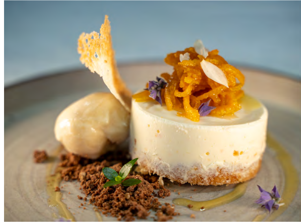
Local green tangerine cheesecake with caramel ice-cream.