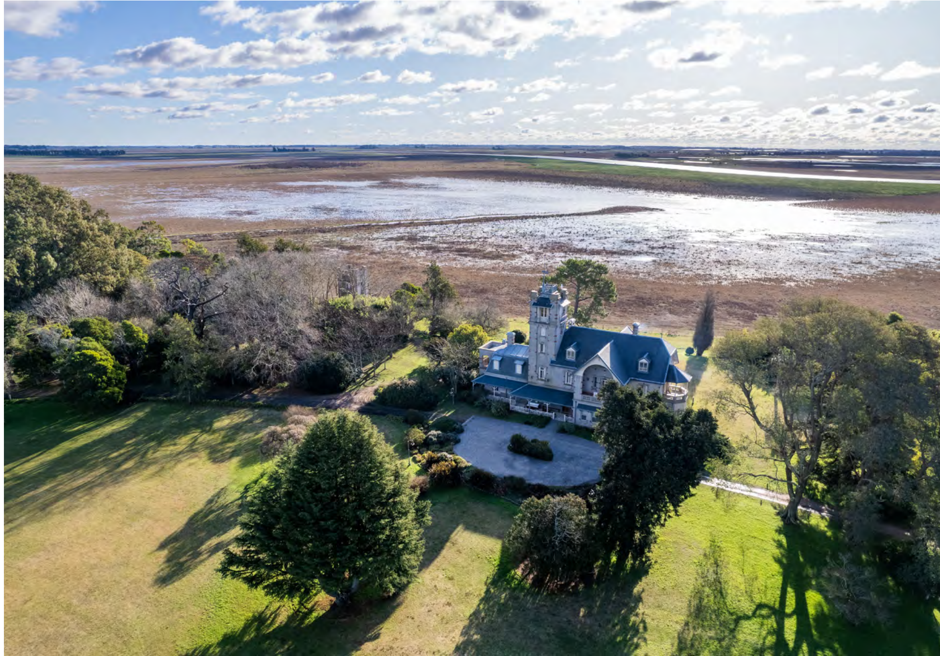
Los Crestones Lodge lies on a sophisticated and luxurious compound situated on 60 hectares of preserved natural argentinian woodlands