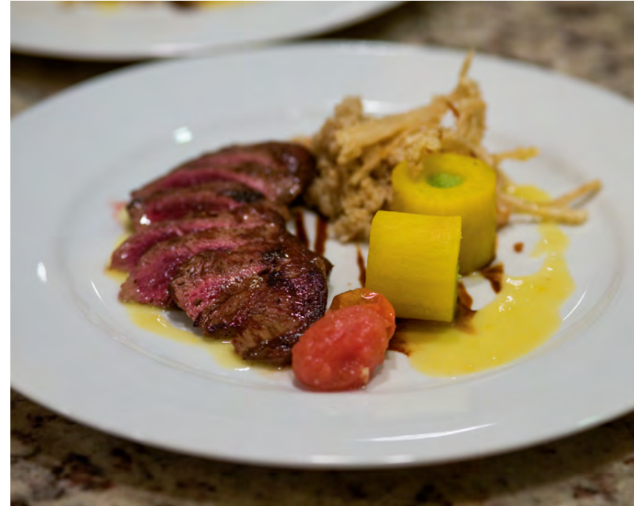
Medium rarete Grilled duck, with a zafron cassava, cherry tomatoes and quinoa salad.