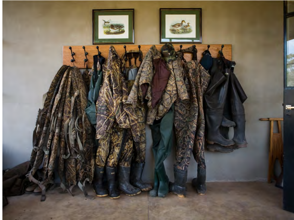
Waders are provided at the lodge at no extra charge.