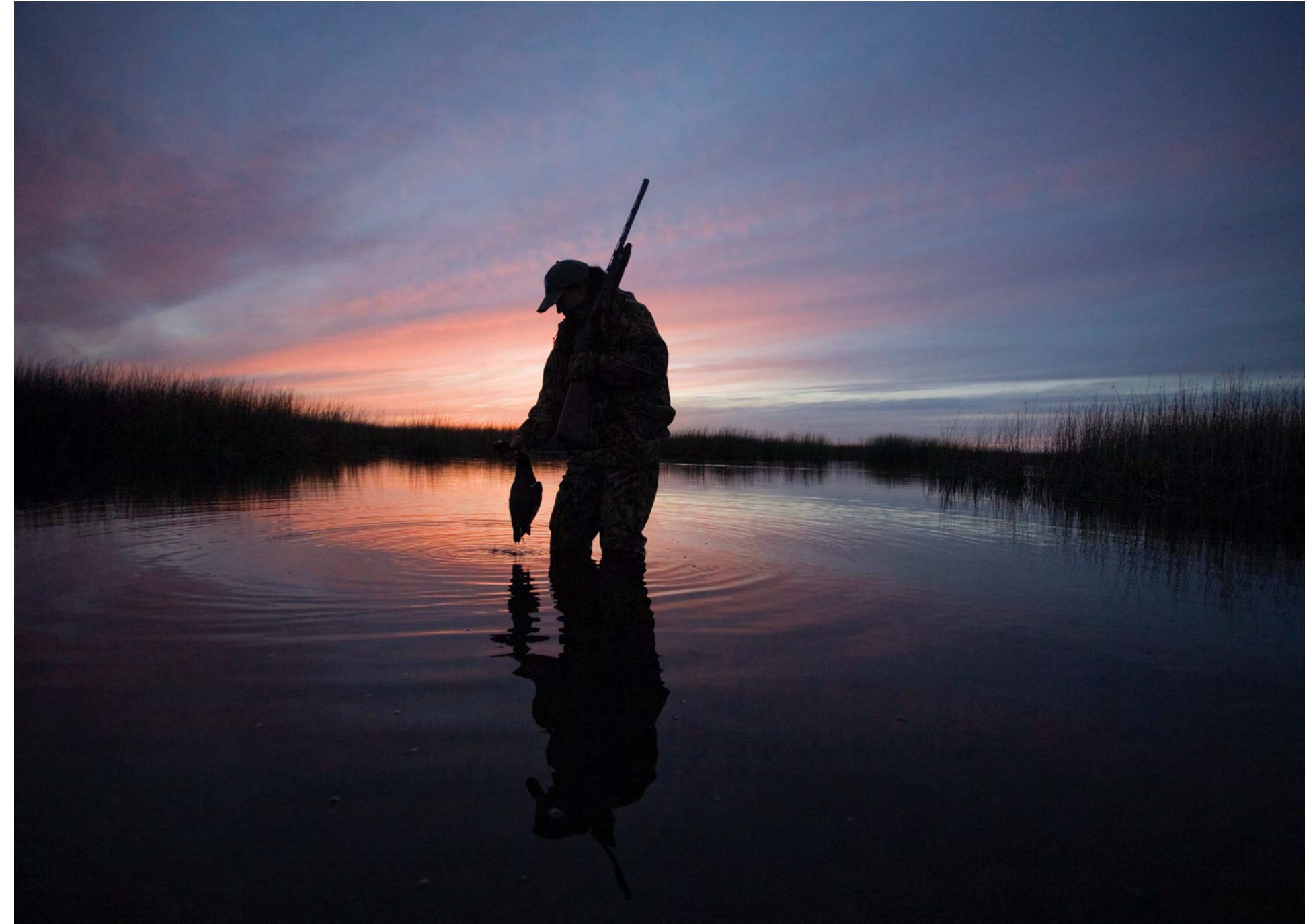
Hunting over decoys starts at first light, and continues until 10 a.m or fulfilment of your limits.