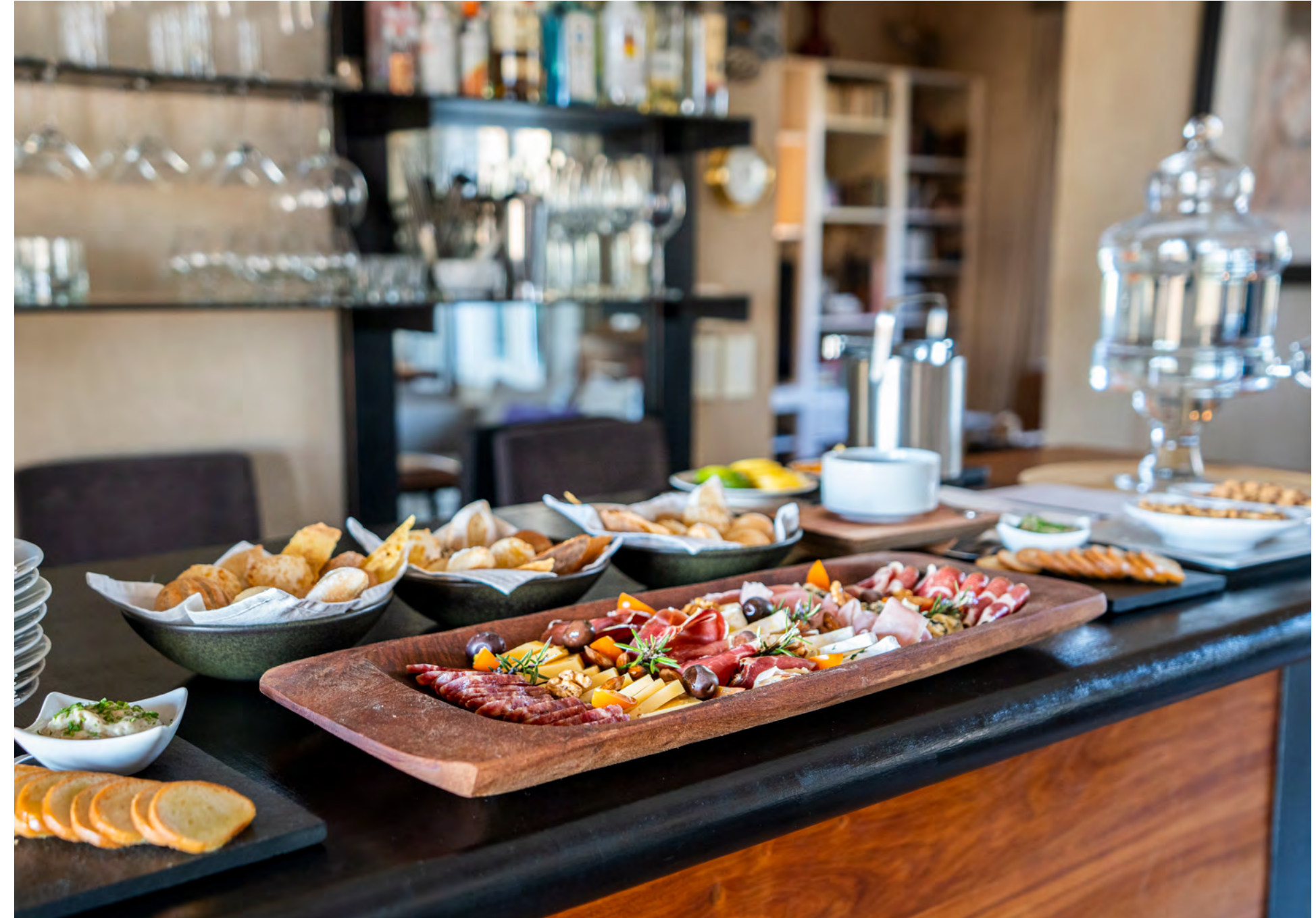
Luxurious living, à la carte menu, and impeccable service. Like all of our David Denies lodges, no detail is left to chance.