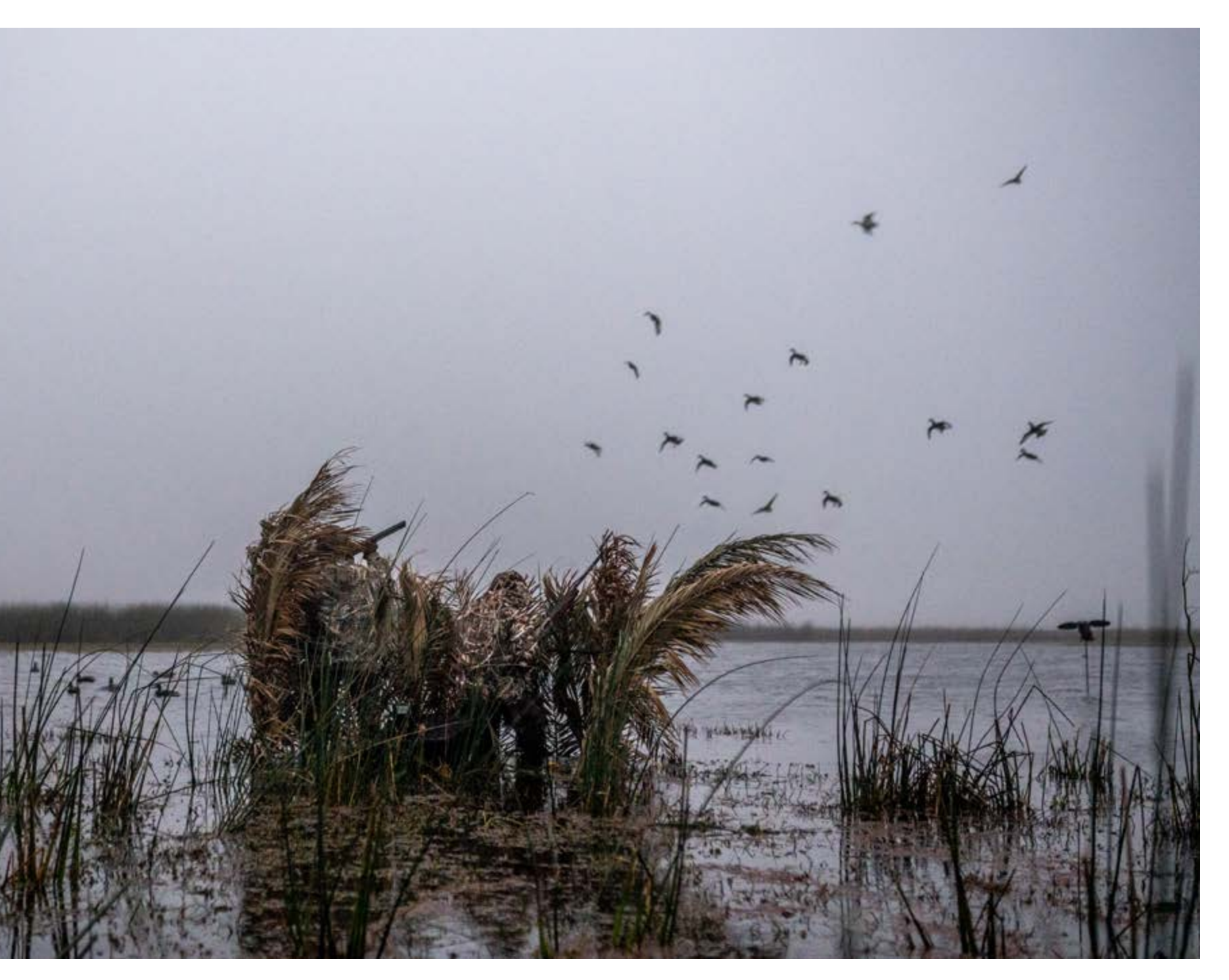
Blinds are well placed and scouted, providing the best possible opportunities at a number of duck species.

Once at the lodge, you are conveniently close to the hunting grounds. Drives vary depending on water conditions, but range from ten to forty-five minutes.