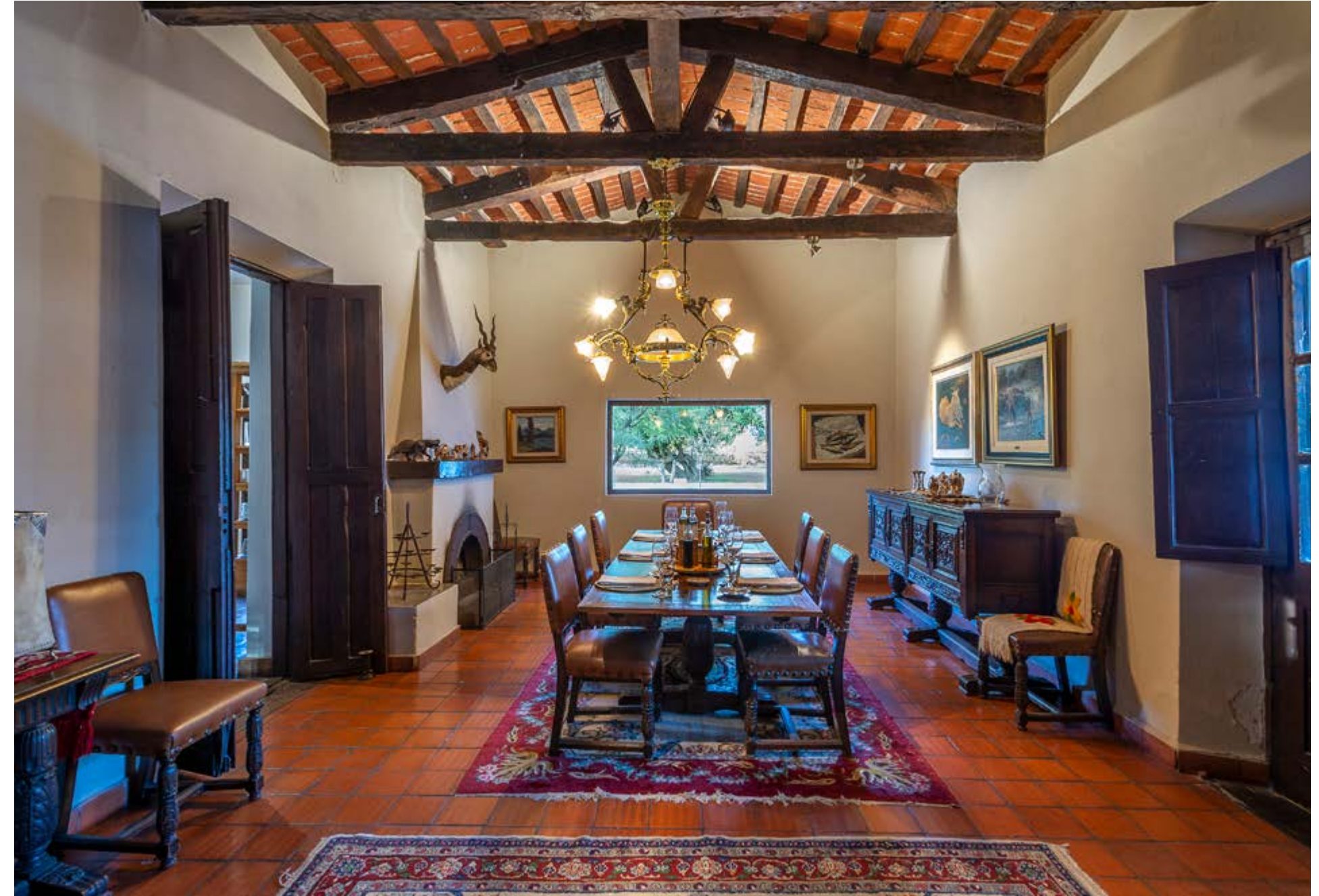
Upon arrival at La Torcaza Lodge, you will be immediately transported back in time. In this antique Jesuit Estancia, the atmosphere of history and elegance abounds.