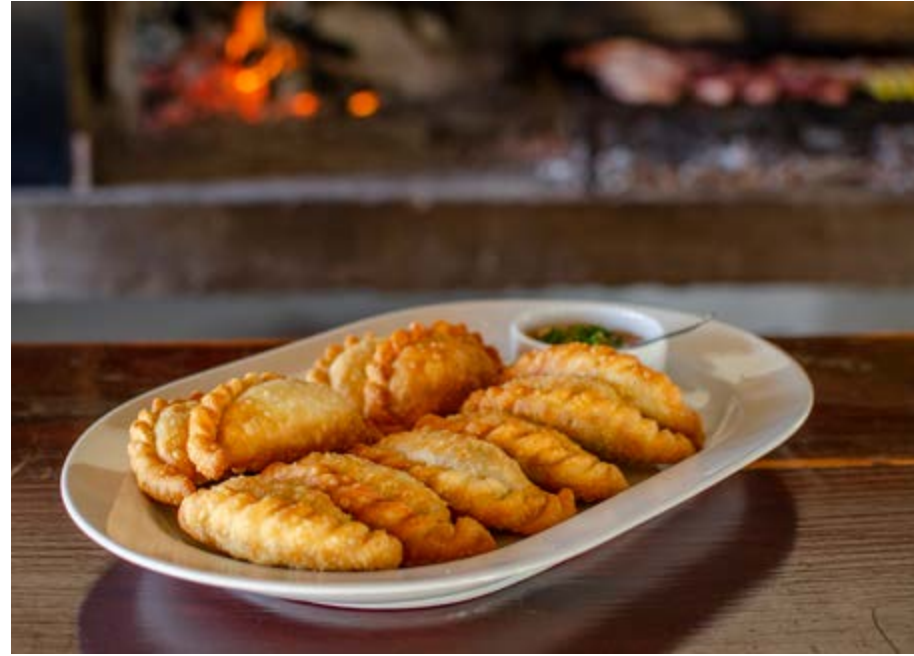
Our traditional Argentinean empanadas suffed with pigeon.