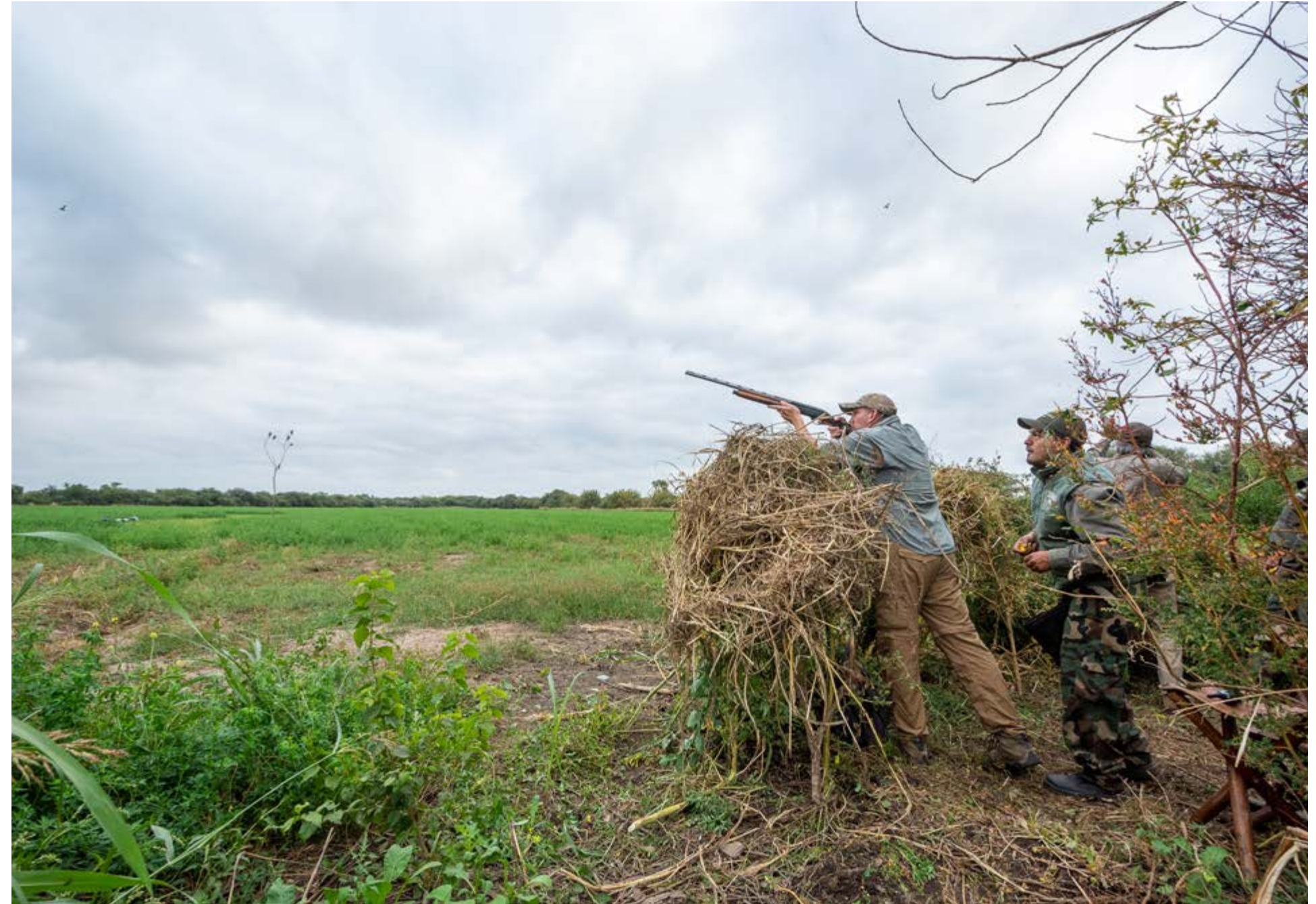
At La Torcaza, pigeon hunting takes place in traditional hunting style, from natural blinds over decoys, which are strategically placed based upon skilled scouting and planning, to ensure success.