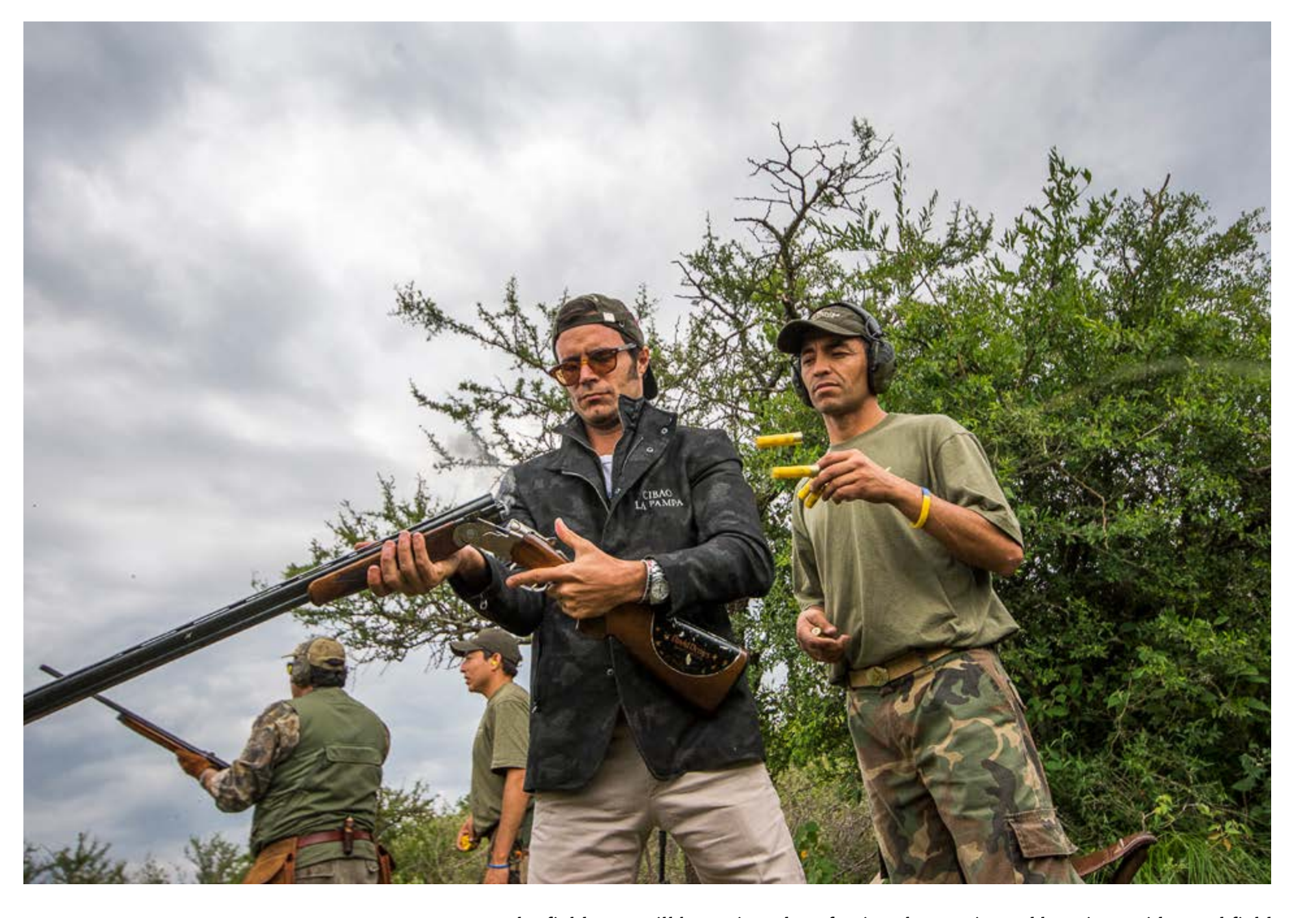
In the field, you will be assigned professional, experienced hunting guides and field assistants who will direct you to your shooting stand and serve as a loader should you wish.