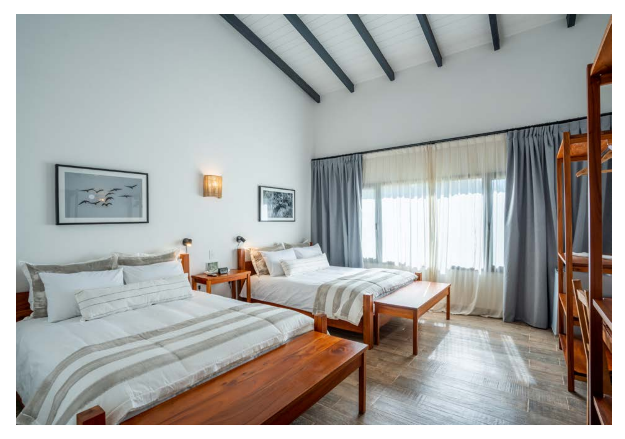
With 6 beautifully appointed guest rooms, all with en suite bathrooms, the lodge comfortably hosts up to 12 guests and is the perfect venue for small parties and families.