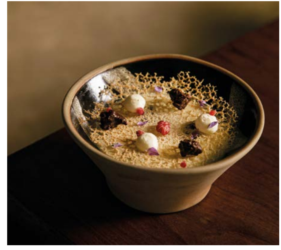
Panna Cotta dessert.