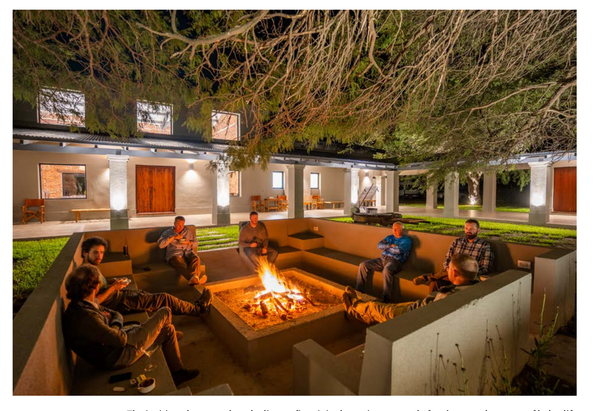
The inviting plunge pool, and adjacent fire pit in the main courtyard often become the center of lodge life once the hunting day is complete, offering a relaxing respite from the fast paced days in the dove fields.