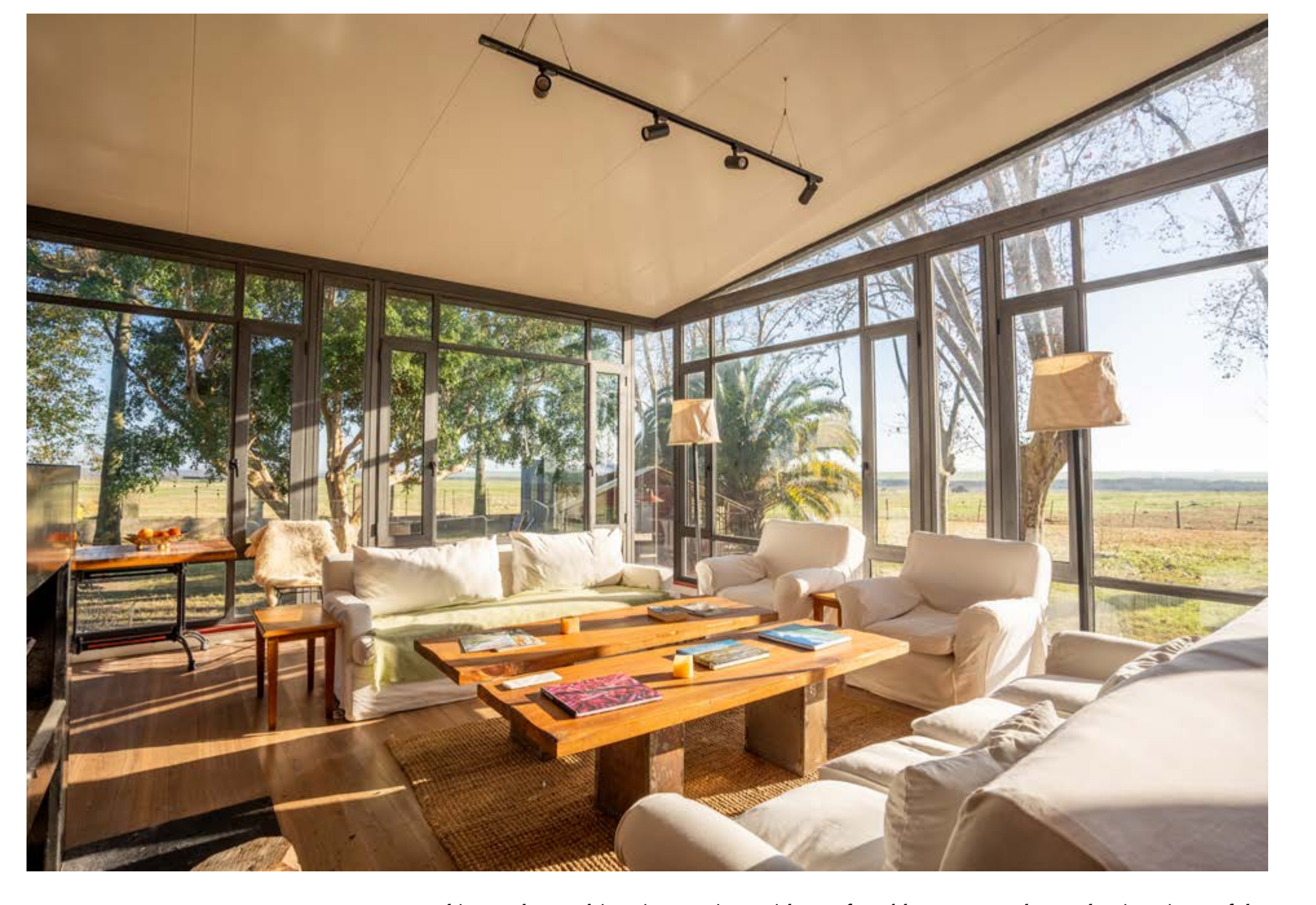
Housed in an elegant historic mansion, with comfortable areas to relax and enjoy views of the bucolic countryside just outside the windows.