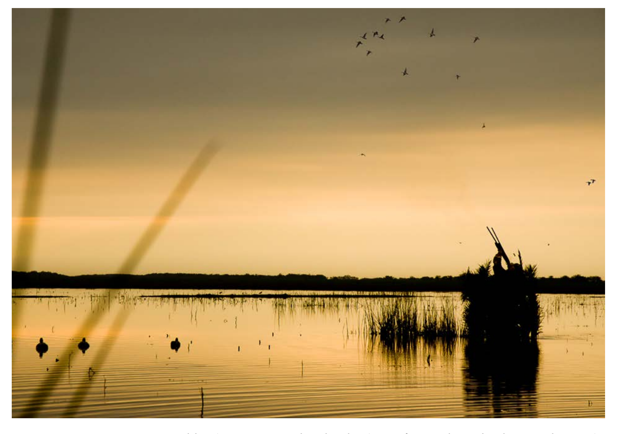
Duck hunting at Uruguay Lodge takes place in one of our nearby ponds or lagoons, where species found only in this part of the world will challenge you throughout the morning.