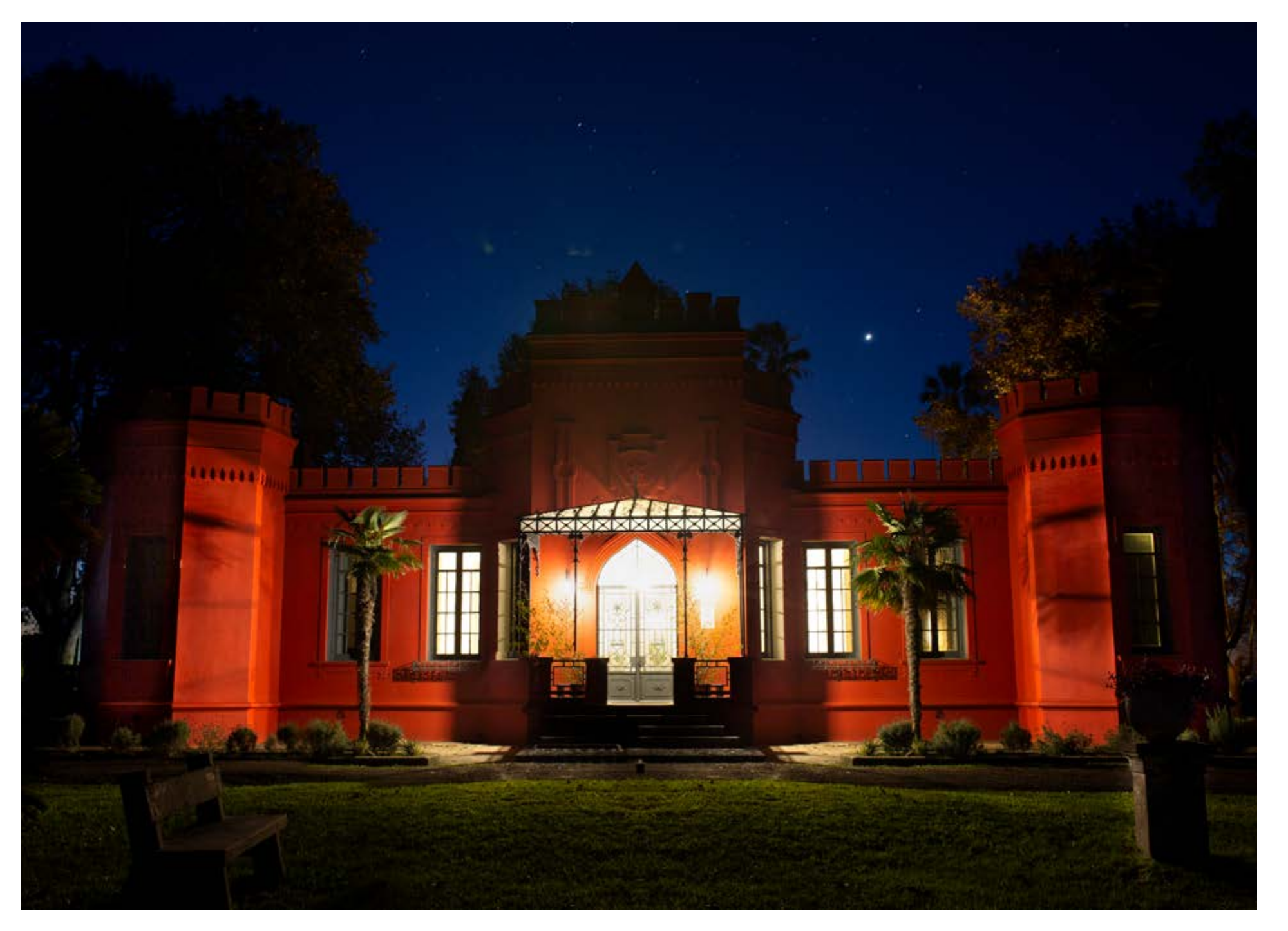
Uruguay Lodge is an elegant 19th-century mansion that rests on one of the most beautiful estancias in the country.