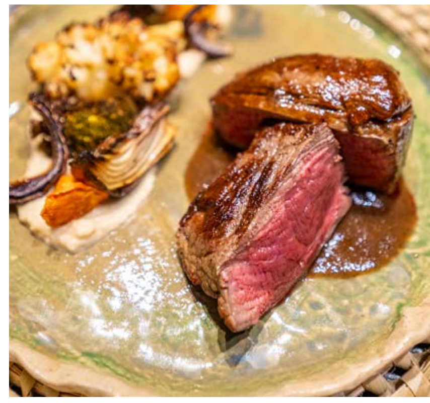
A top-notch team of experienced chefs with an artisan's touch, will create dishes for you to enjoy.