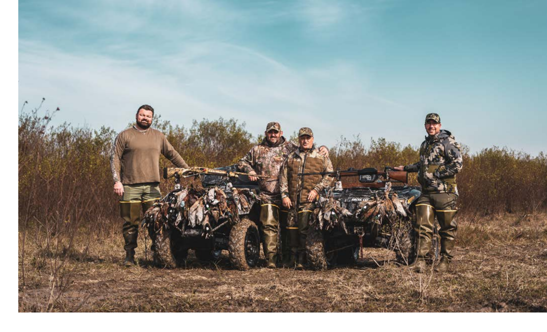
During the mornings and afternoons, our program provides high-quality traditional duck hunting, covering a wide variety of locations

You will hunt well-maintained, species-specific, decoy sets, and motion decoys. Your guide will be close by, offering bird identification help, calling, and any support you require during your hunt.