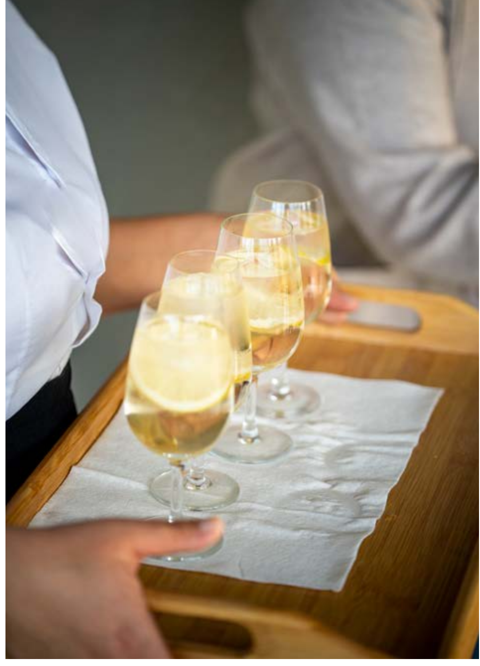
From welcome drinks every day and hot towels after the hunt, to turn-down service at night, we continue to redefine service in the sporting realm