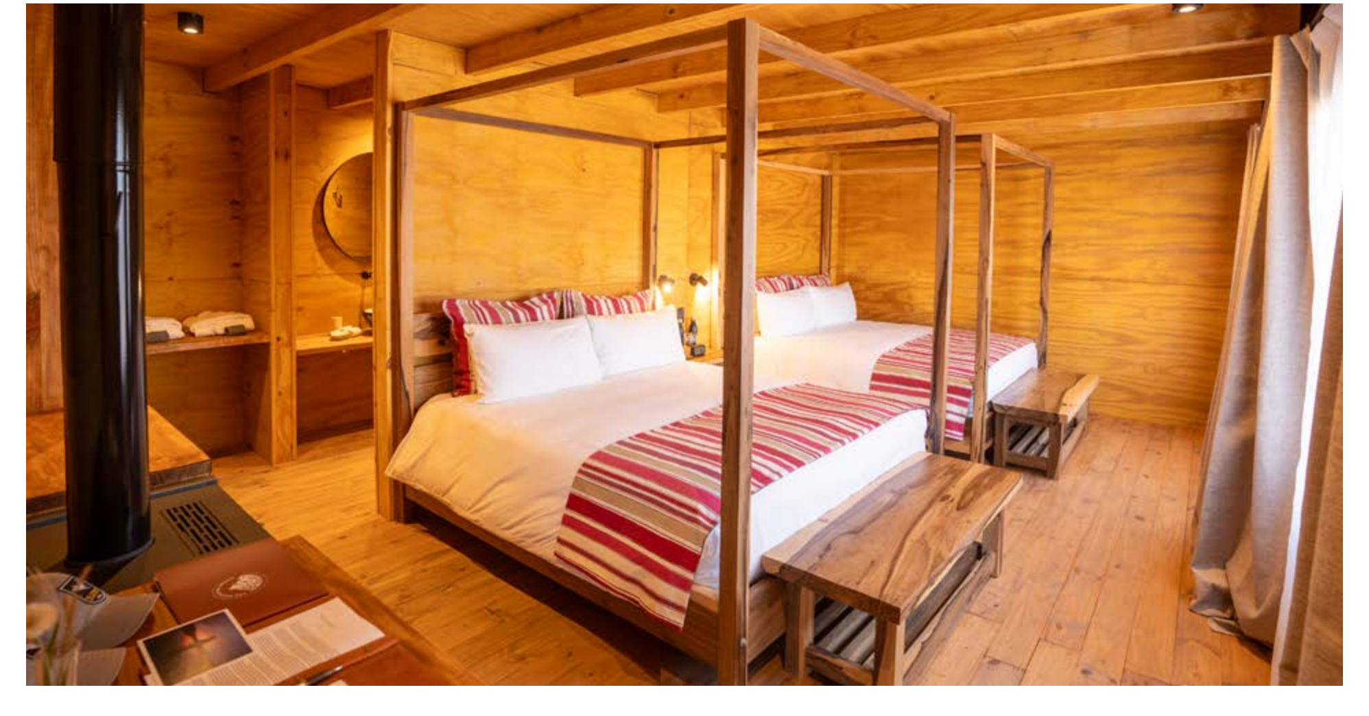
El Tobar has the capacity to accommodate up to 6 hunters, with 2 double and 2 single rooms all with queen-size beds and en-suite bathrooms

As the day winds down, a serene outdoor hot tub and fire pit invite relaxation beneath the stars. These spaces often become the focal point of lodge life, offering an escape from the busy shooting days.