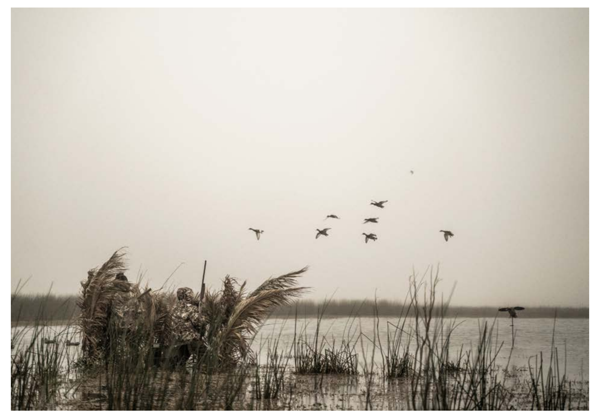
From the fertile wetlands formed by rivers to the lowlands that follow the lake, our thoughtfully positioned blinds will allow you to immerse yourself in the authenticity of time-honored pursuits.