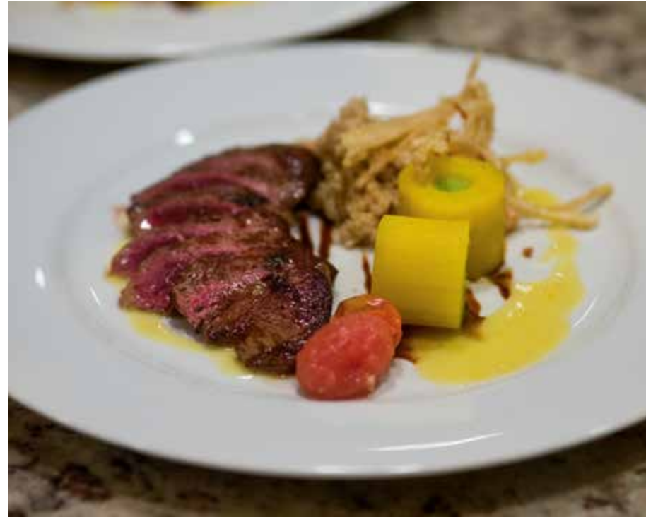
Medium rarete Grilled duck, with a zafron cassava, cherry tomatoes and quinoa salad.