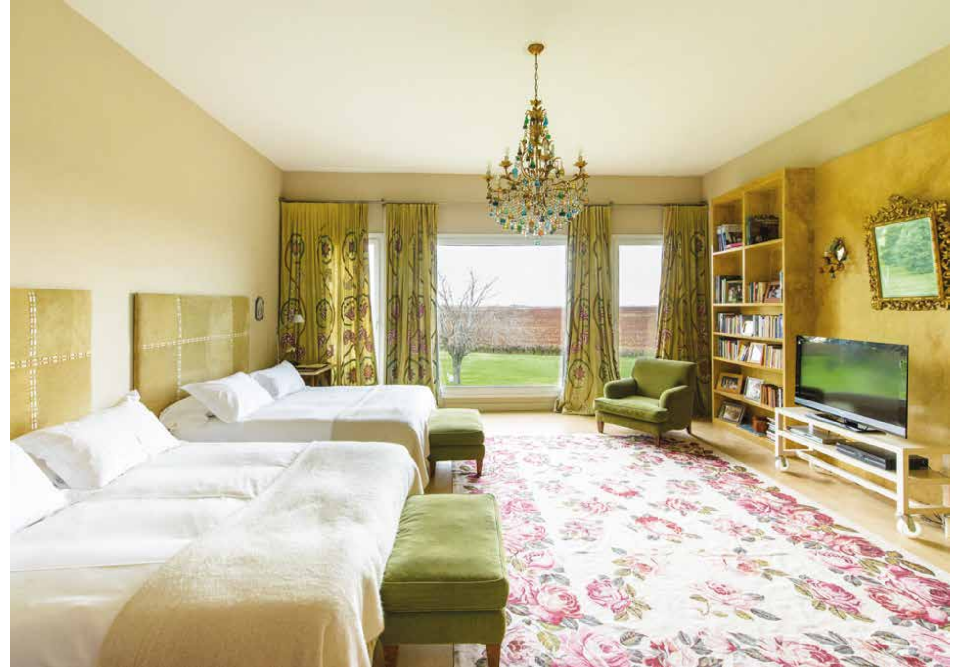
Luxurious living, à la carte menu, and impeccable service. Like all of our David Denies lodges, no detail is left to chance.