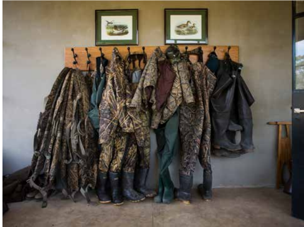
Waders are provided at the lodge at no extra charge.