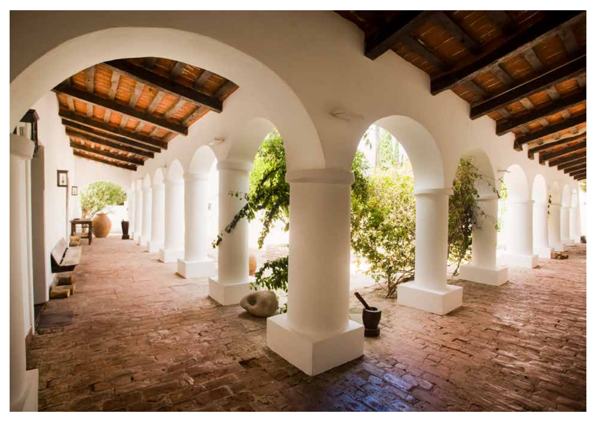
Founded as a Jesuit mission in 1669, La Torcaza brings together historical elegance with well appointed modern comfort. This spectacular ranch offers beauty and relaxation at every turn.