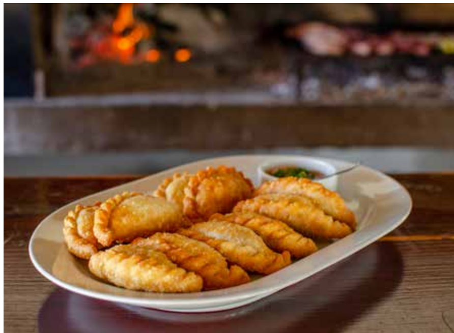
Our traditional argentinean empanadas suffed with pigeon.