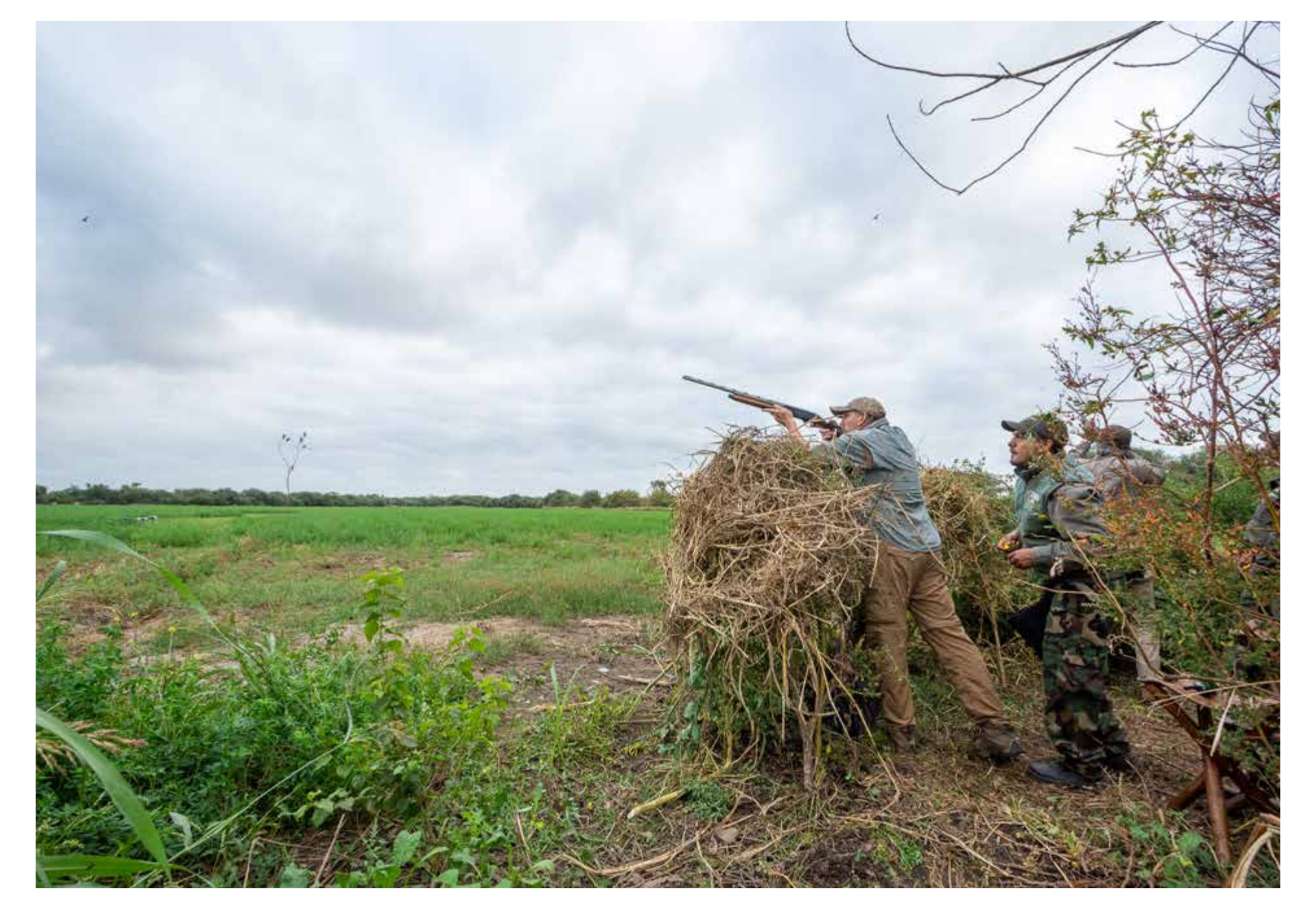
At La Torcaza, pigeon hunting takes place in traditional hunting style, from natural blinds over decoys, which are strategically placed based upon skilled scouting and planning, to ensure success.