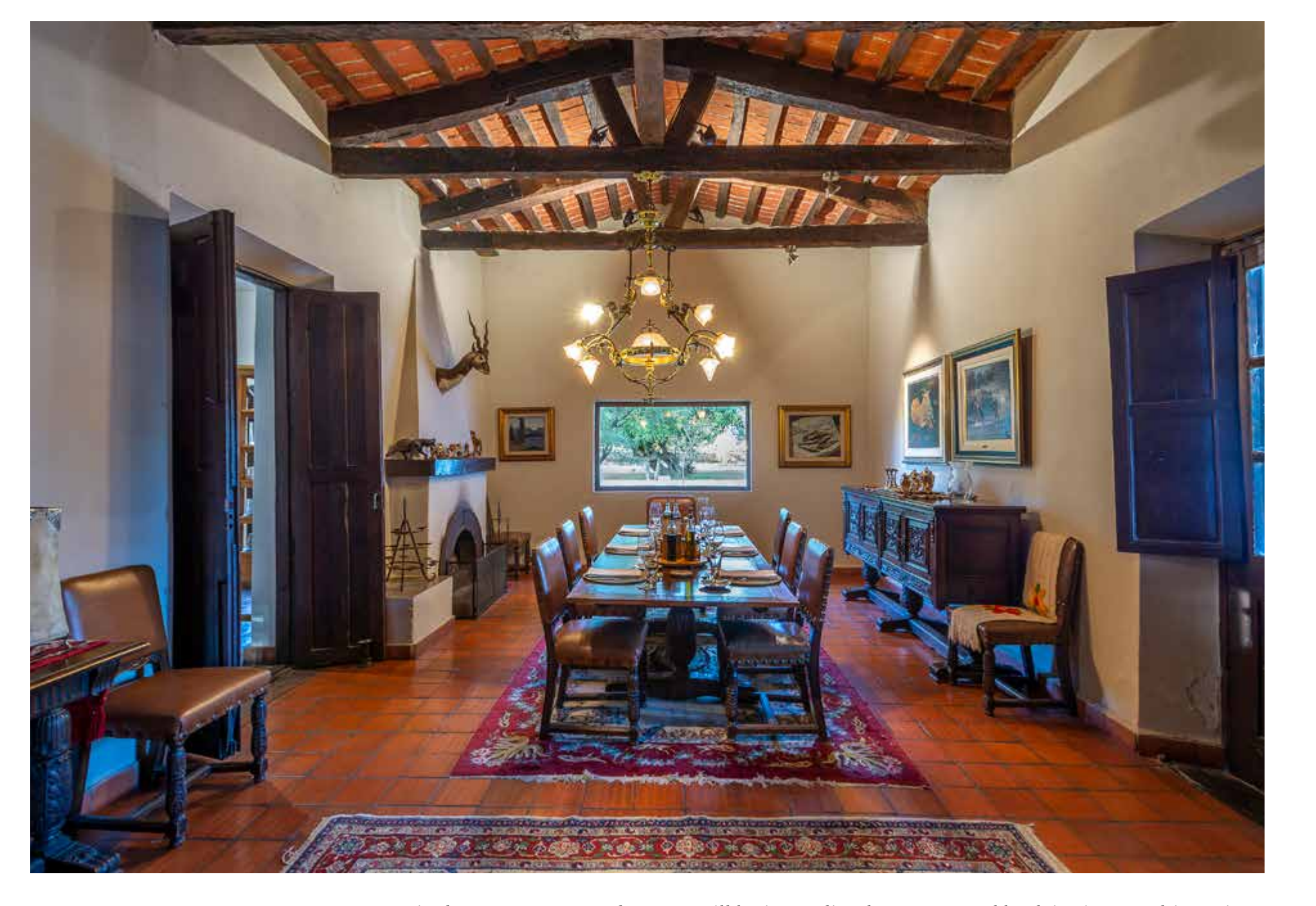
Upon arrival at La Torcaza Lodge, you will be immediately transported back in time. In this antique Jesuit Estancia, the atmosphere of history and elegance abounds.