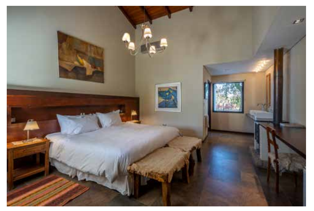
The lodge offers eight single rooms with King beds, and one double bedroom— each with a private bathroom.