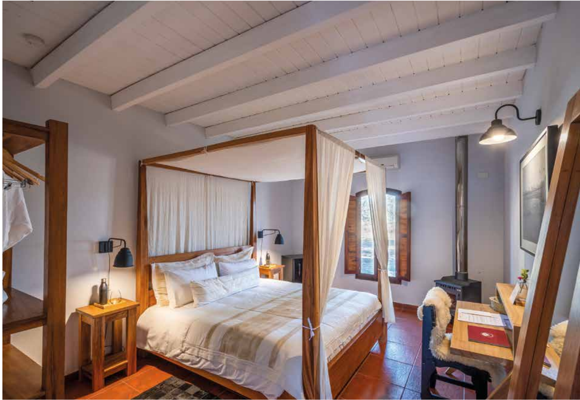
Santiago del Estero offers 11 en-suite rooms, some single and some double; all are furnished with king-size beds, air-conditioning, heating, and room safes.