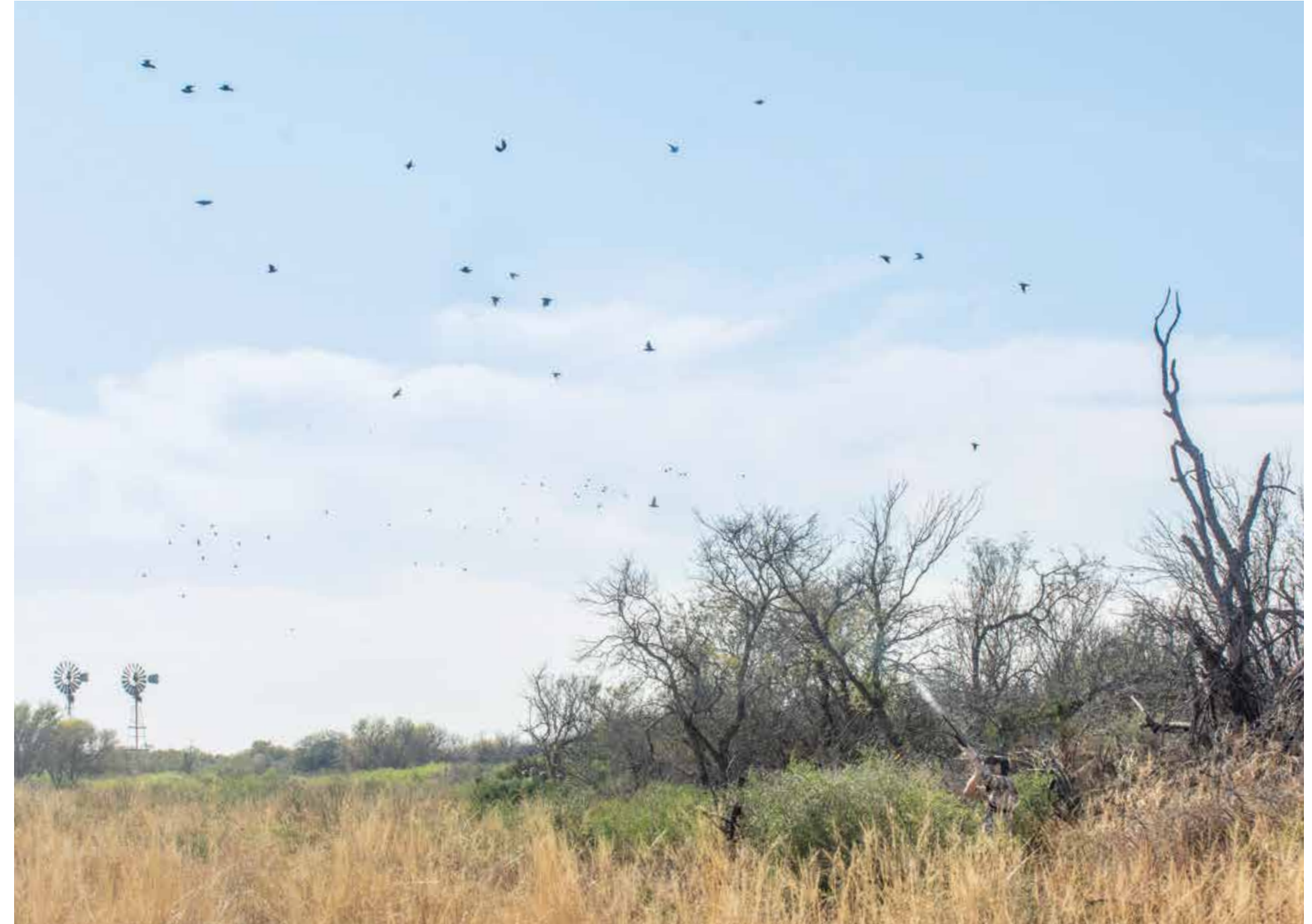
Waves and waves of doves that fly all day every day- it truly must be seen to be believed.