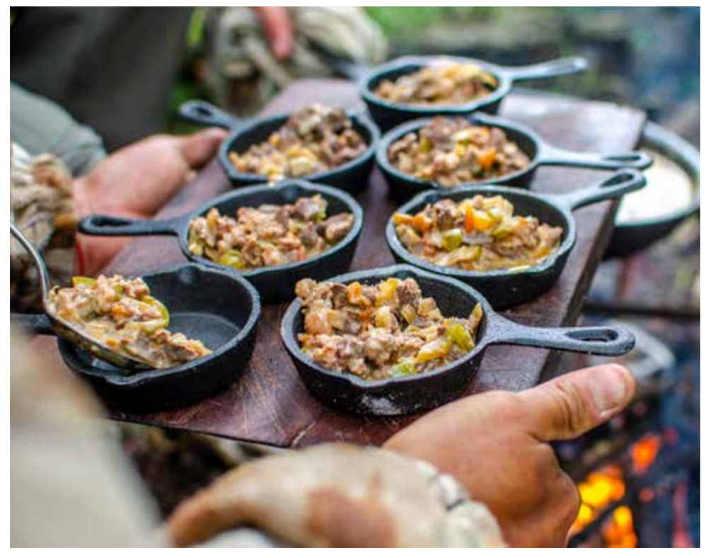
Fisteky (dove & black beer); a legend in out Córdoba fields.