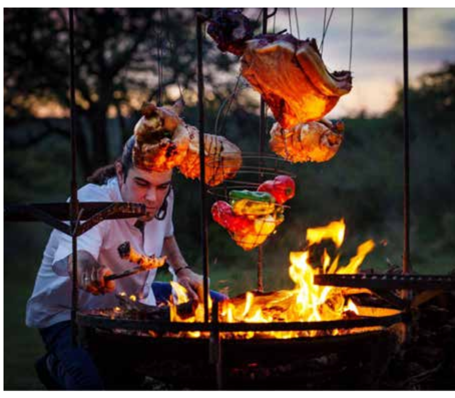
Open live fire cuisine at Córdoba Lodge, where we smoke & cook our meets and vegetables.

Asados, fresh-baked bread, and delicious desserts.