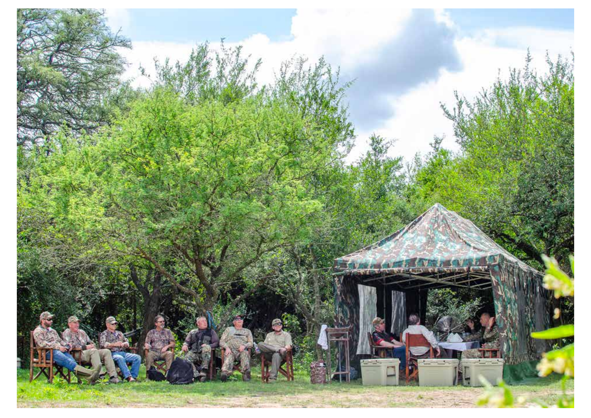
Safari-style tented lunch in the field assures a full day of hunting and no time lost driving to and from the lodge.