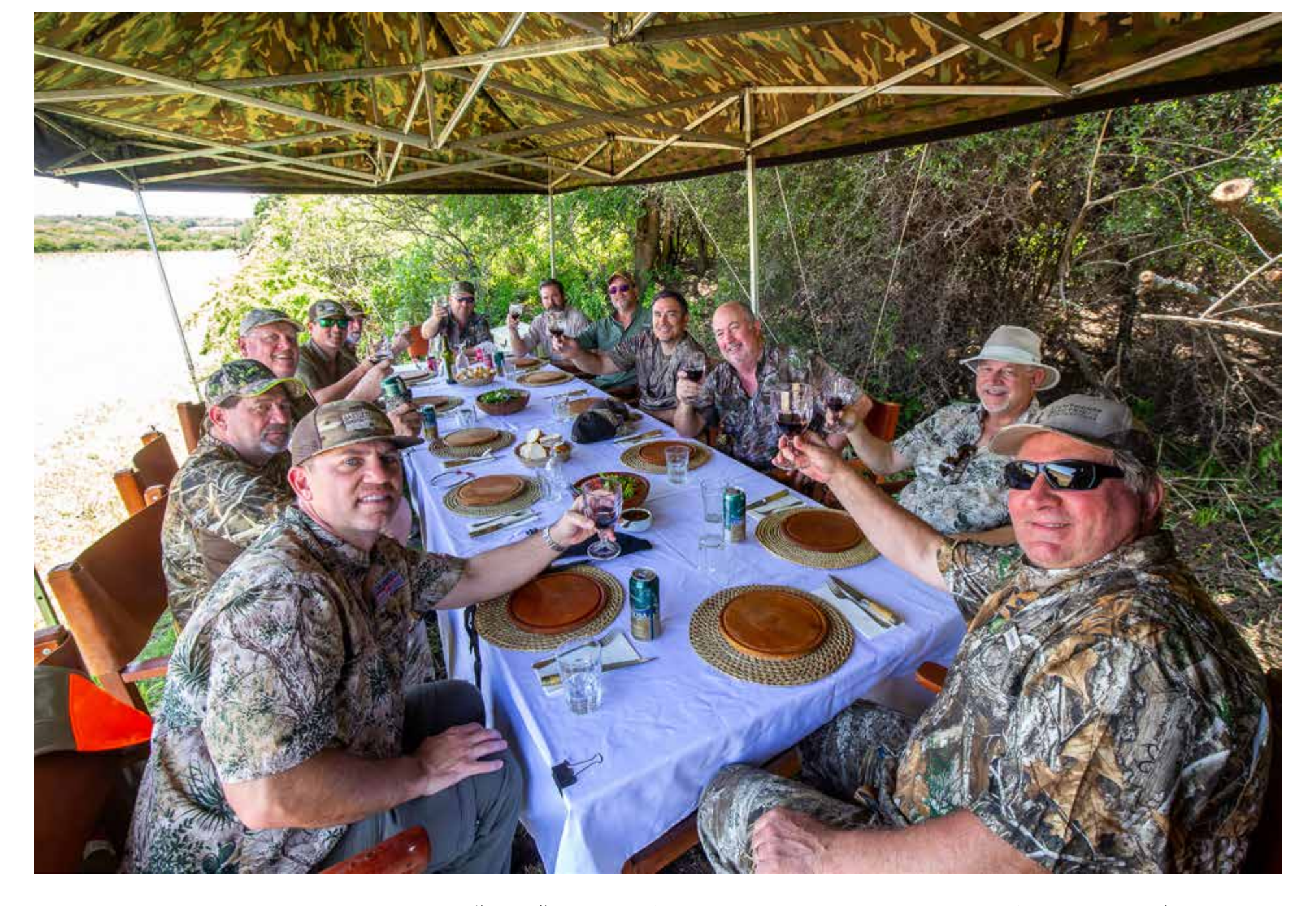
More than just a "lunch", our daily field experiences will be a high point of your stay. You'll be treated to an incredible Asado-style lunch featuring Argentina's world renowned beef and superb wines.