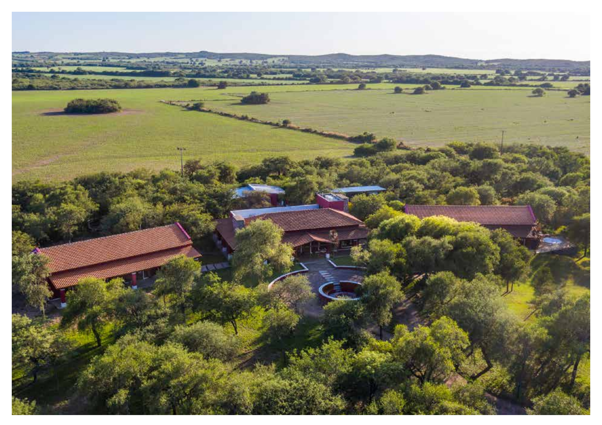
Córdoba Lodge features comforable shared rooms, fine service and superb logistics, right in the heart of Córdoba's high volume dove hunting.