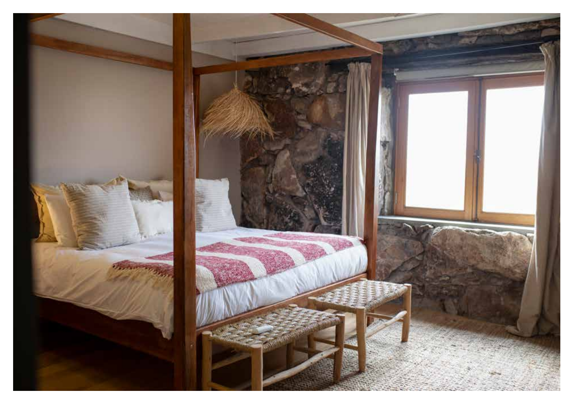
With 5 beautifully appointed guest rooms, all with en suite bathrooms, the lodge comfortably hosts up to 10 guests and is the perfect venue for small parties and families.