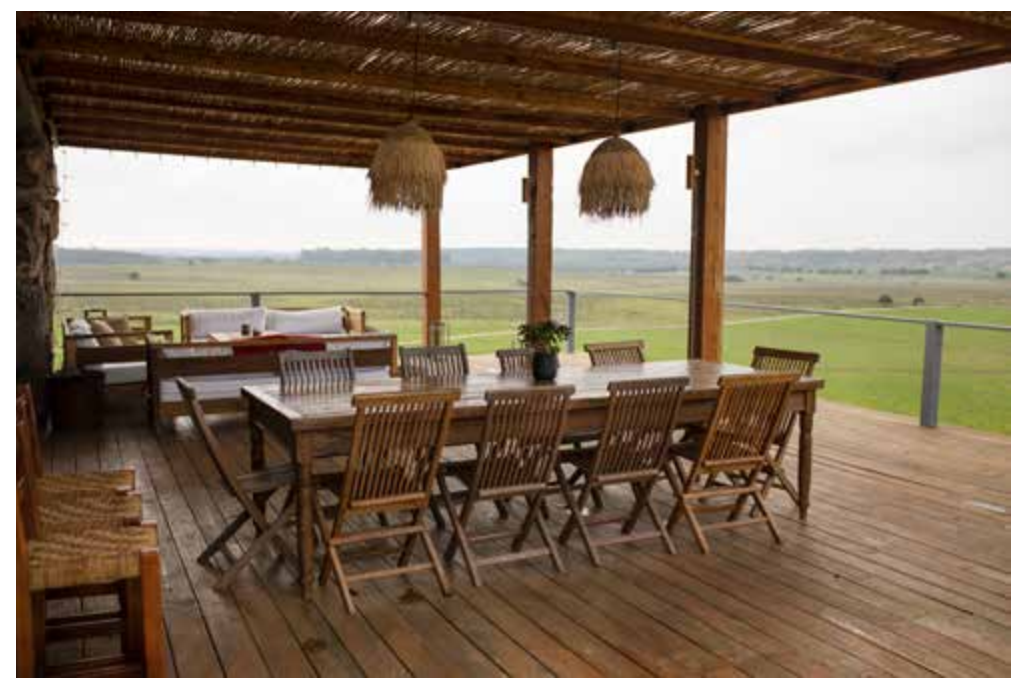
The lodges's comfort in its exterior spaces is ideal for those seeking to enjoy the days outdoors while savoring the amazing views.

Stone and wood dominate, and its comfort, both in its outdoor spaces and in the common areas, are perfect for a stay that seeks to enjoy the days outdoors and the comfort of its warm and spacious interior zones. Indoor and outdoor wood-burning stoves, and the possibility of having lunch or dinner comfortably near them, makes the idea of enjoying the days of good weather conditions in winter to the fullest part of the experience of staying at the lodge. The cuisine of excellence, the good wine, and a bar that is always open give a plus to the hunting experience, in which the service and excellence that characterize the David Denies' lodges are the seals of quality.