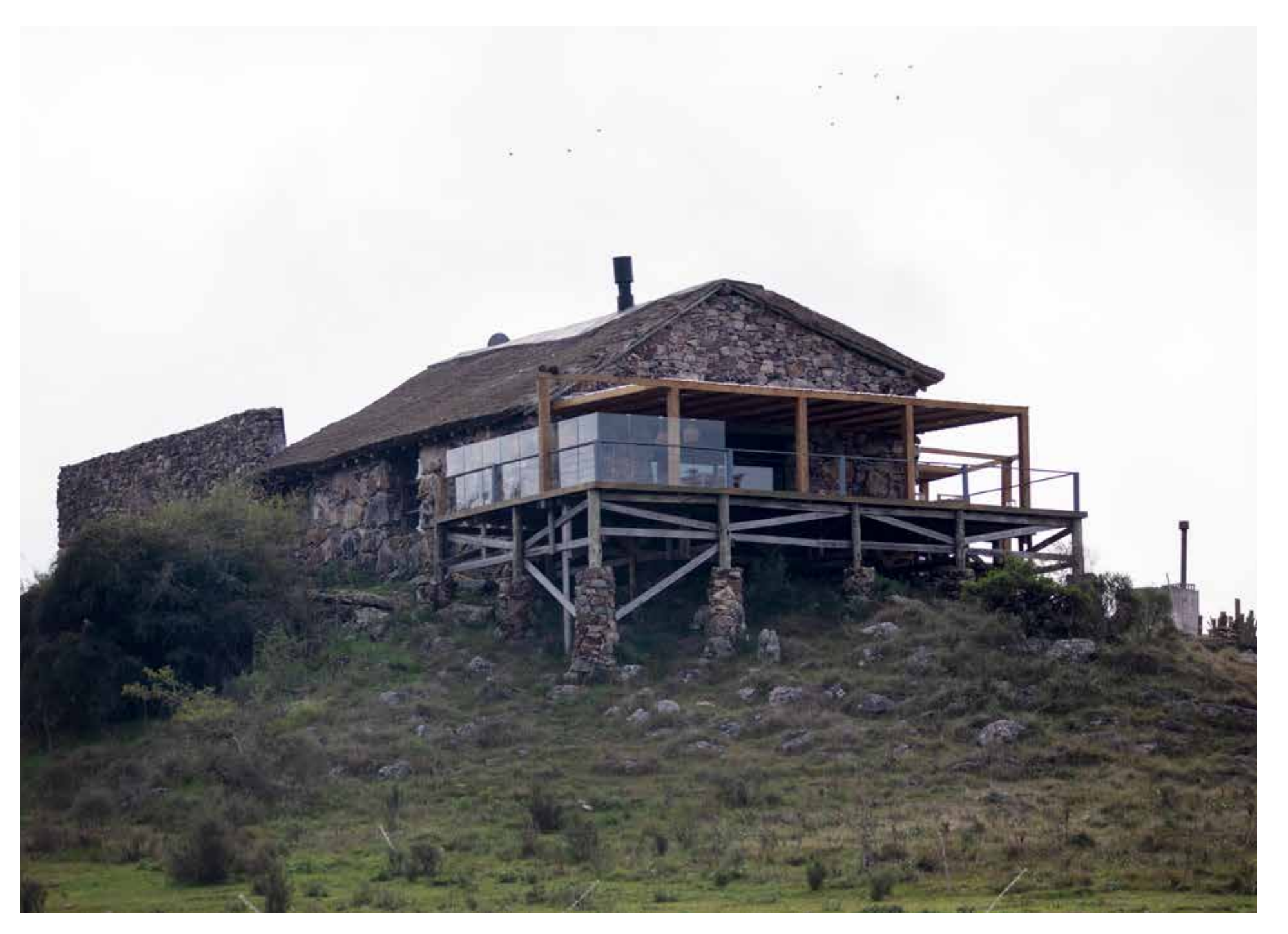
The stone house, handcrafted by local stonemasons, gives the construction a character of eternal solidity.