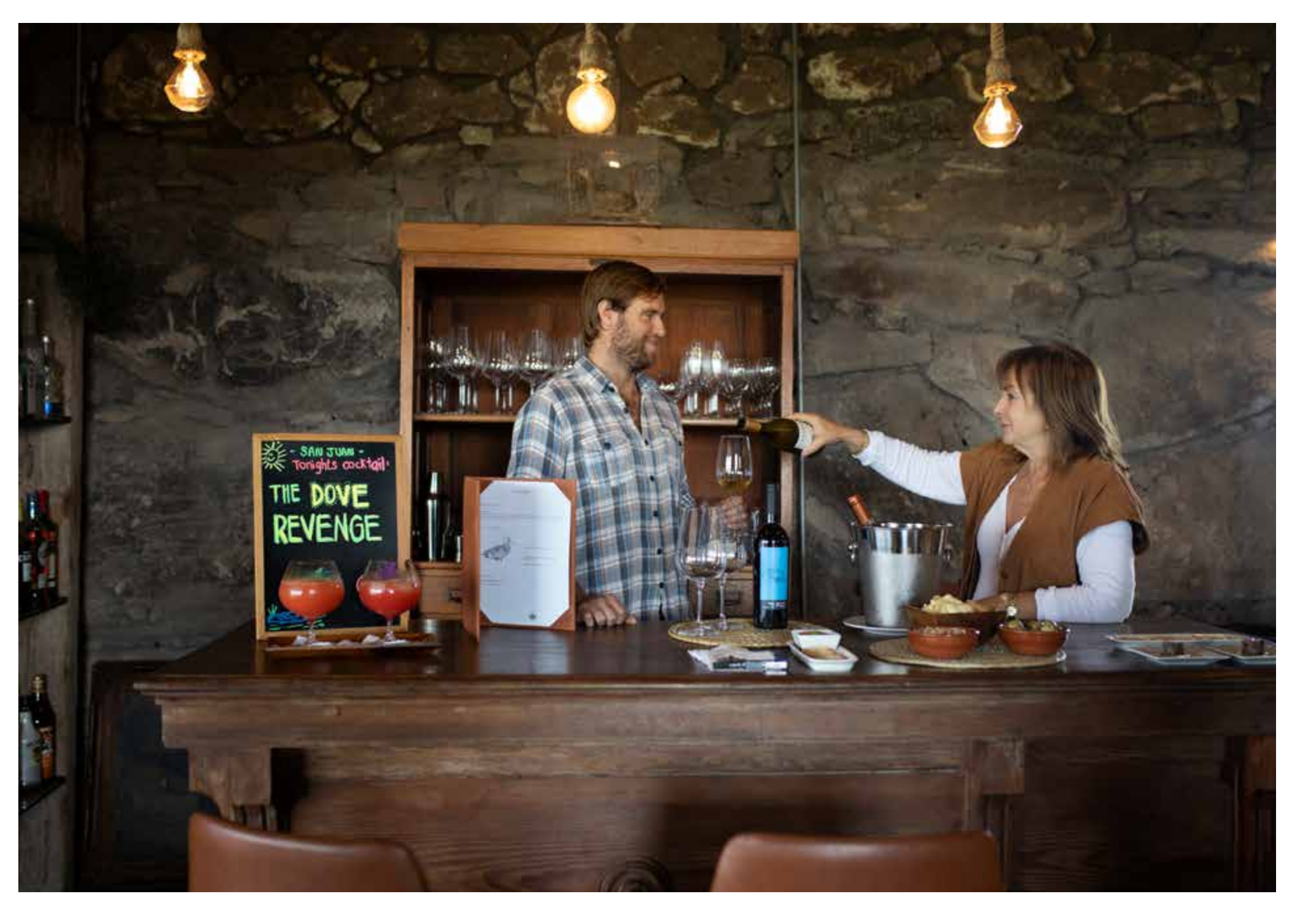
As a genuinely family-operated lodge, you can expect a warm and welcoming atmosphere in every aspect of your stay.