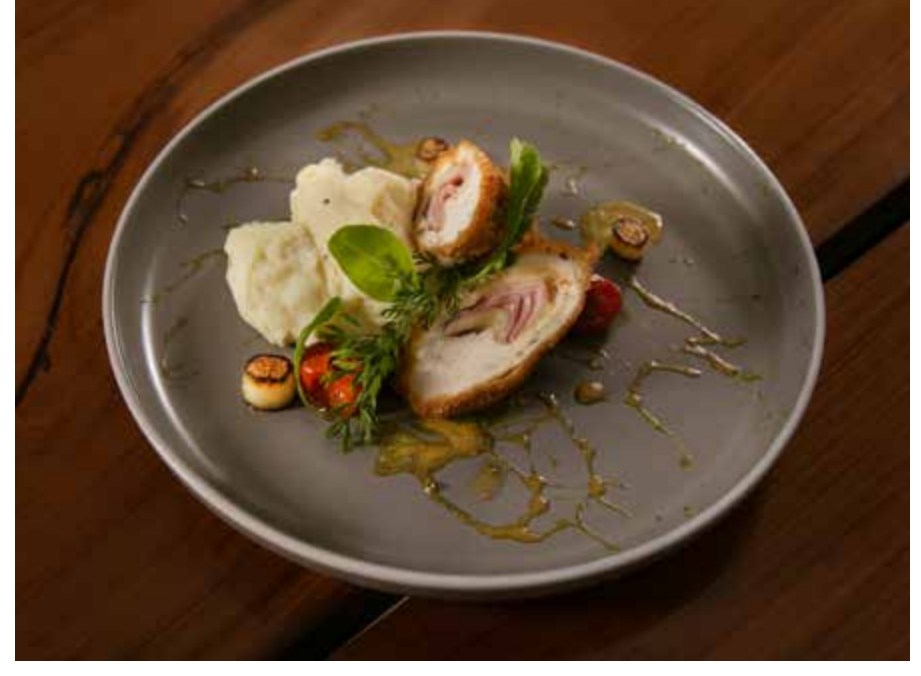
Cordon Bleu partridge with whipped mashed potatoes and curry sauce.