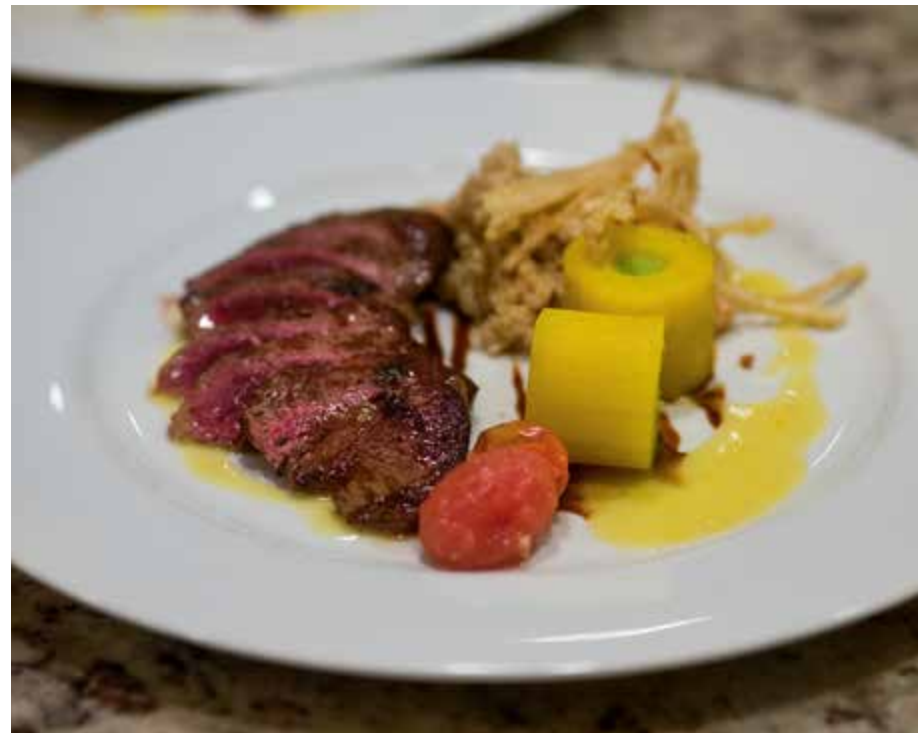
Medium rarete Grilled duck, with a zafron cassava, cherry tomatoes and quinoa salad.