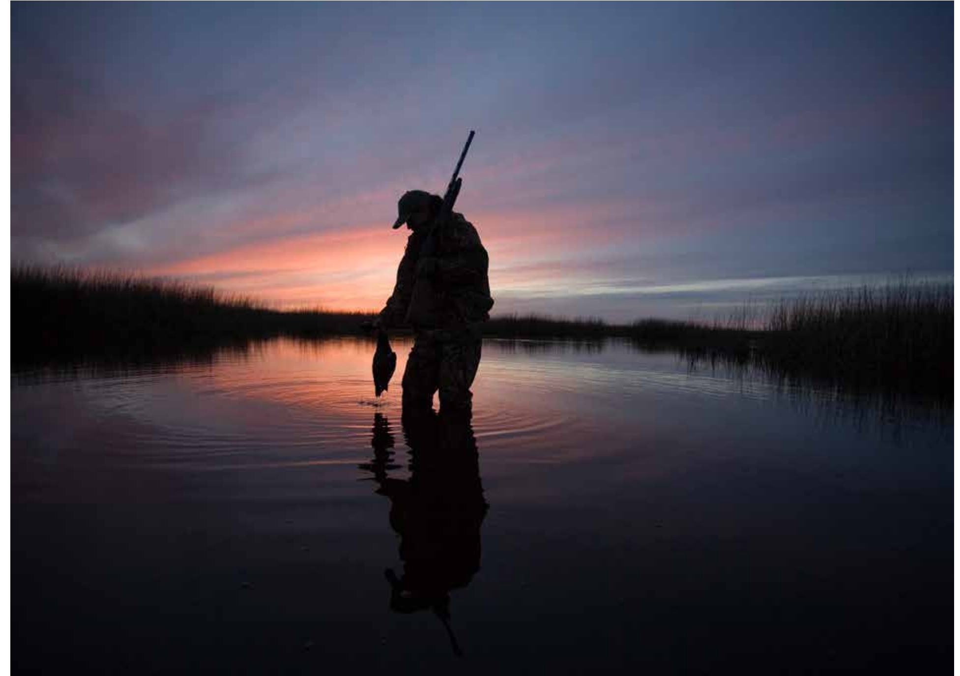
Hunting over decoys starts at first light, and continues until 10 a.m or fulfilment of your limits.