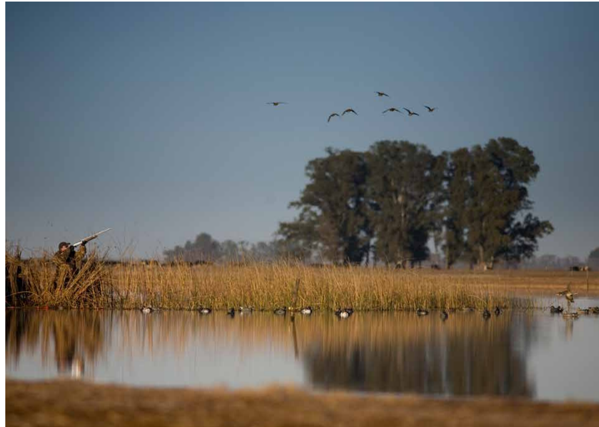
One of the many blind set ups, you'll typically find on our nearby lagoons.