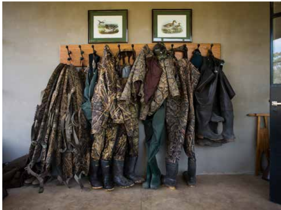
Waders are provided at the lodge at no extra charge.