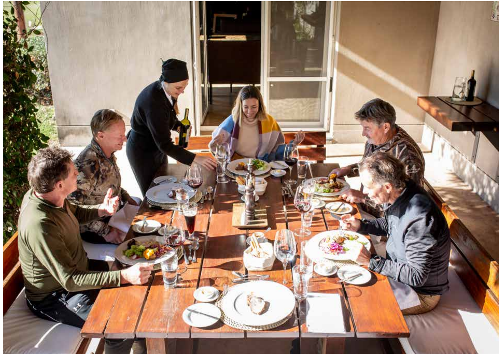
Luxurious living, à la carte menu, and impeccable service. Like all of our David Denies lodges, no detail is left to chance.