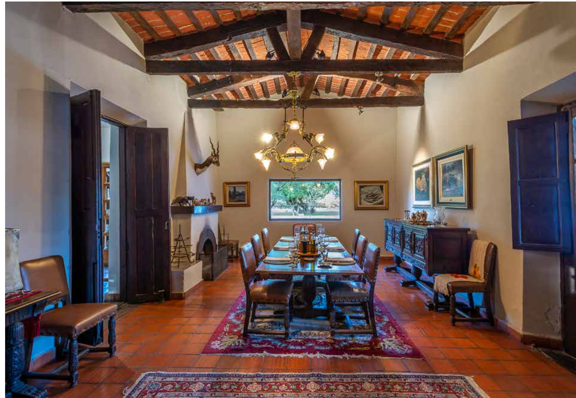
Upon arrival at La Torcaza Lodge, you will be immediately transported back in time. In this antique Jesuit Estancia, the atmosphere of history and elegance abounds.