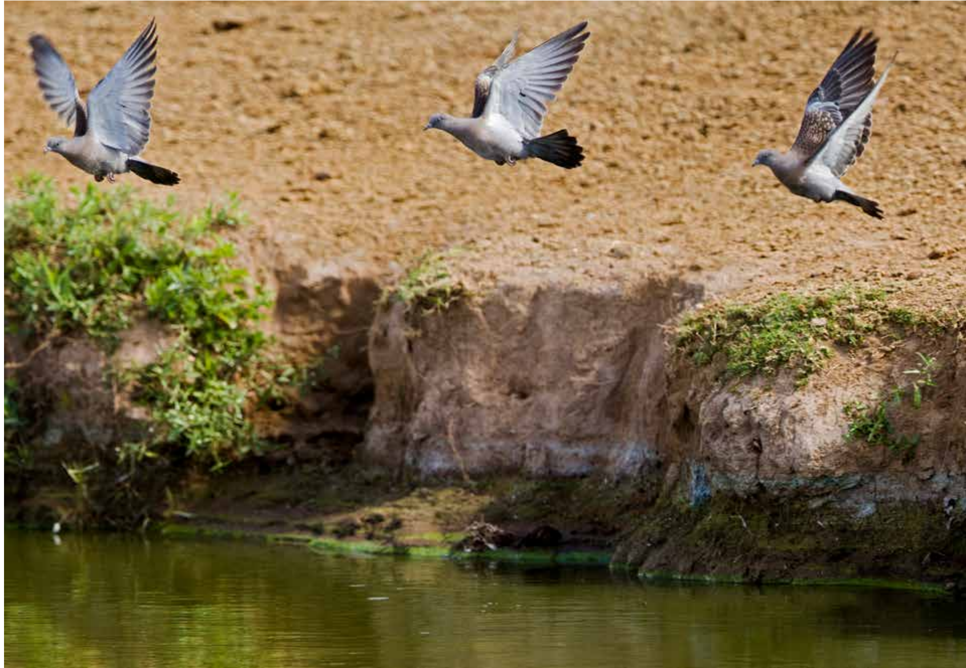
Pigeons not only fly fast and erratically, but they are also a smart and observant quarry, providing an all around sporting challenge over the decoy spread.