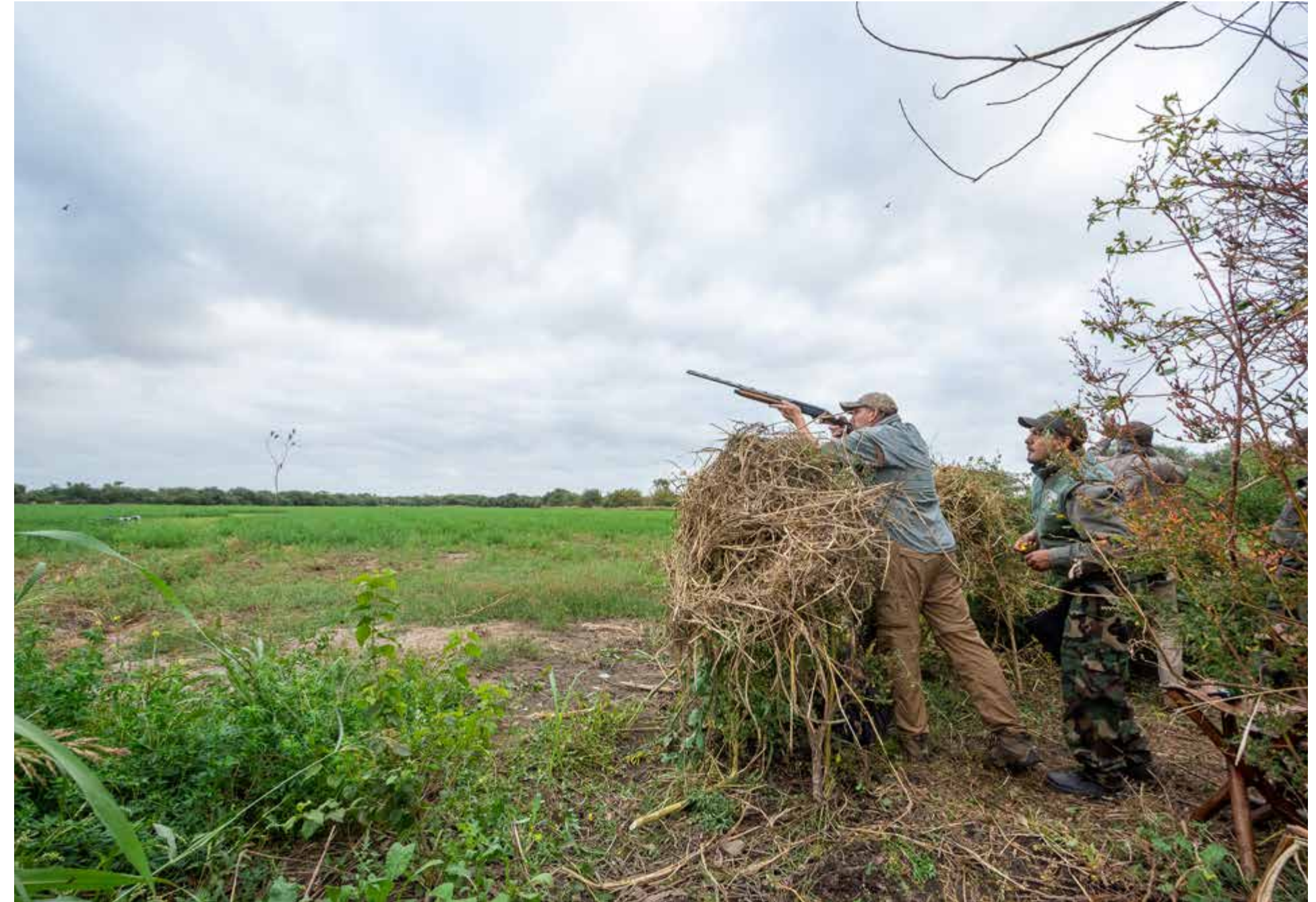
At La Torcaza, pigeon hunting takes place in traditional hunting style, from natural blinds over decoys, which are strategically placed based upon skilled scouting and planning, to ensure success.