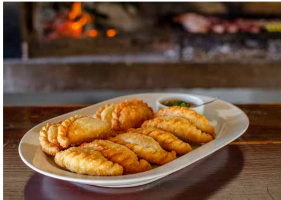
Our traditional Argentinean empanadas suffed with pigeon.