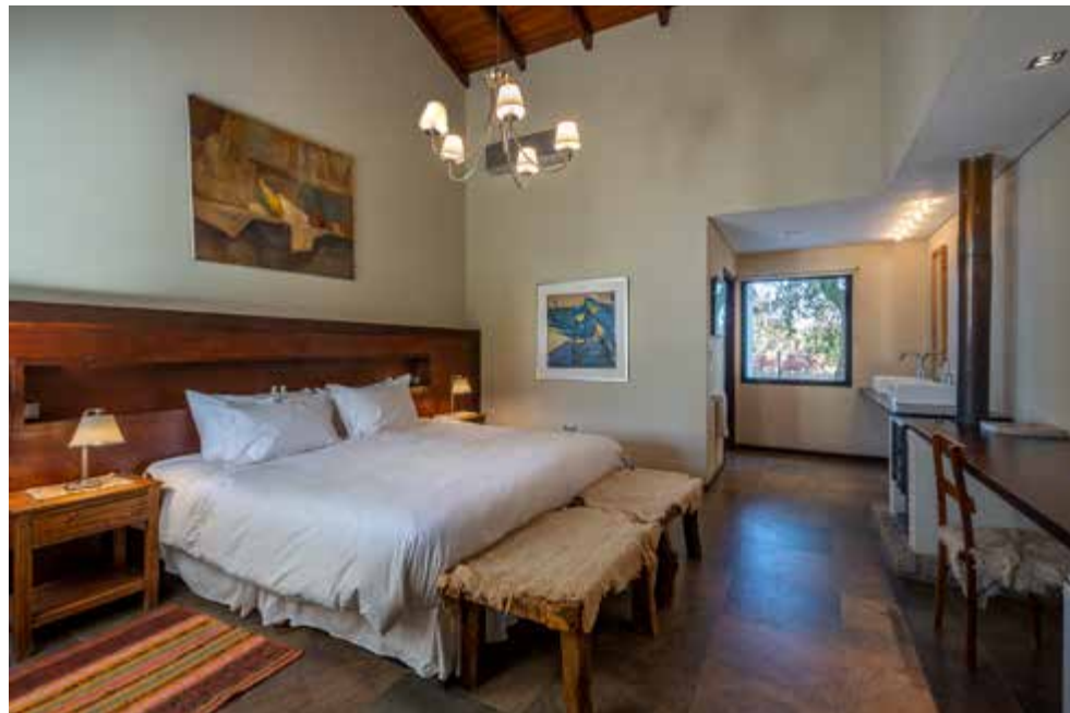
The lodge offers eight single rooms with King beds, and one double bedroom— each with a private bathroom.