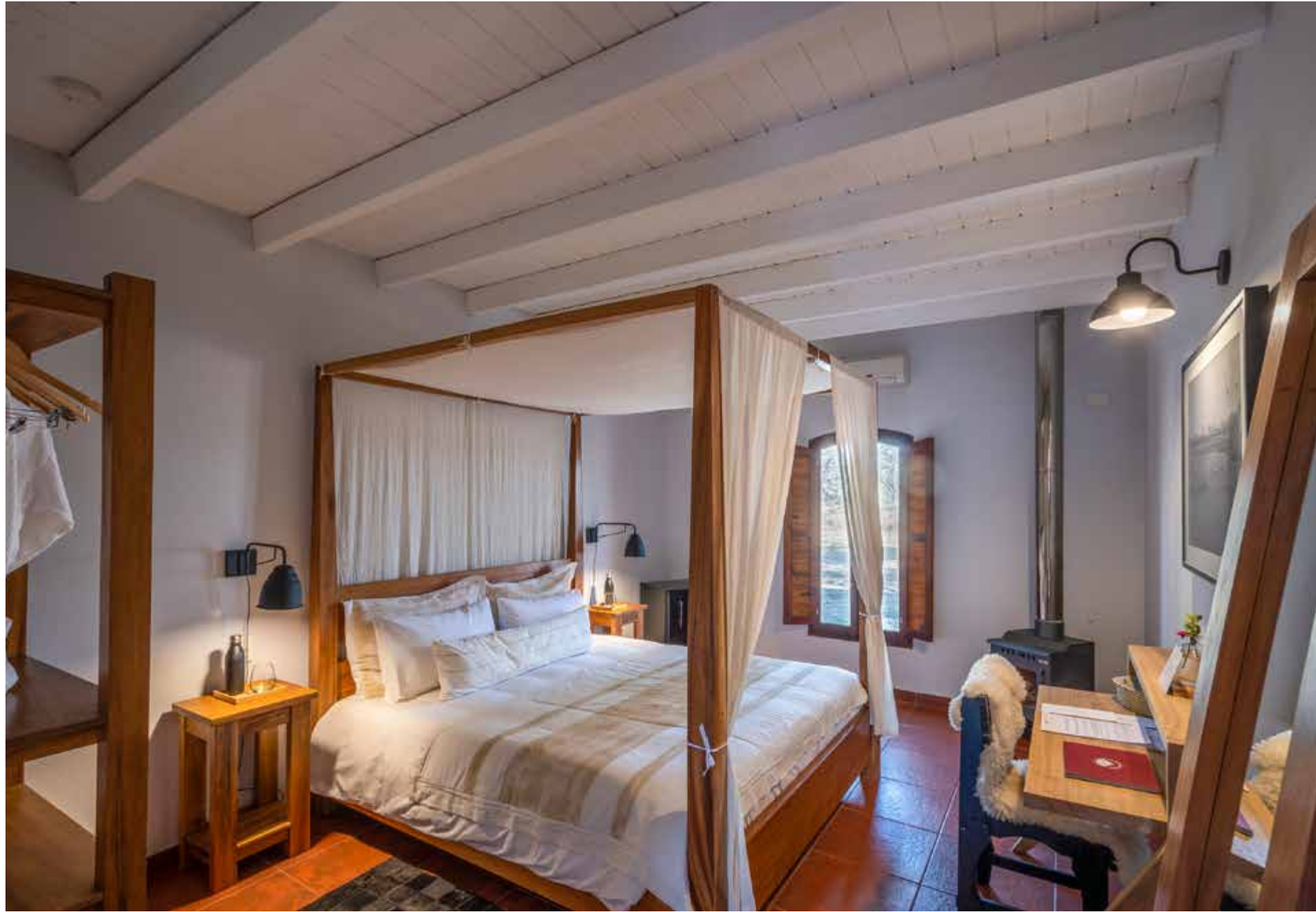
Santiago del Estero offers 11 en-suite rooms, some single and some double; all are furnished with king-size beds, air-conditioning, heating, and room safes.