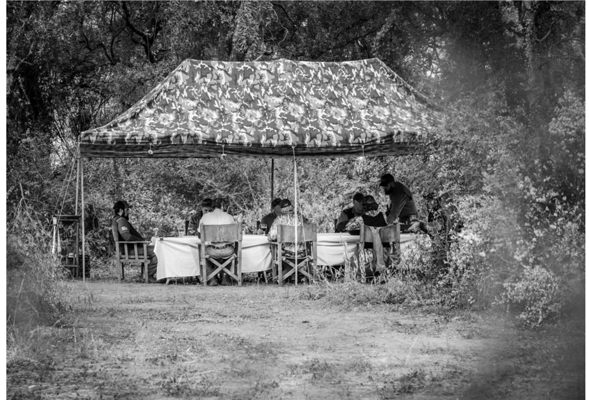
On pigeon hunts, you'll spend the entire day in the field. While you're shooting, we'll ready tents and Asado for a delicious meal.