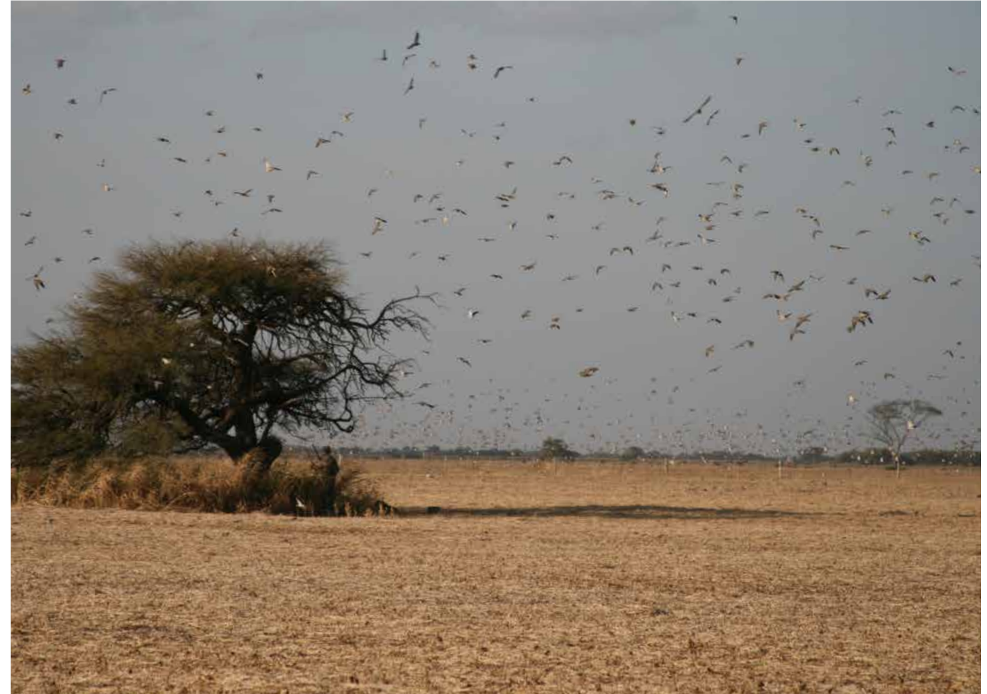
Waves and waves of doves that fly all day every day- it truly must be seen to be believed.