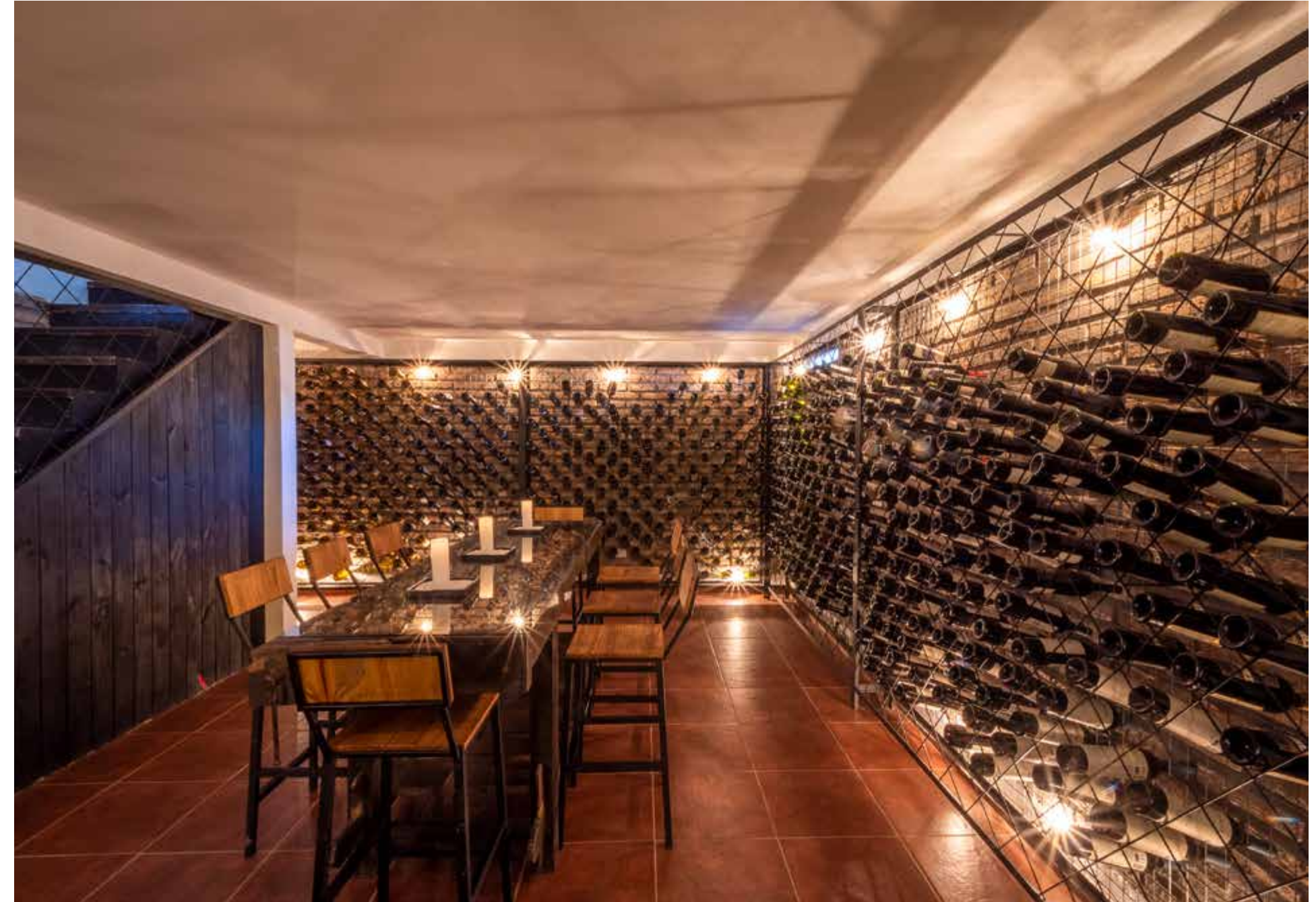
The facilities and amenities at the lodge are without peer in the shooting world, featuring an outdoor pool, a magnificent wine cellar and TV room.