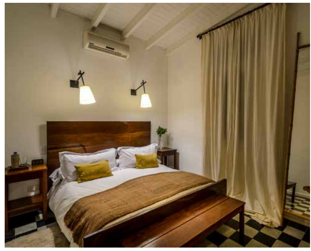
Pica Zuro offers well-appointed elegant rooms, with private bath.