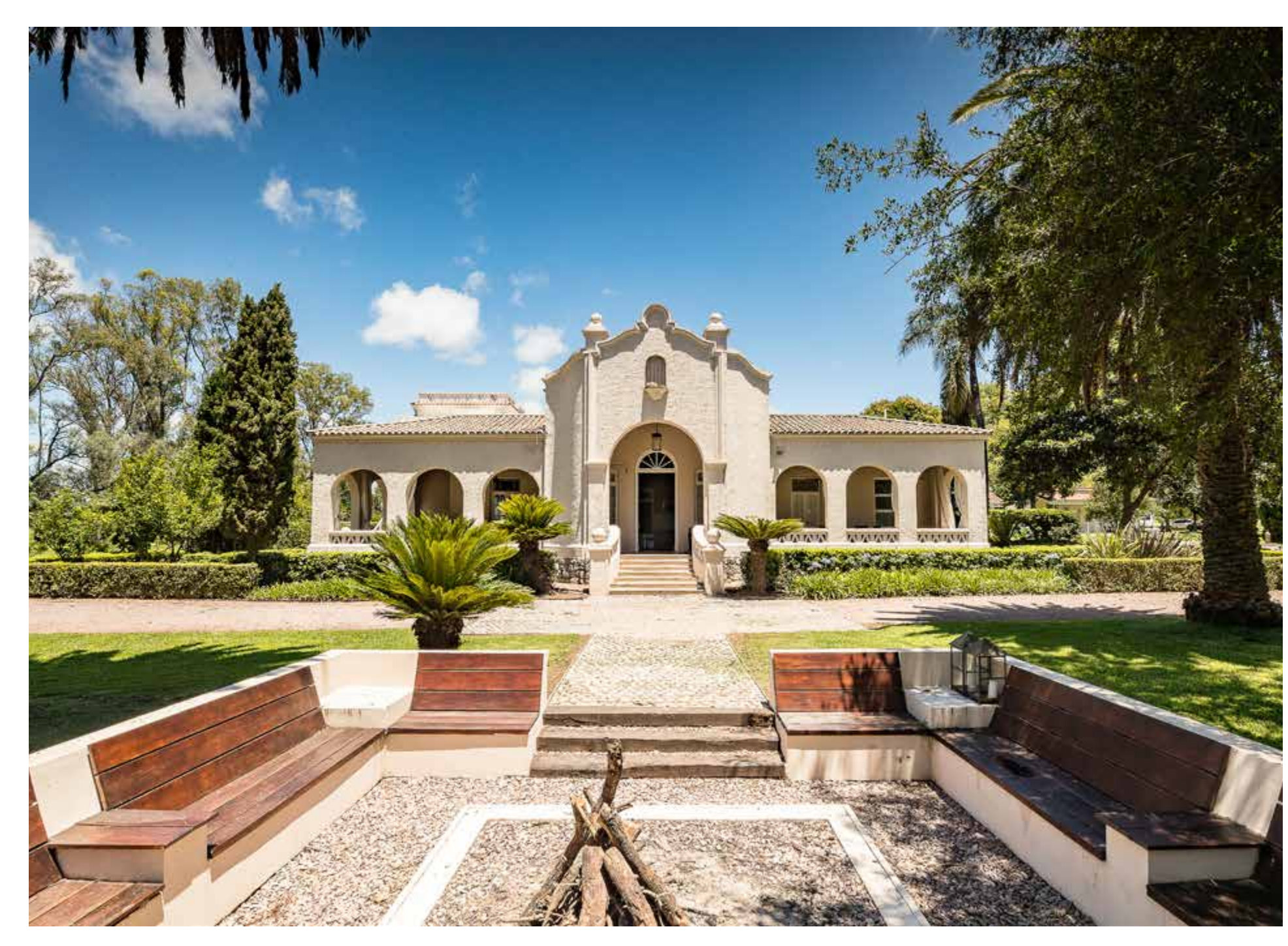
Pica Zuro Lodge offers the ultimate venue for the traveling wing-shooter.