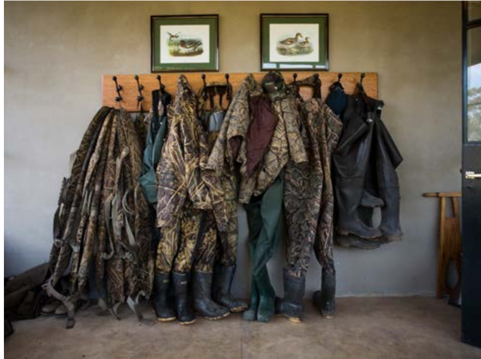
Waders are provided at the lodge at no extra charge.