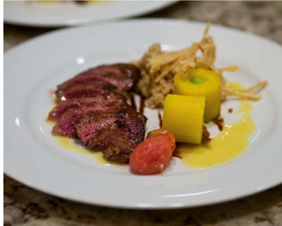
Medium rarete Grilled duck, with a zafron cassava, cherry tomatoes and quinoa salad.