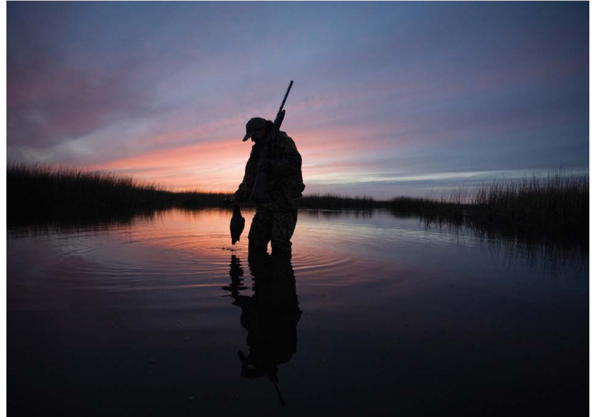
Hunting over decoys starts at first light, and continues until 10 a.m or fulfilment of your limits.