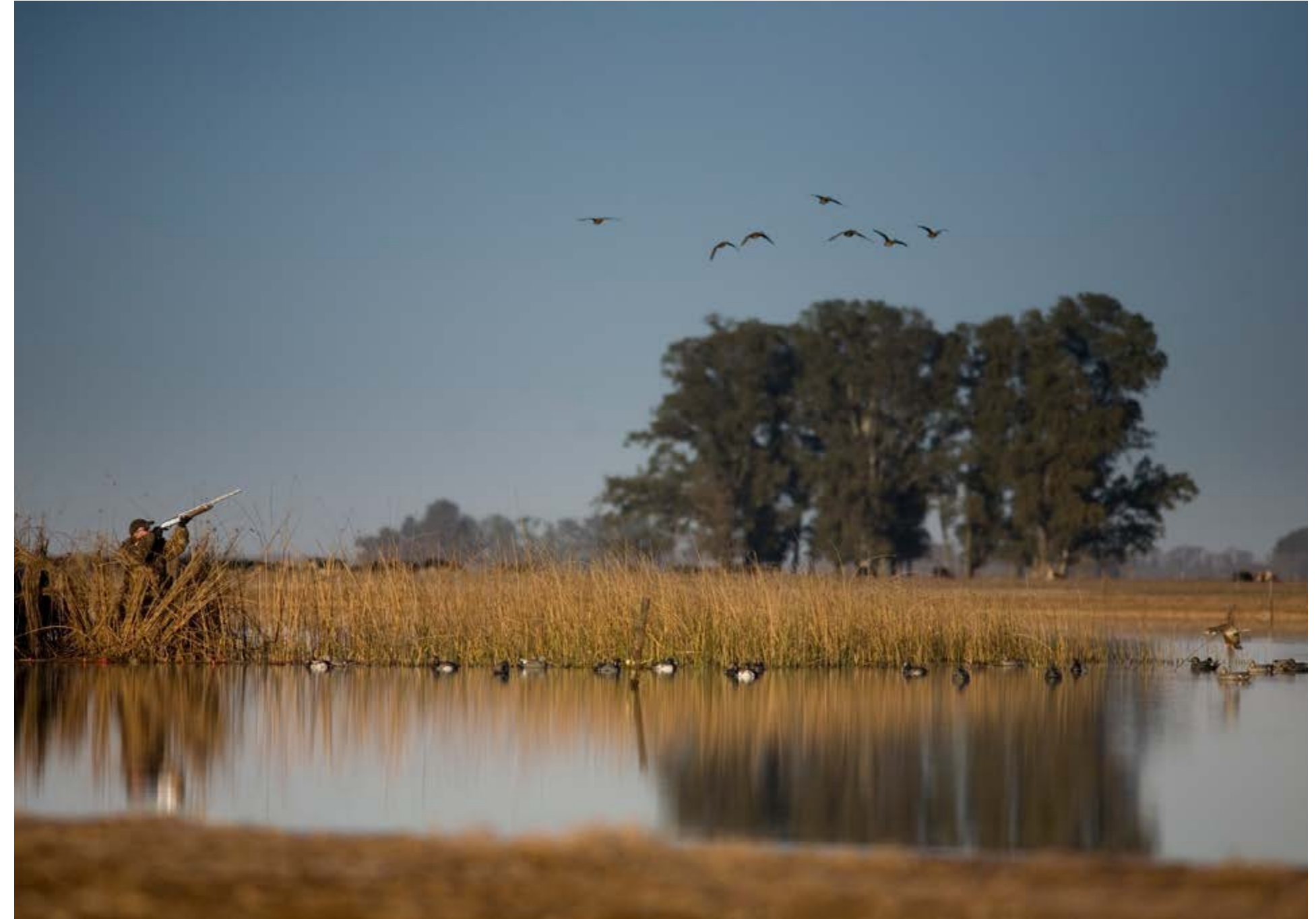
One of the many blind set ups, you'll typically find on our nearby lagoons.