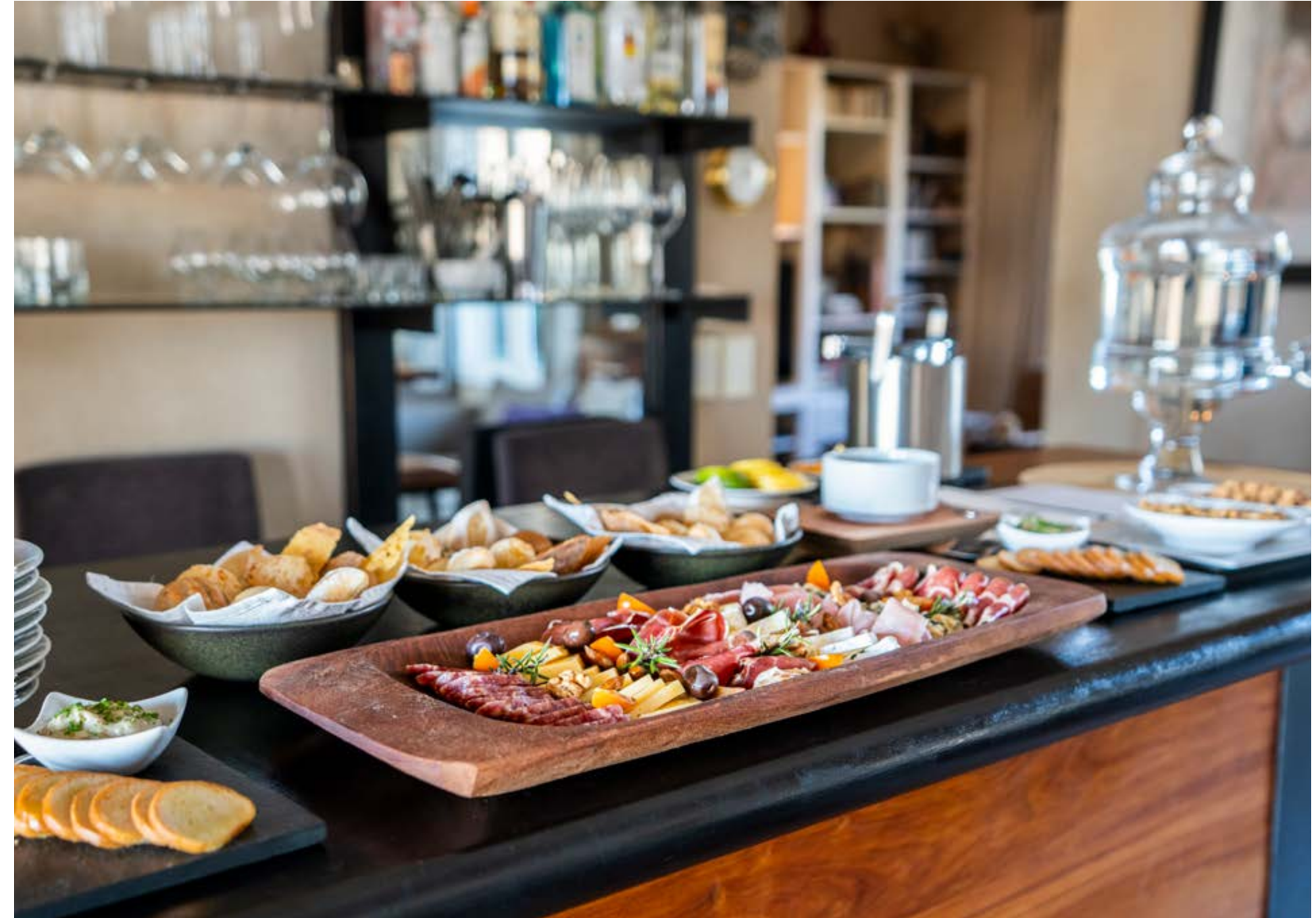
Luxurious living, à la carte menu, and impeccable service. Like all of our David Denies lodges, no detail is left to chance.