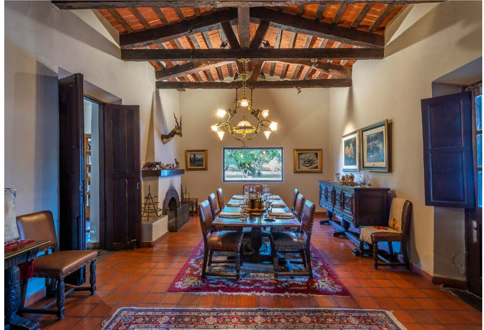
Upon arrival at La Torcaza Lodge, you will be immediately transported back in time. In this antique Jesuit Estancia, the atmosphere of history and elegance abounds.