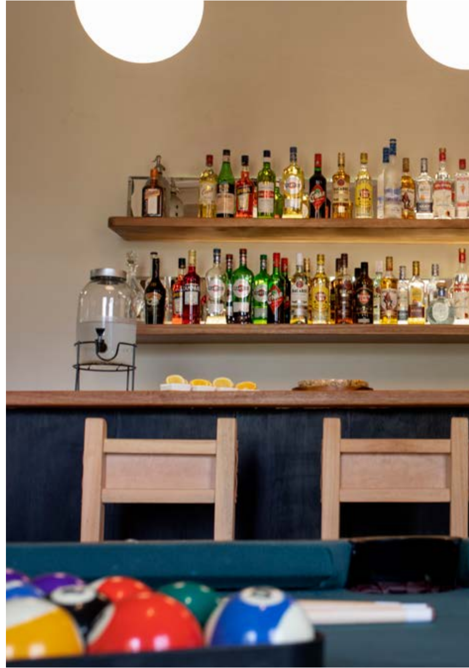
The lodge's facilities are second to none, boasting a brand new game room complete with a billiards table and adjacent bar.