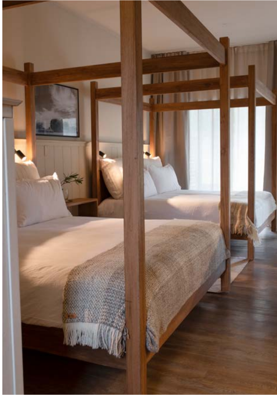
Carmelo has 10 beautifully appointed and fully-equipped en suite rooms, with Queen and King-size beds.