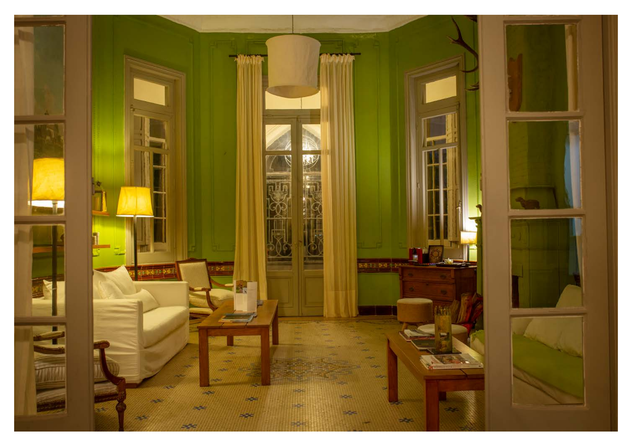
Housed in an elegant historic mansion, with comfortable areas to relax and enjoy views of the bucolic countryside just outside the windows.