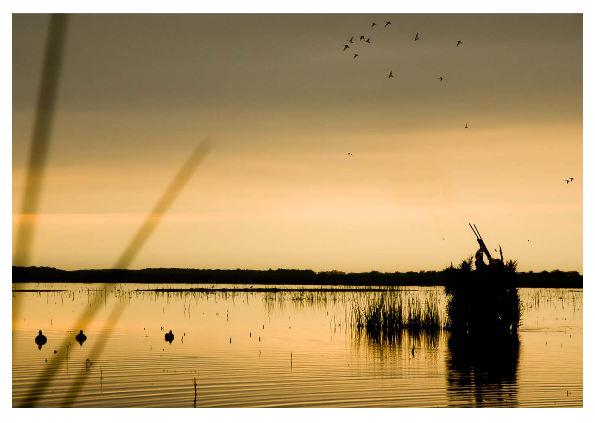
Duck hunting at Uruguay Lodge takes place in one of our nearby ponds or lagoons, where species found only in this part of the world will challenge you throughout the morning.