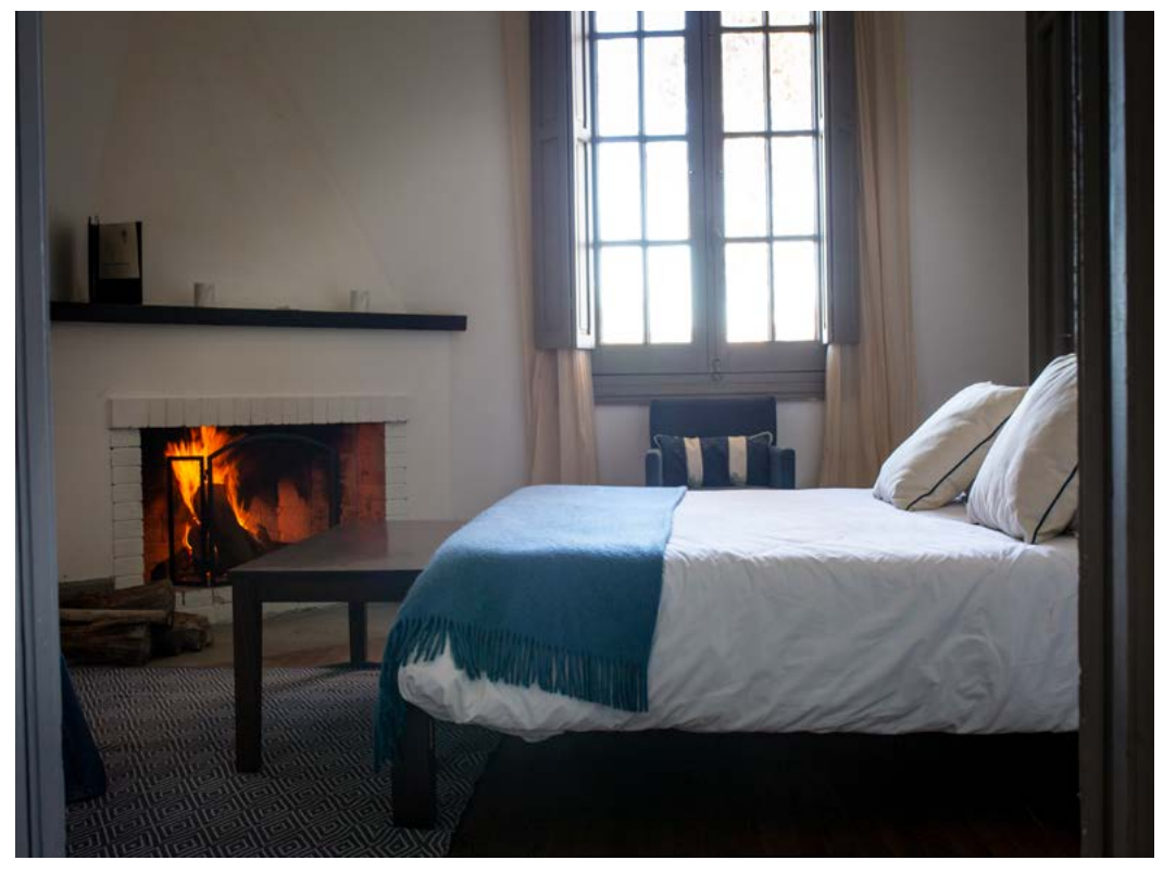
Six grand bedrooms will accommodate up to 8 hunters in a mix of single and double rooms.