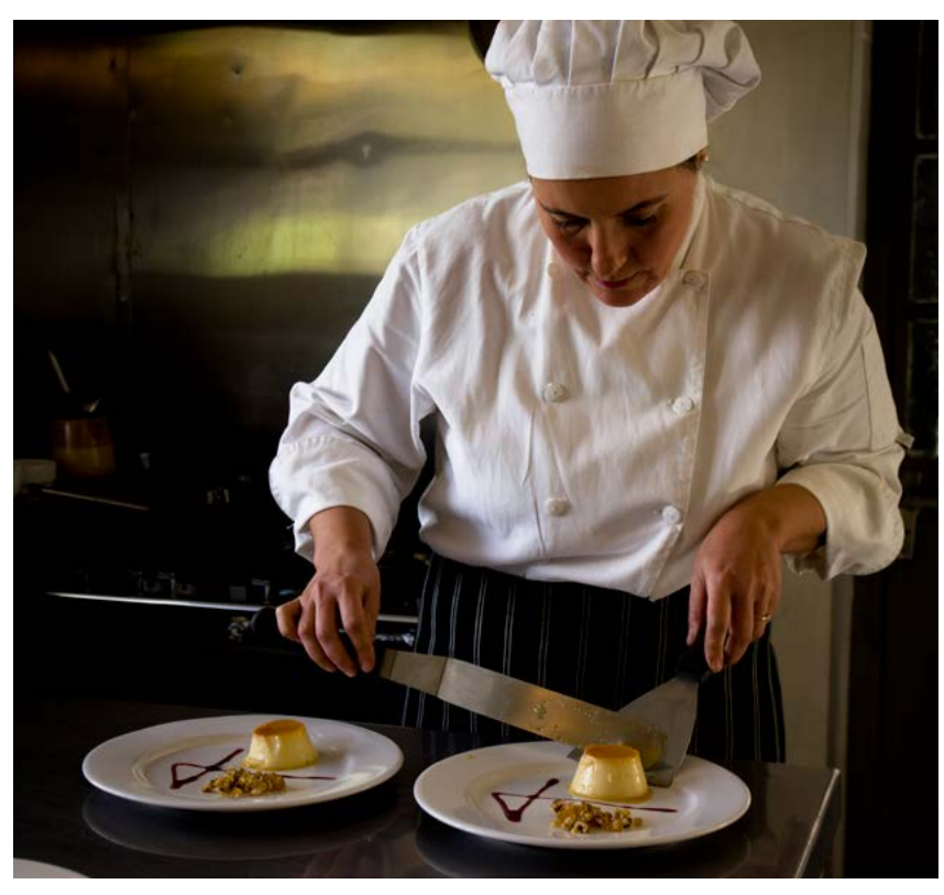
A top-notch team of experienced chefs with an artisan's touch, will create dishes for you to enjoy.