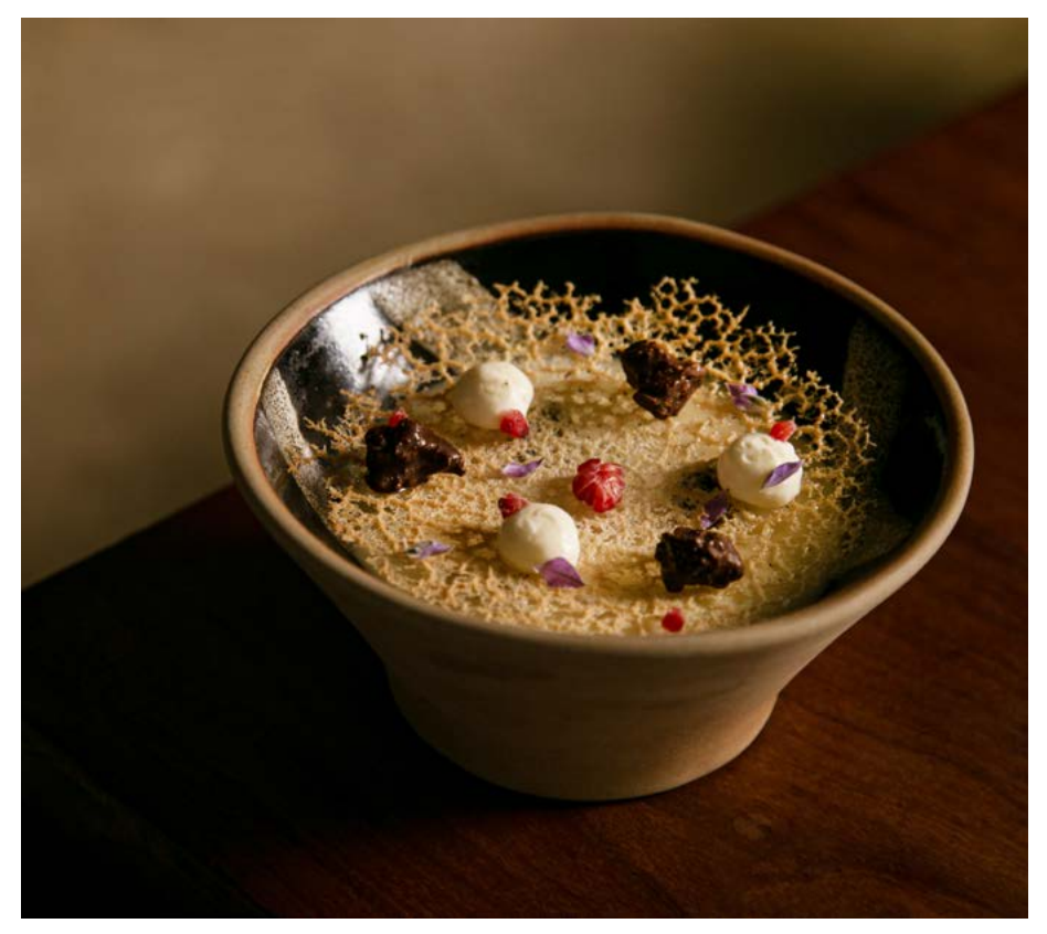
Panna Cotta dessert.