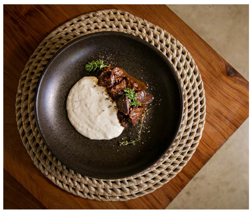
Pigeon Ragú with white polenta.