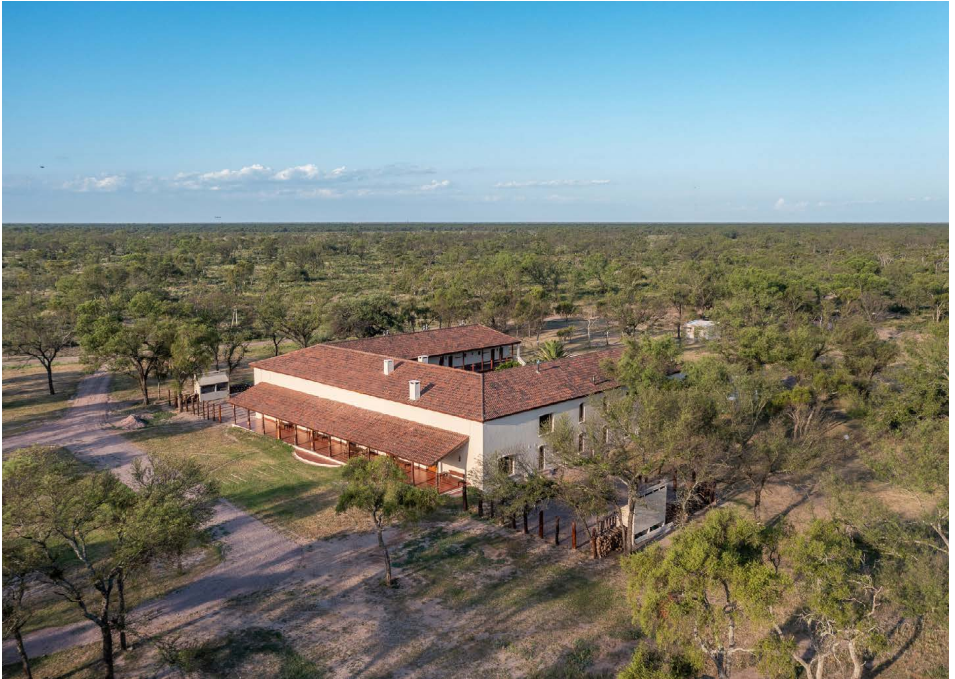
A sprawling Spanish-style manse on the vast frontier of dove and pigeon shooting.