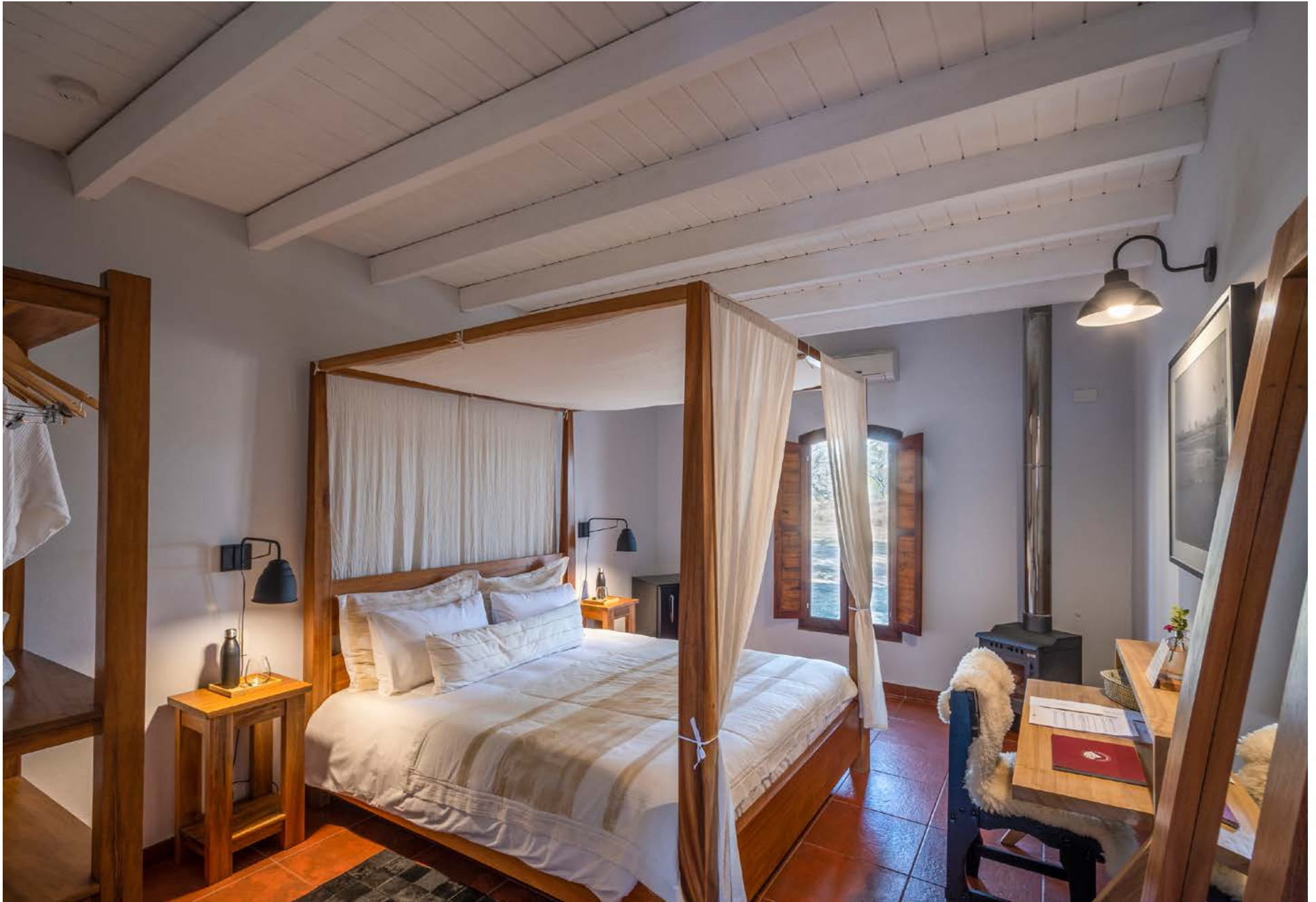
Santiago del Estero offers 11 en-suite rooms, some single and some double; all are furnished with king-size beds, air-conditioning, heating, and room safes.