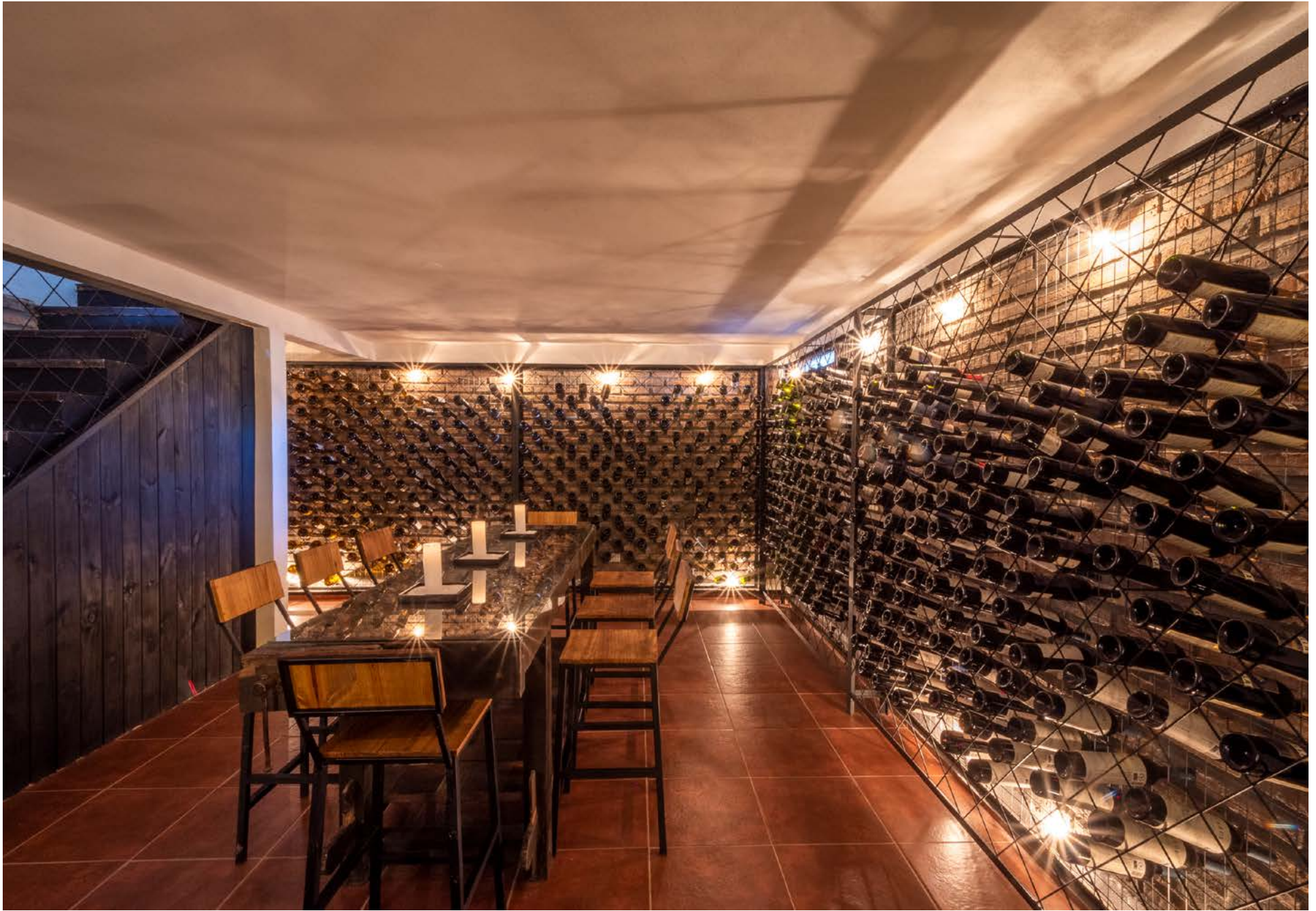
The facilities and amenities at the lodge are without peer in the shooting world, featuring an outdoor pool, a magnificent wine cellar and TV room.