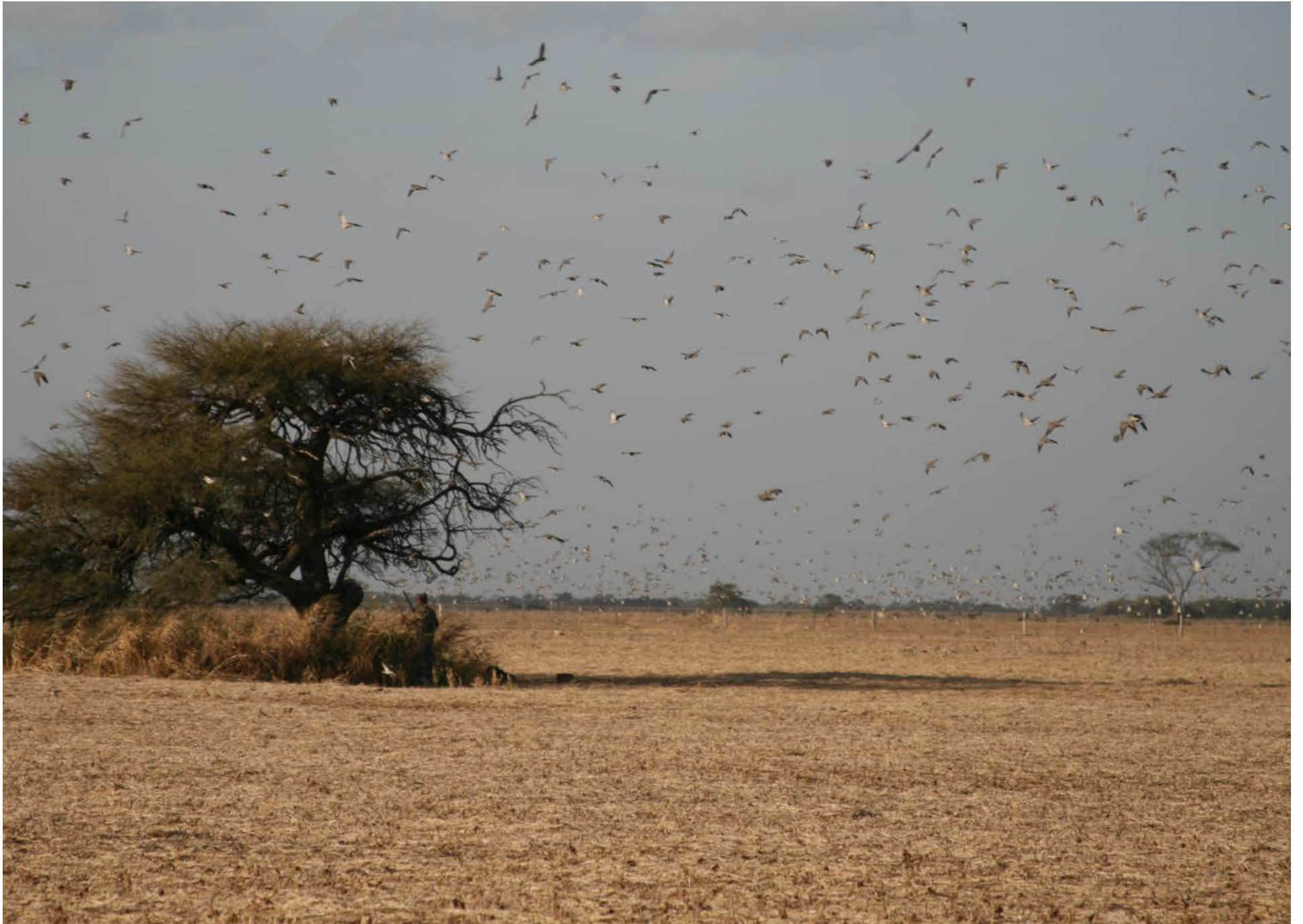
Waves and waves of doves that fly all day every day- it truly must be seen to be believed.