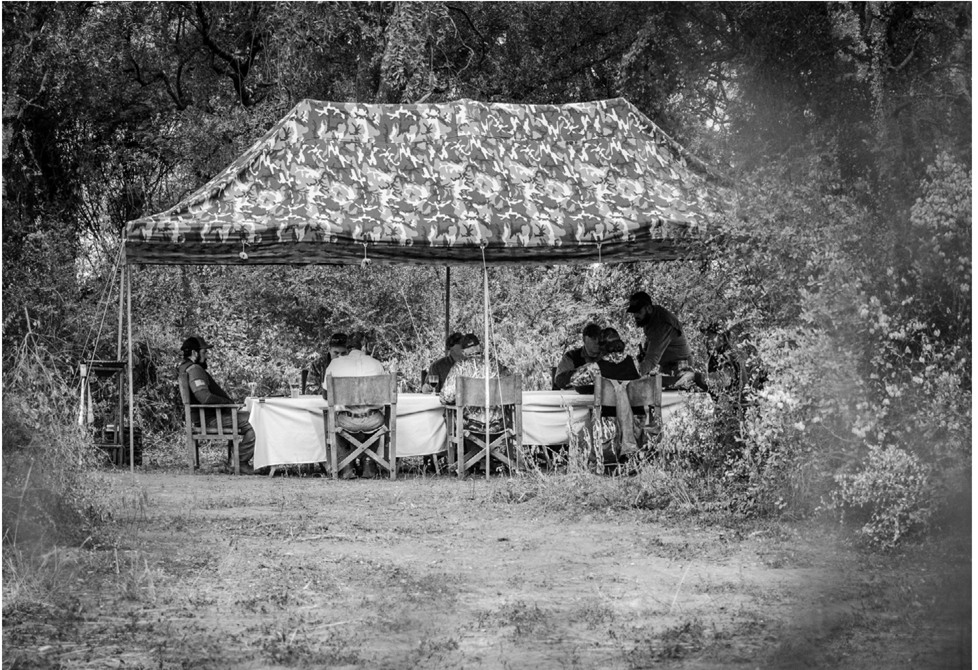
On pigeon hunts, you'll spend the entire day in the field. While you're shooting, we'll ready tents and Asado for a delicious, shady meal.