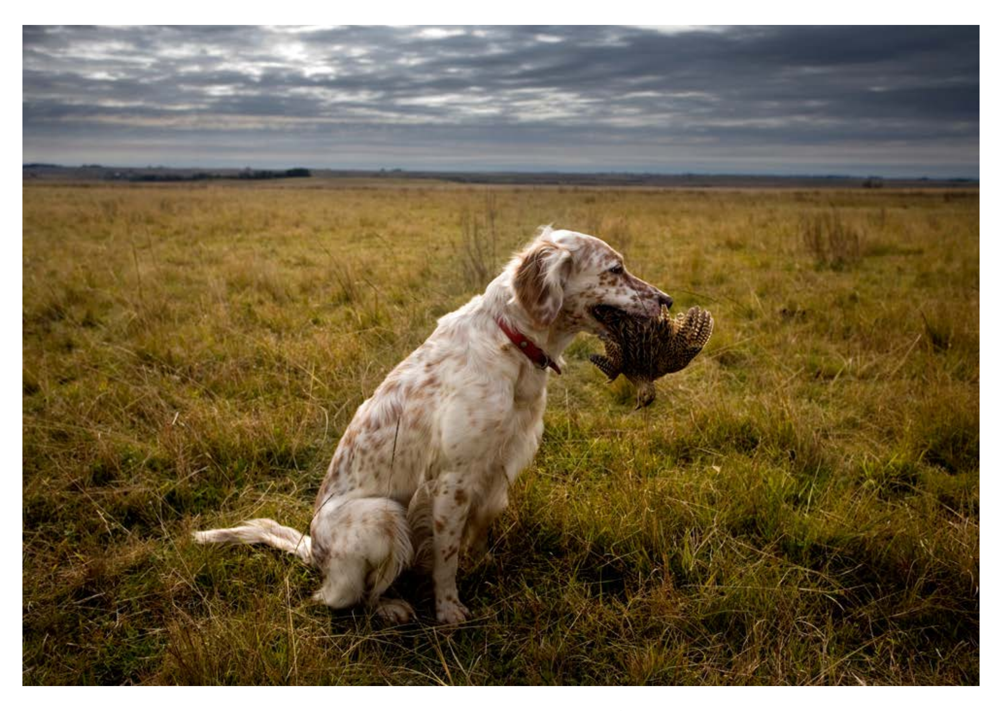
Most mornings at San Juan are spent pursuing hard flying perdiz, across short grass pastures over well trained English pointers and English setters.