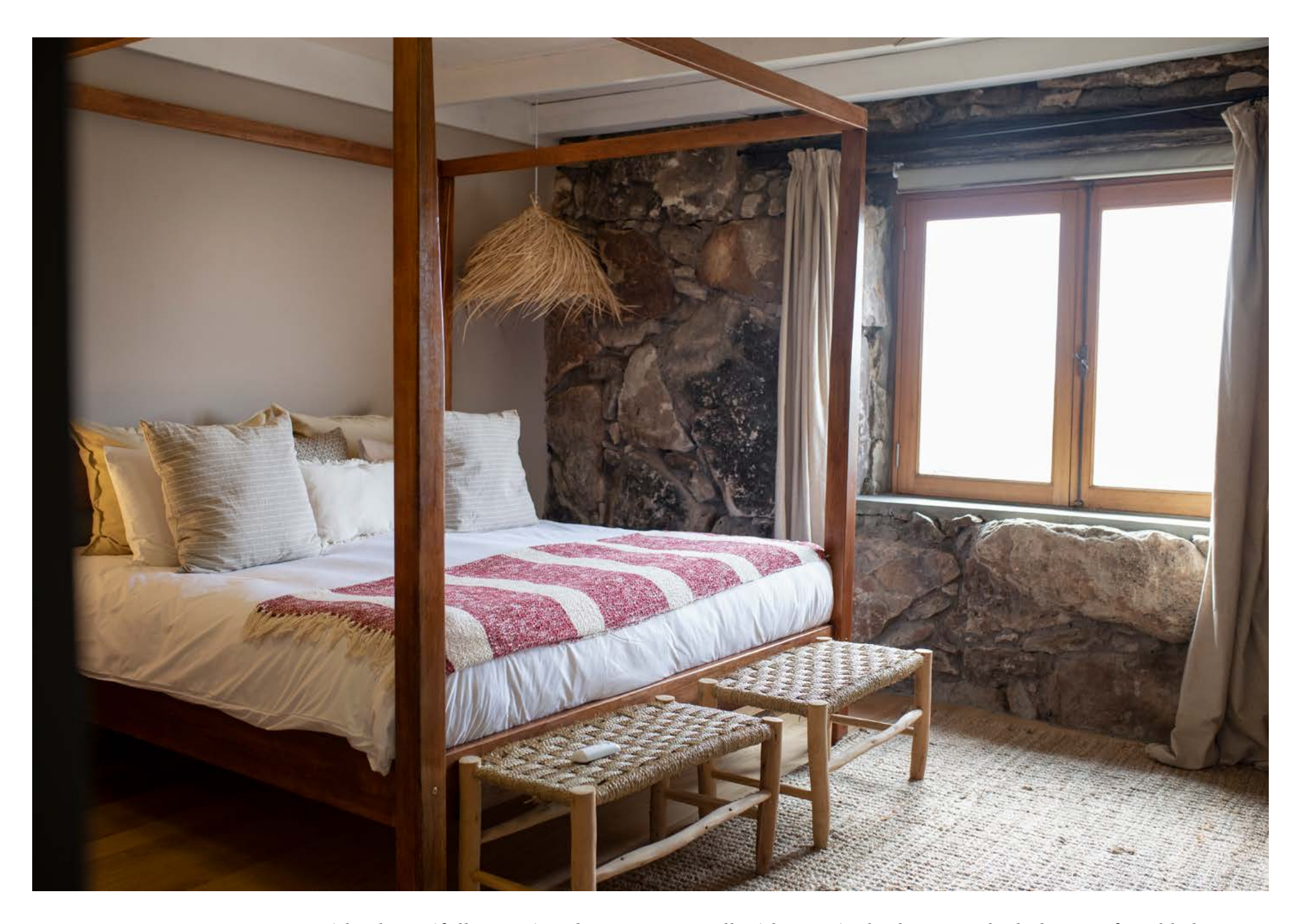
With 5 beautifully appointed guest rooms, all with en suite bathrooms, the lodge comfortably hosts up to 10 guests and is the perfect venue for small parties and families.