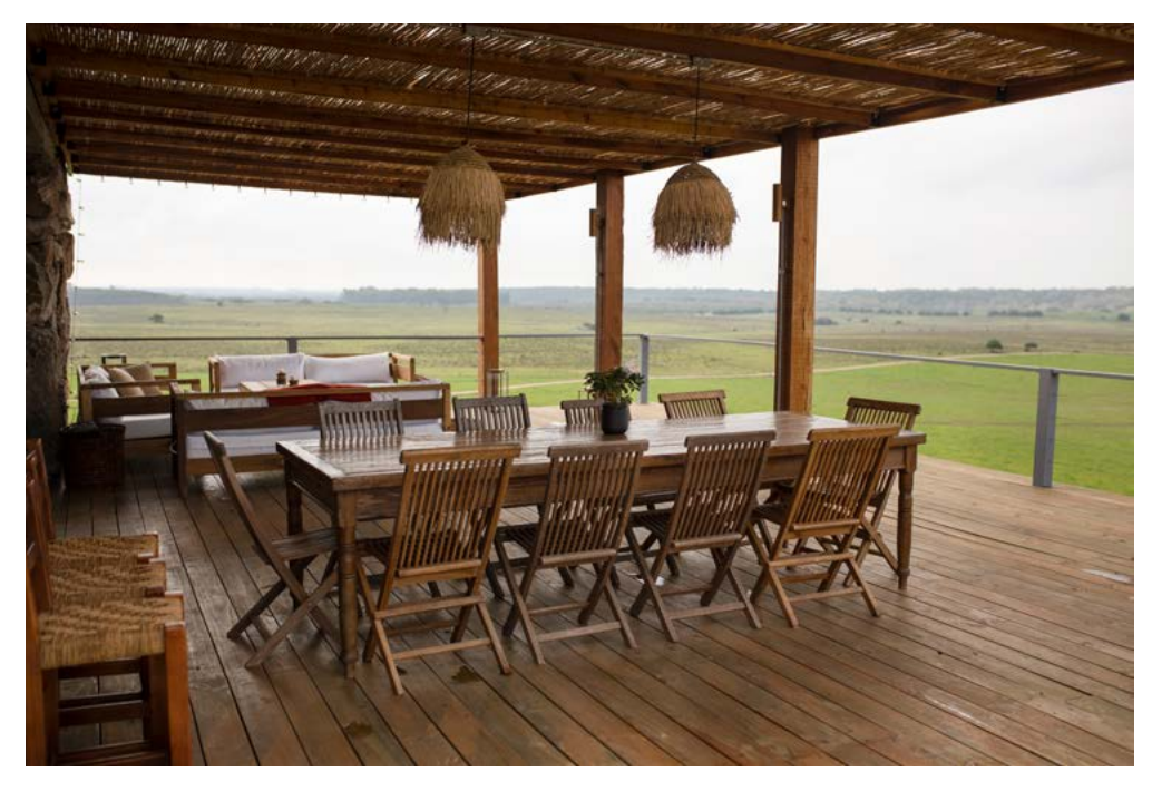
The lodges's comfort in its exterior spaces is ideal for those seeking to enjoy the days outdoors while savoring the amazing views.