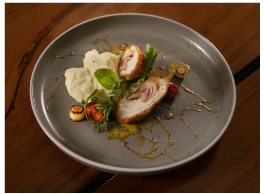
Cordon Bleu partridge with whipped mashed potatoes and curry sauce.