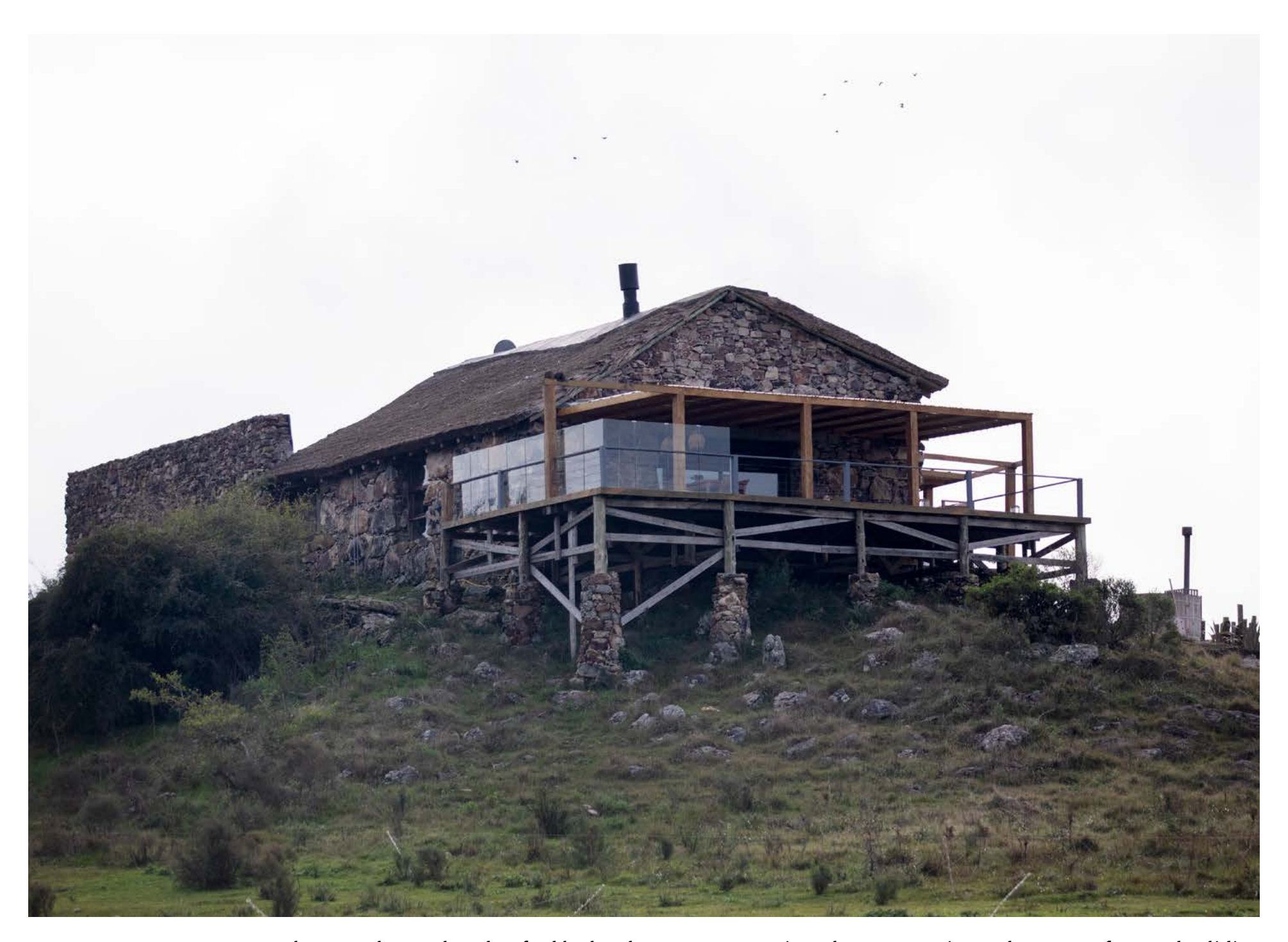
The stone house, handcrafted by local stonemasons, gives the construction a character of eternal solidity.