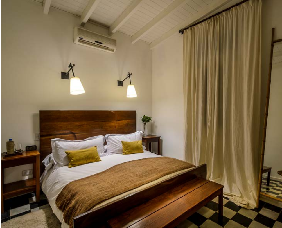
Pica Zuro offers well-appointed elegant rooms, with private bath.