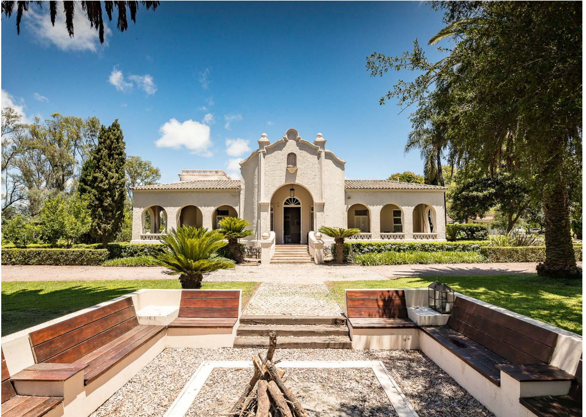
Pica Zuro Lodge offers the ultimate venue for the traveling wing-shooter.