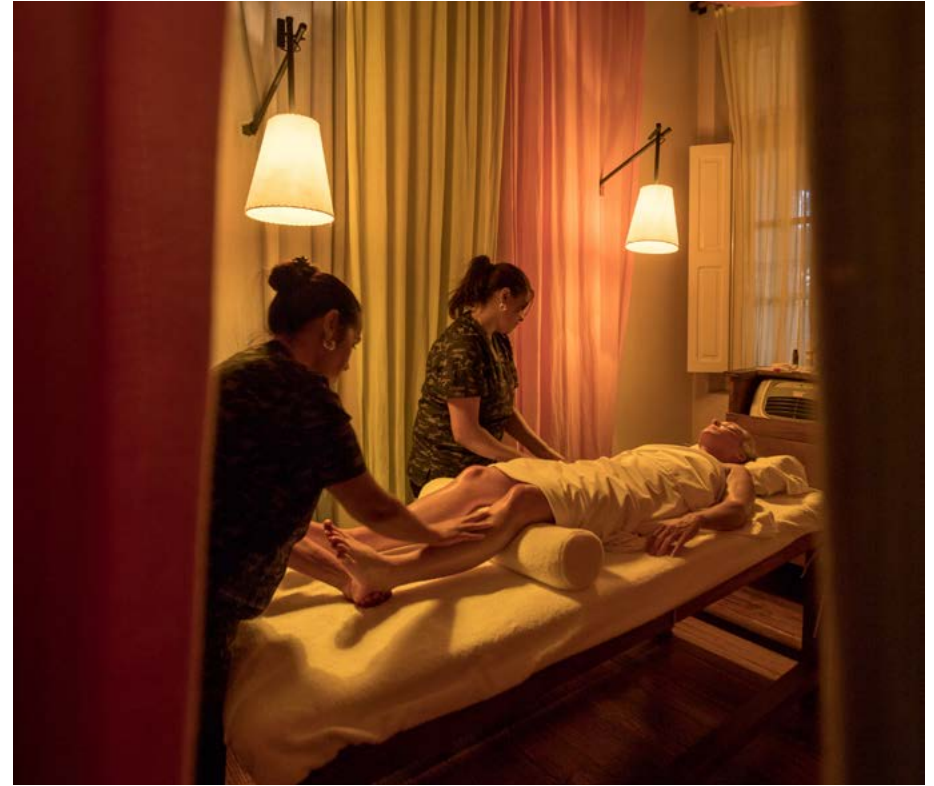
Recover after a long day of shooting with a relaxing massage.