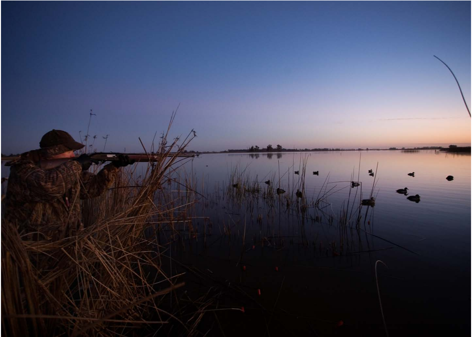
Hunting over decoys starts at first light, and continues until 10 a.m or fulfilment of your limits.