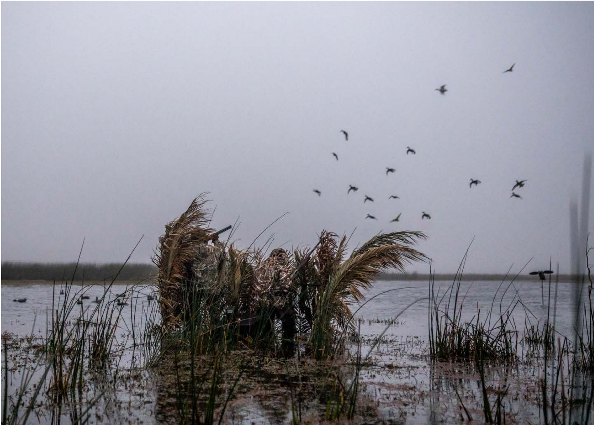
Blinds are well placed and scouted, providing the best possible opportunities at a number of duck species.