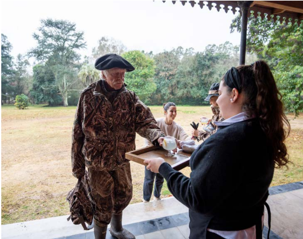
A hot towel and welcome drink awaits you after every session to help you relax and get you ready for lunch.