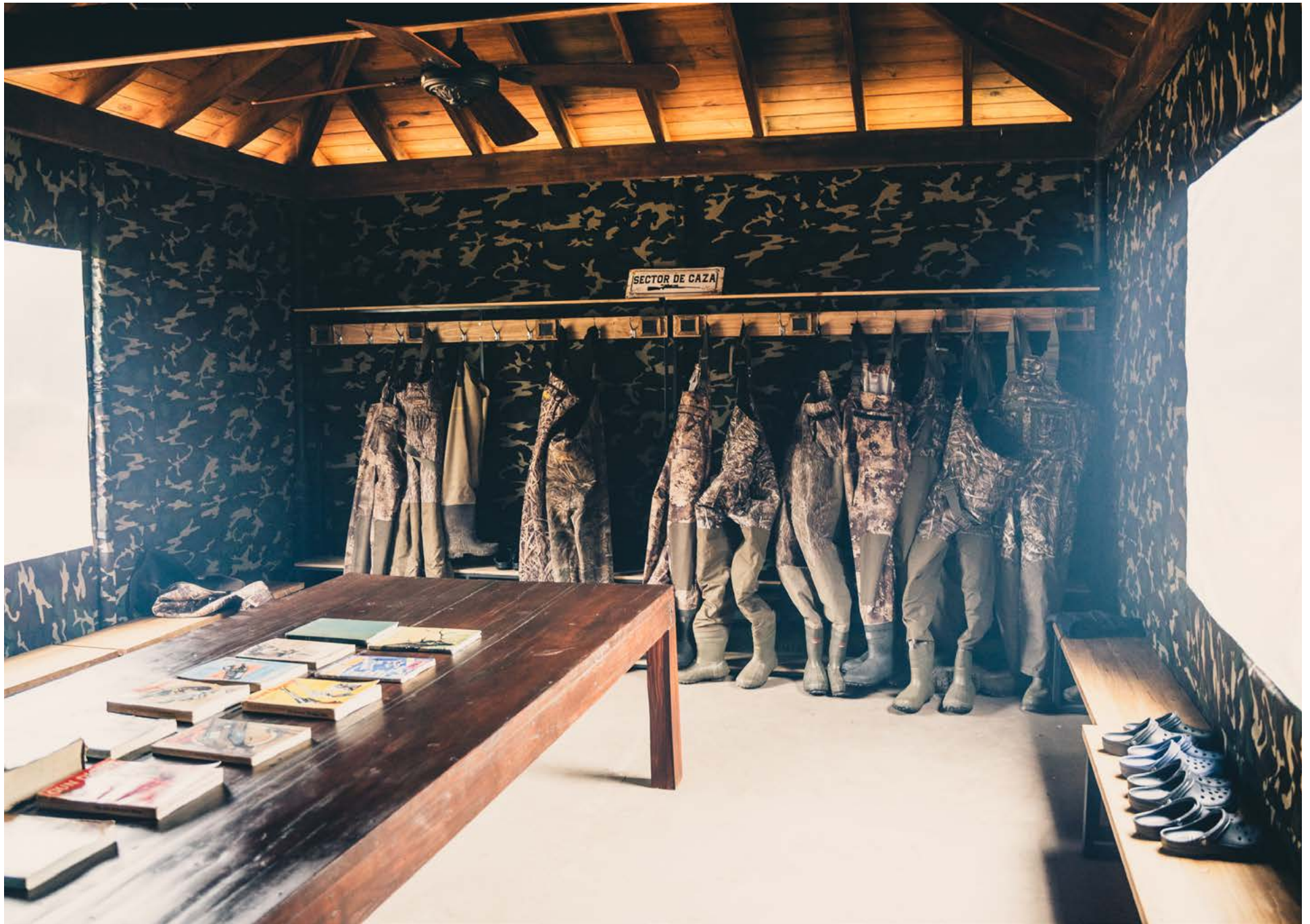
After each hunt, make a quick stop at the wader/storage room for the storing of hunting equipment.