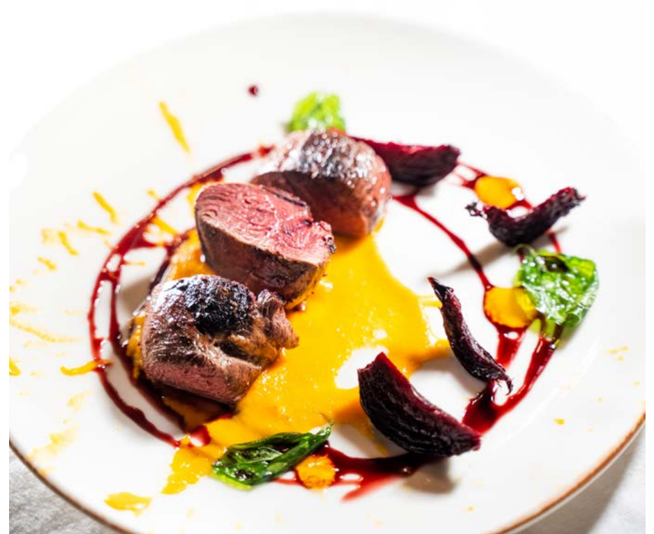
Grilled duck with carrots puree and baked beetroots.