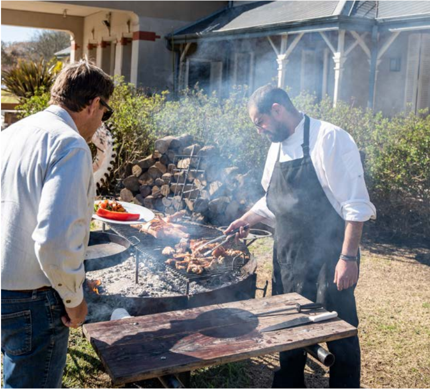
Open live fire cuisine at the lodge, where we smoke & cook our meats and vegetables.