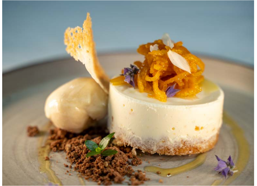
Local green tangerine cheesecake with caramel ice-cream.