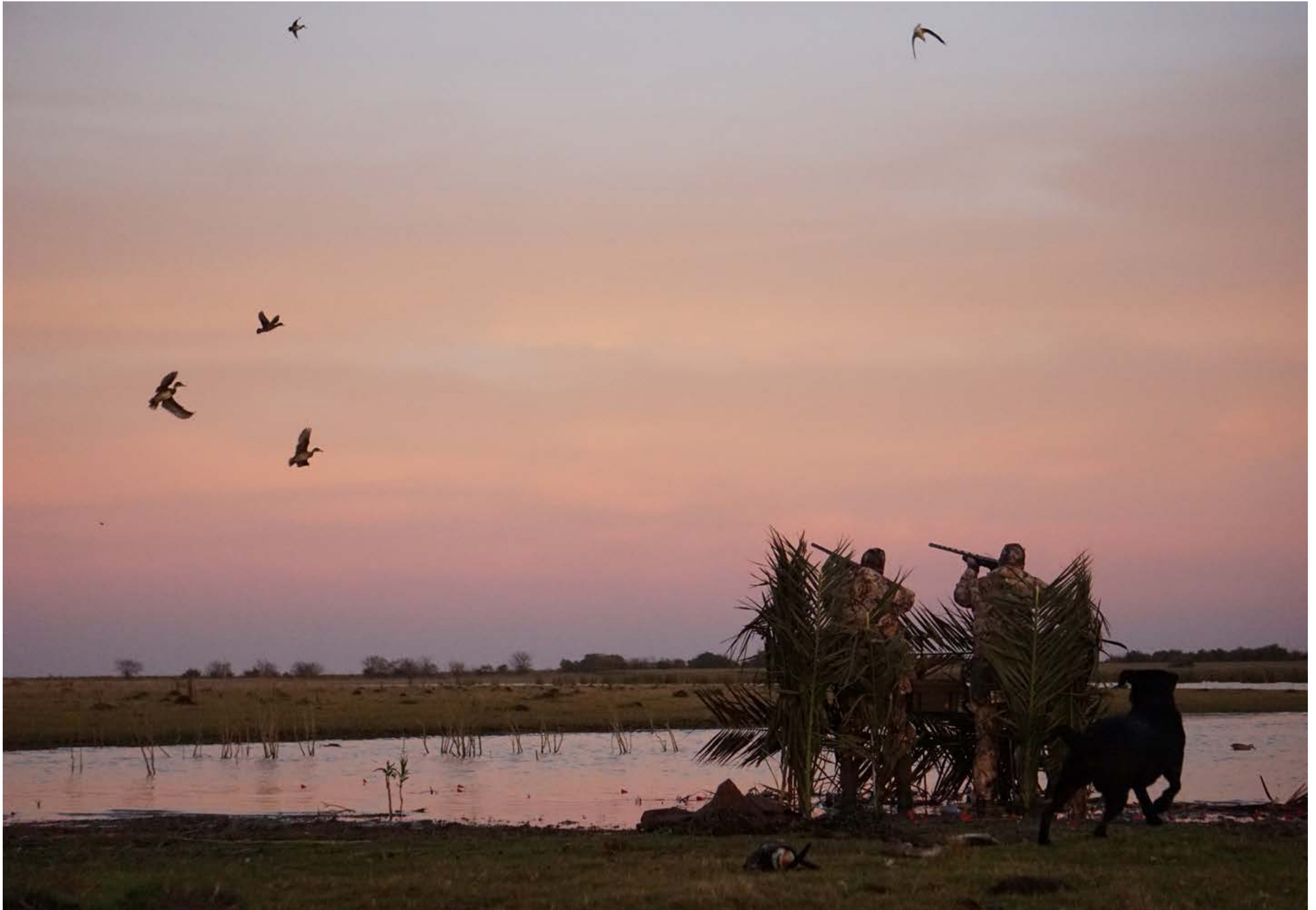
Most mornings are spent hunting ducks from comfortable blinds with our professional guides and their retrievers at the ready...