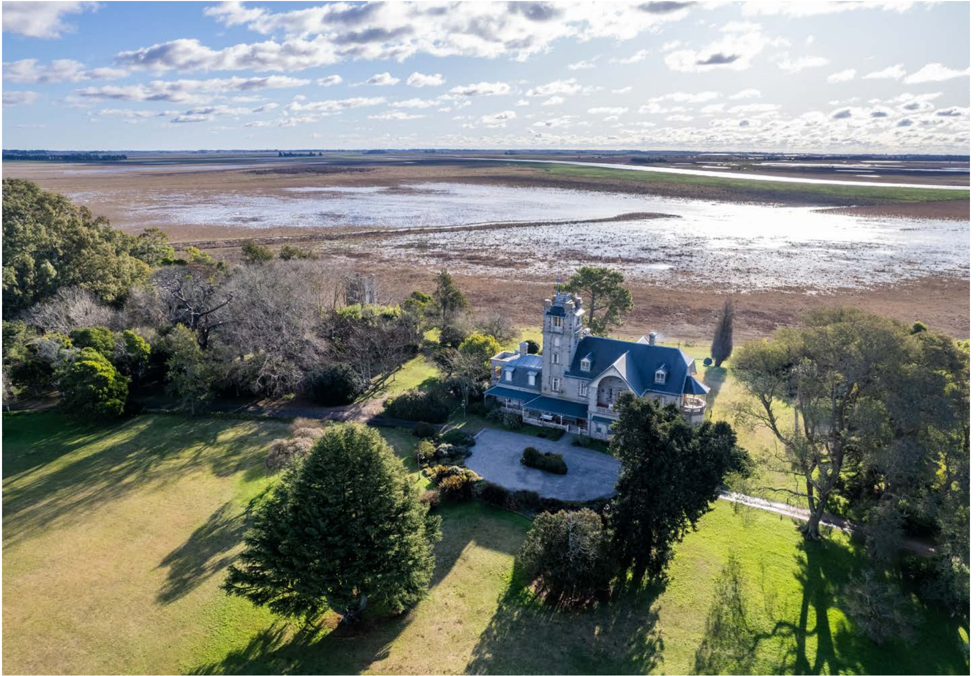
Los Crestones Lodge lies on a sophisticated and luxurious compound situated on 60 hectares of preserved natural argentinian woodlands