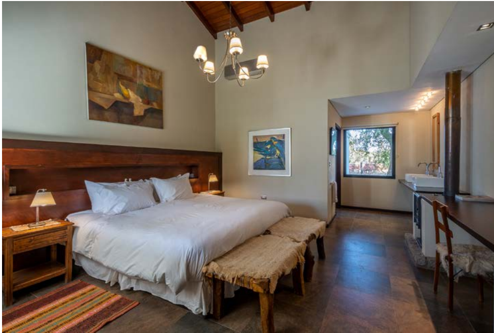
The lodge offers eight single rooms with King beds, and one double bedroom— each with a private bathroom.