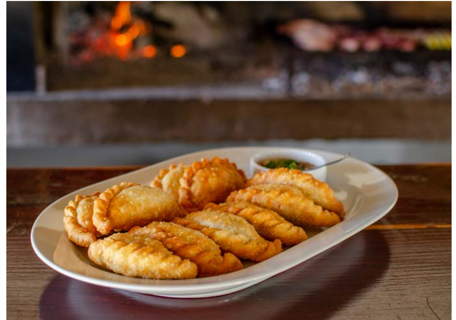
Our traditional argentinean empanadas suffed with pigeon.