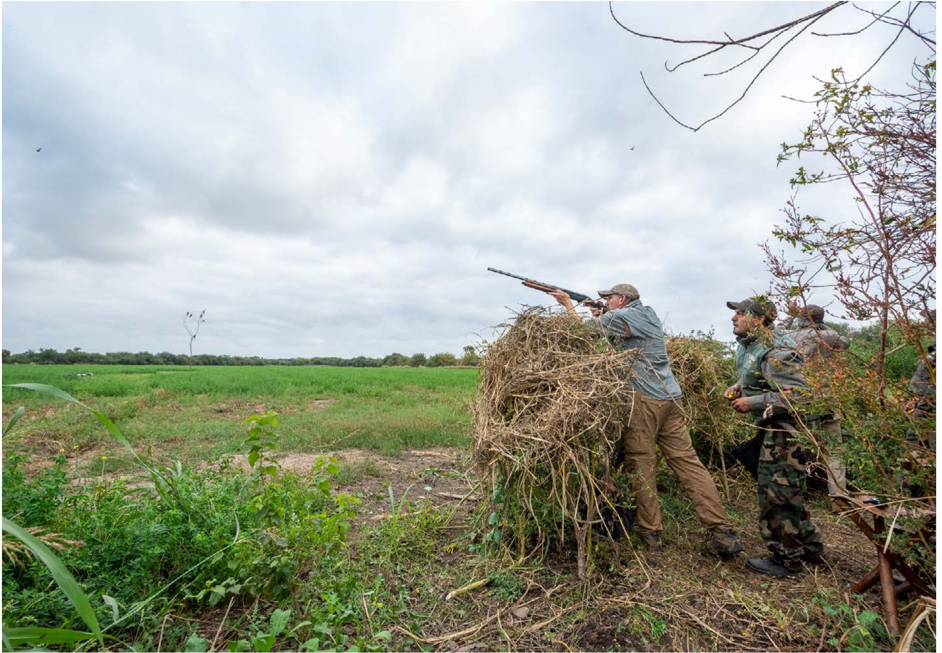
At La Torcaza, pigeon hunting takes place in traditional hunting style, from natural blinds over decoys, which are strategically placed based upon skilled scouting and planning, to ensure success.