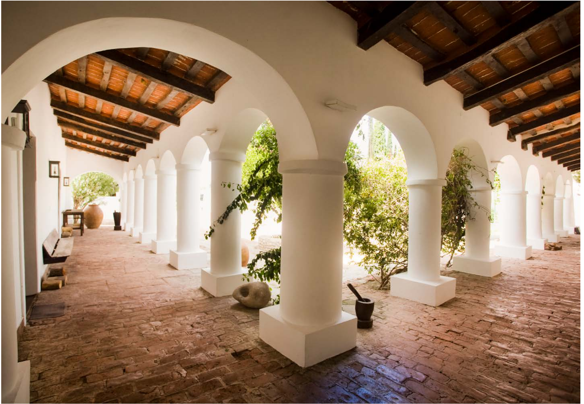
Founded as a Jesuit mission in 1669, La Torcaza brings together historical elegance with well appointed modern comfort. This spectacular ranch offers beauty and relaxation at every turn.