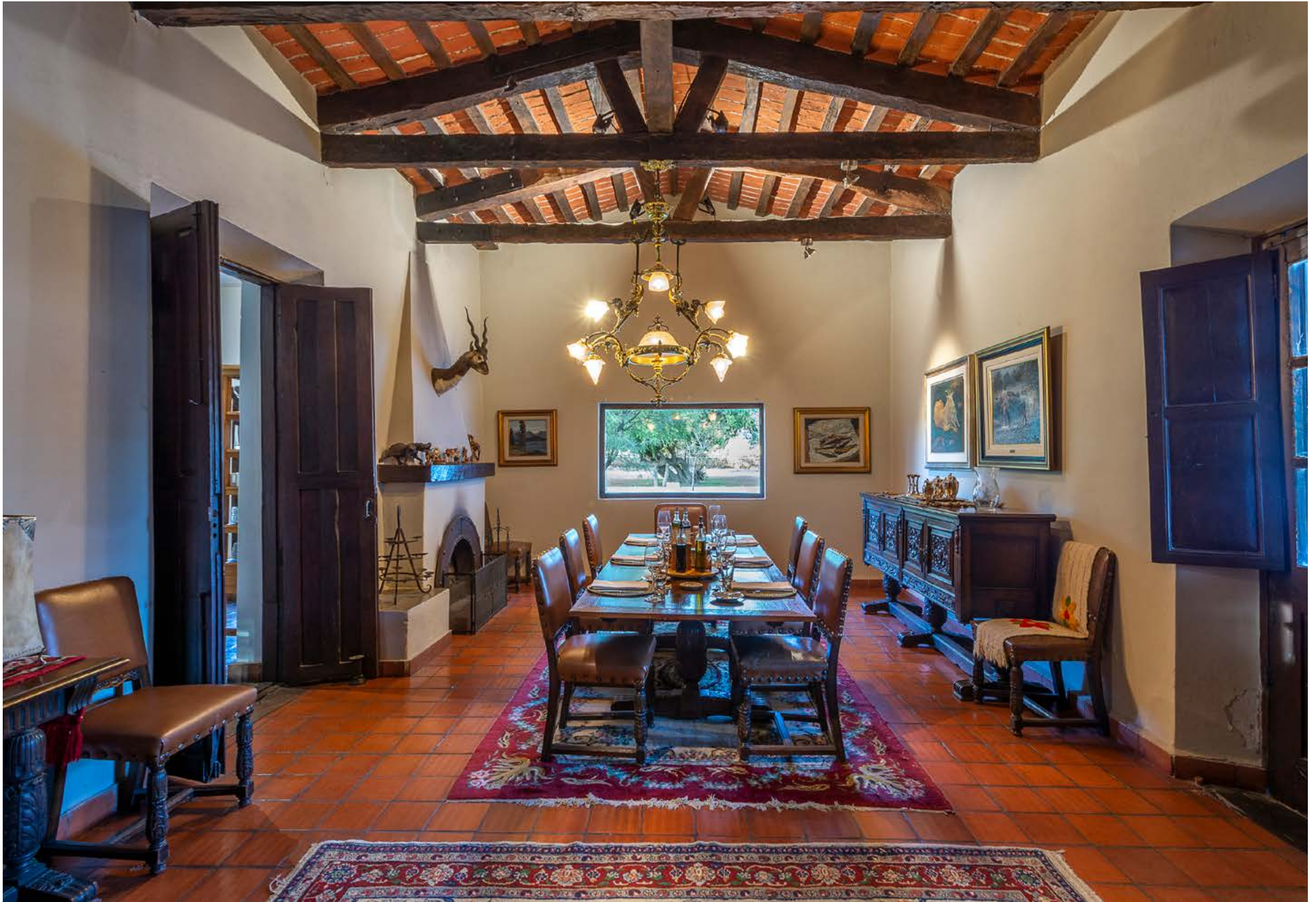
Upon arrival at La Torcaza Lodge, you will be immediately transported back in time. In this antique Jesuit Estancia, the atmosphere of history and elegance abounds.