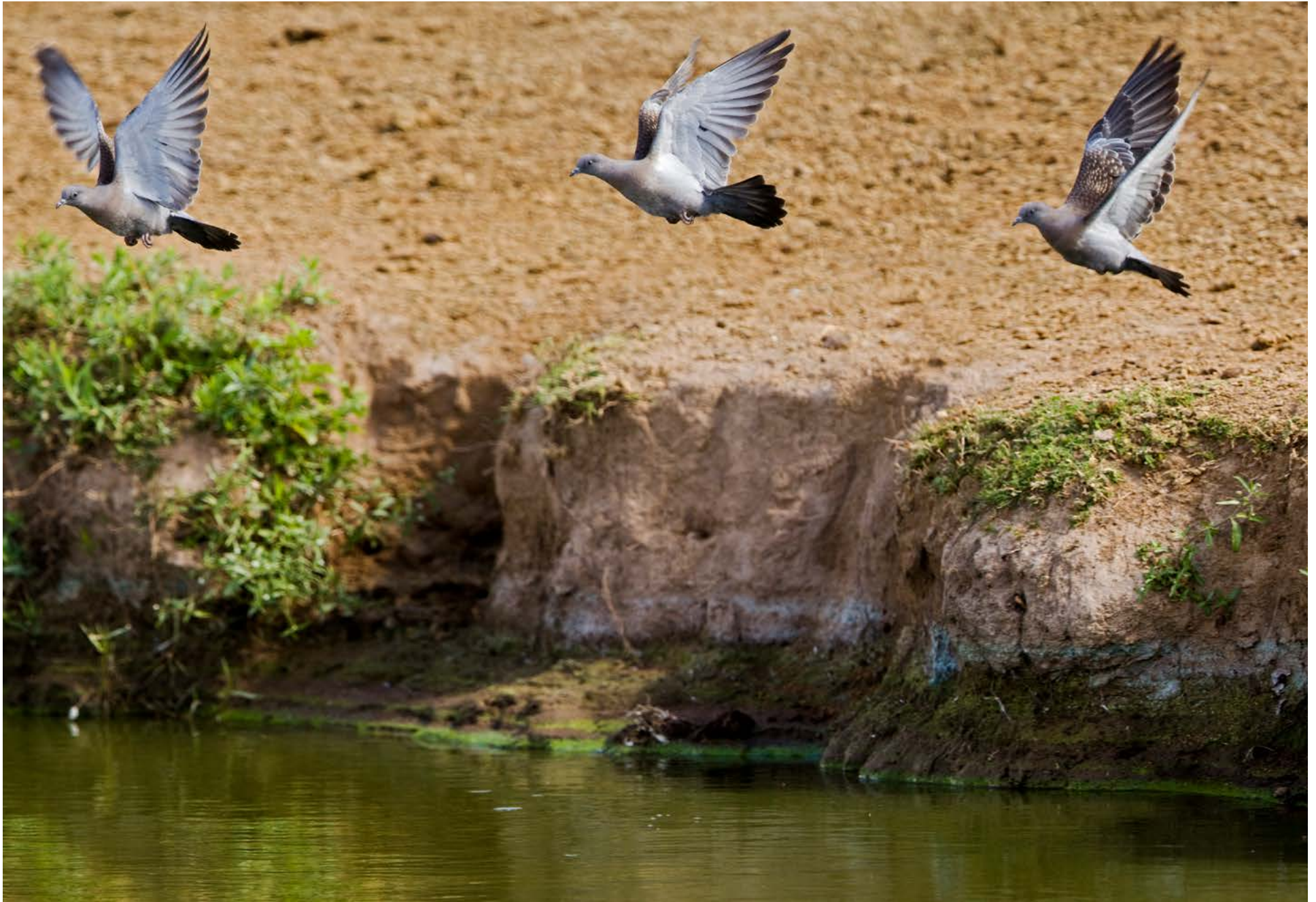
Pigeons not only fly fast and erratically, but they are also a smart and observant quarry, providing an all around sporting challenge over the decoy spread.