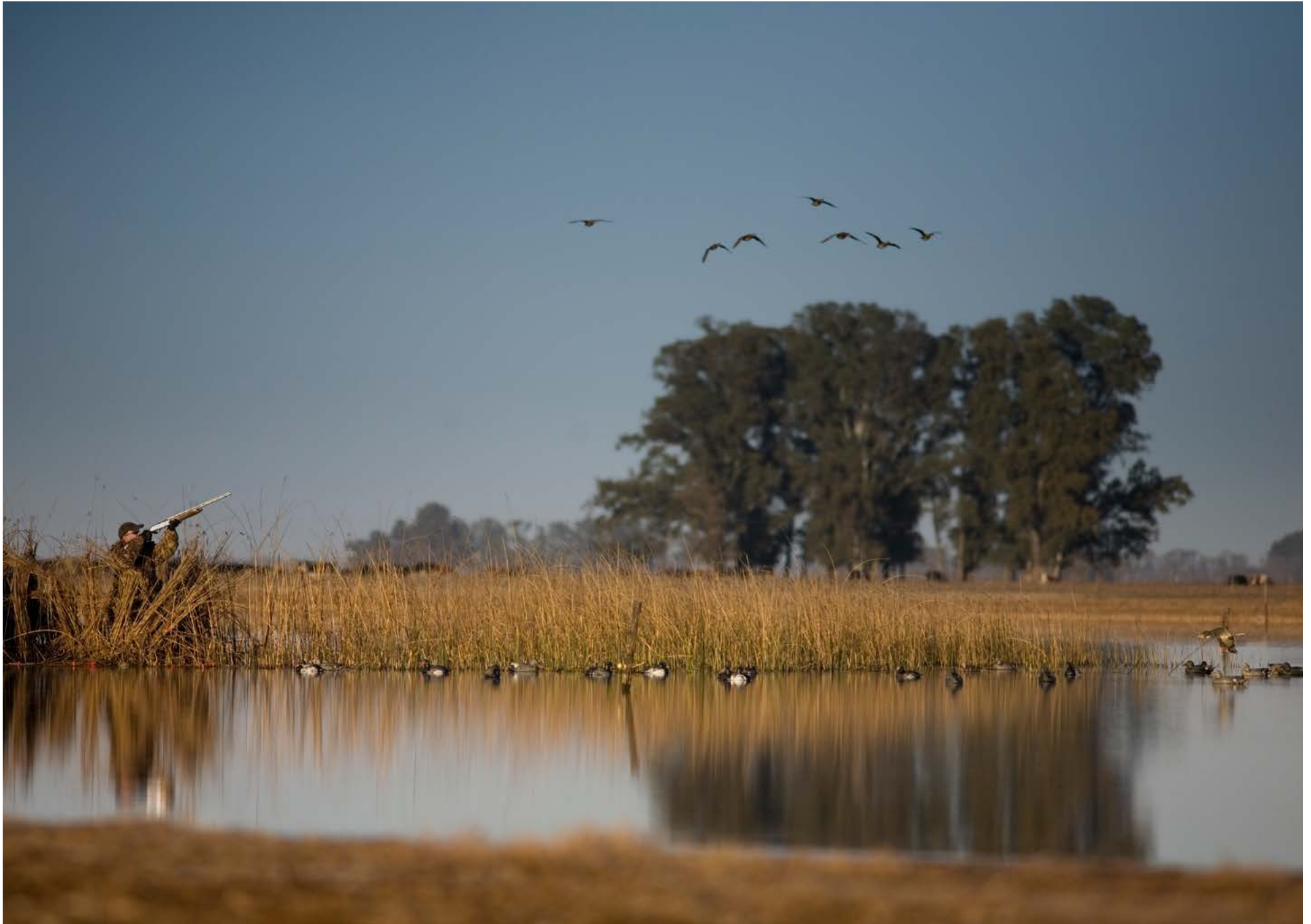
One of the many blind set ups, you'll typically find on our nearby lagoons.