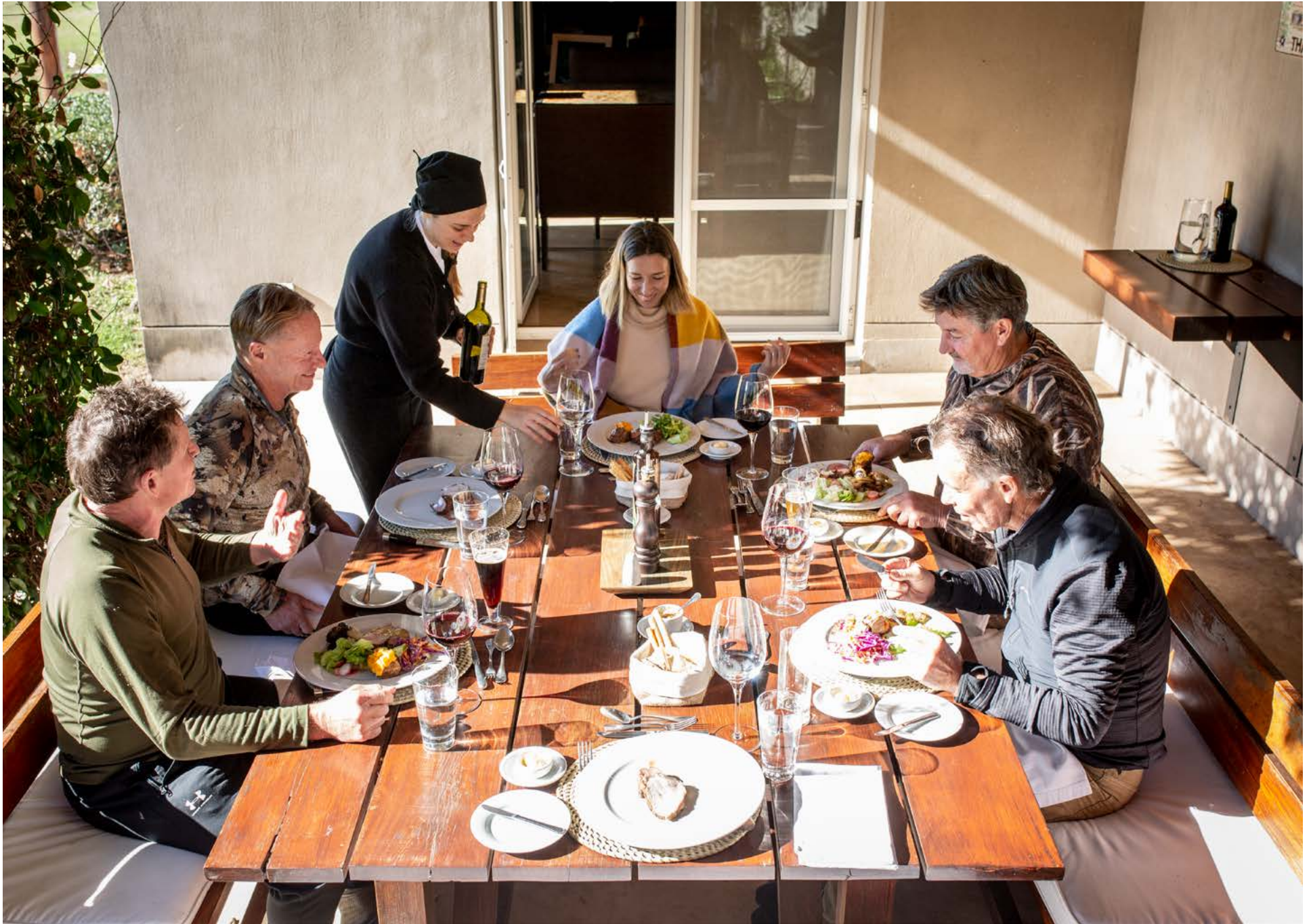
Luxurious living, à la carte menu, and impeccable service. Like all of our David Denies lodges, no detail is left to chance.