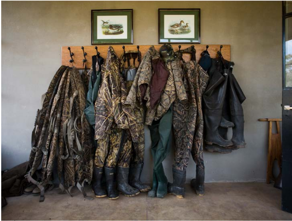
Waders are provided at the lodge at no extra charge.