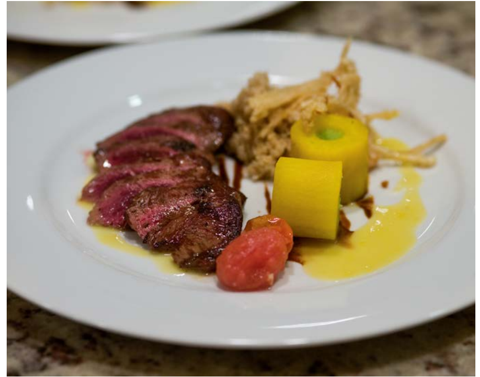
Medium rarete Grilled duck, with a zafron cassava, cherry tomatoes and quinoa salad.