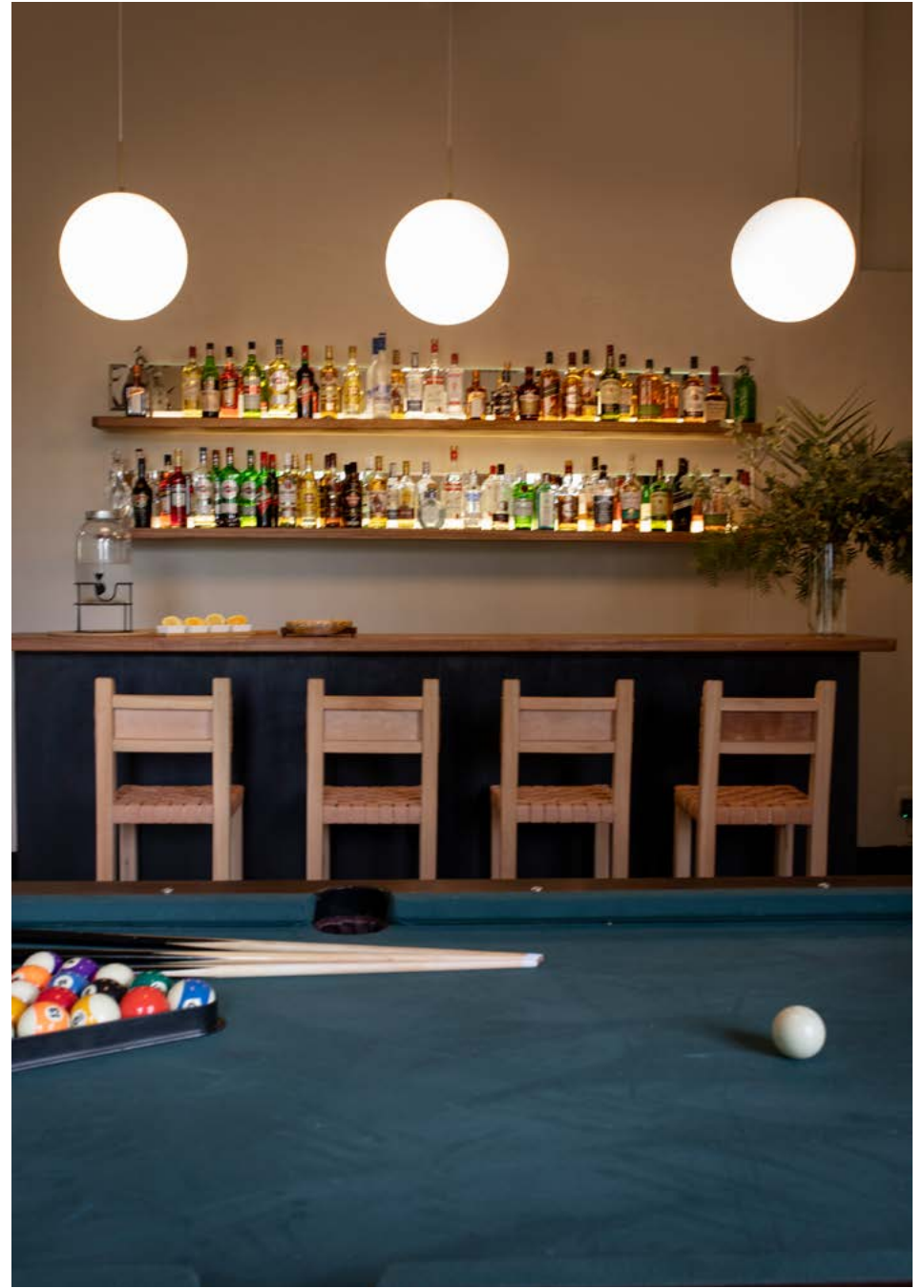
The lodge's facilities are second to none, boasting a brand new game room complete with a billiards table and adjacent bar.