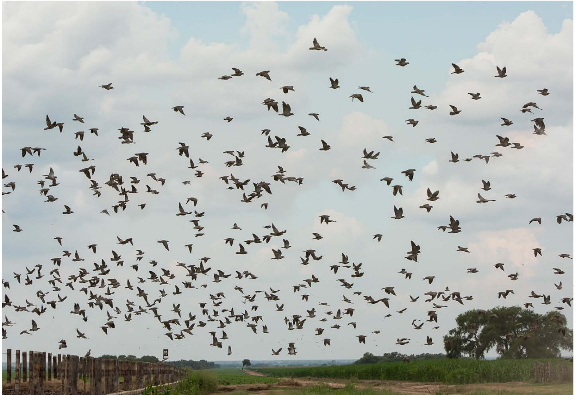
Shoot doves in the rolling slopes and vineyards of this rich wine producing area, with flights of birds that rival any population of doves you'll see anywhere in South America.