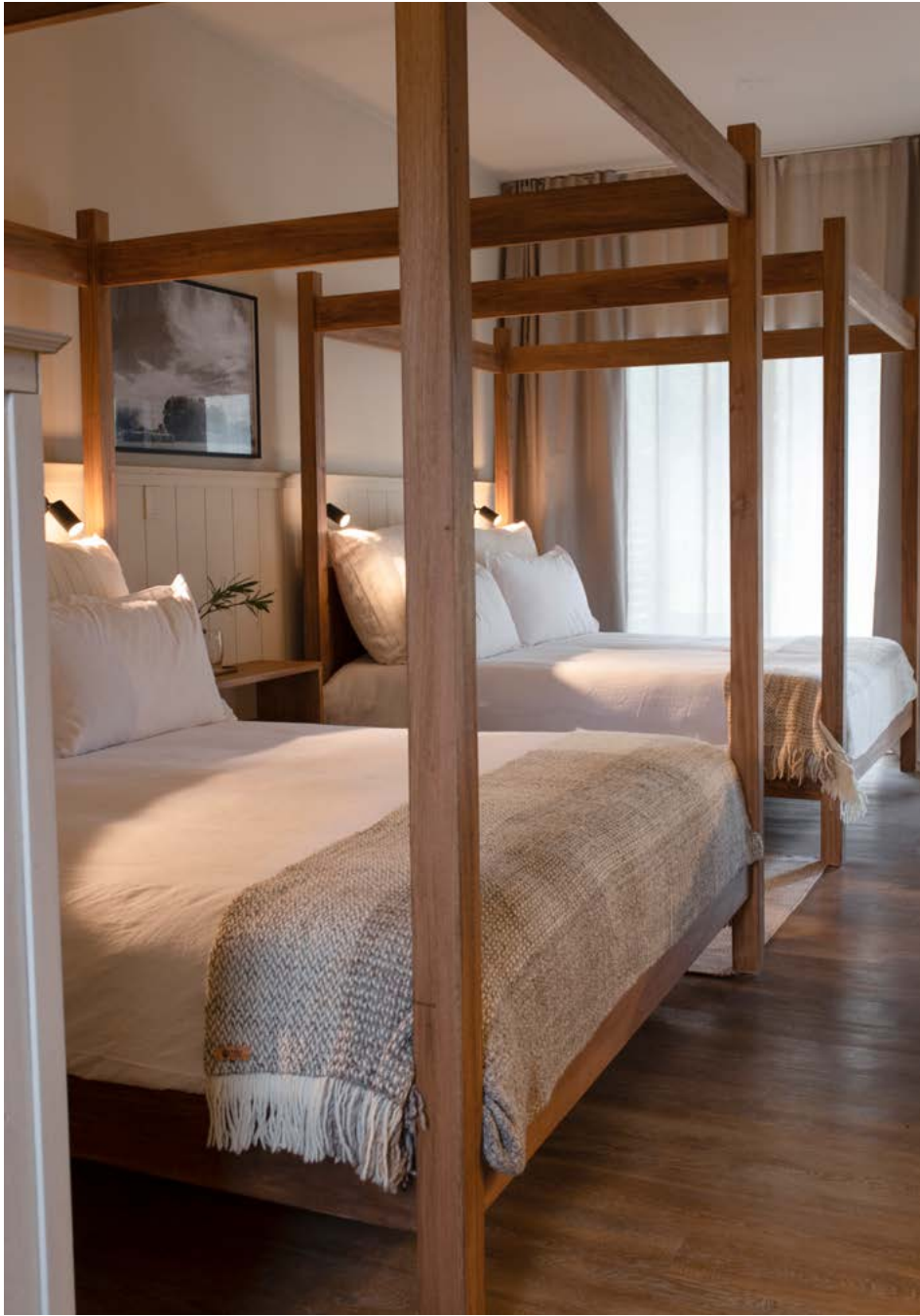
Carmelo has 10 beautifully appointed and fully-equipped en suite rooms, with Queen and King-size beds.