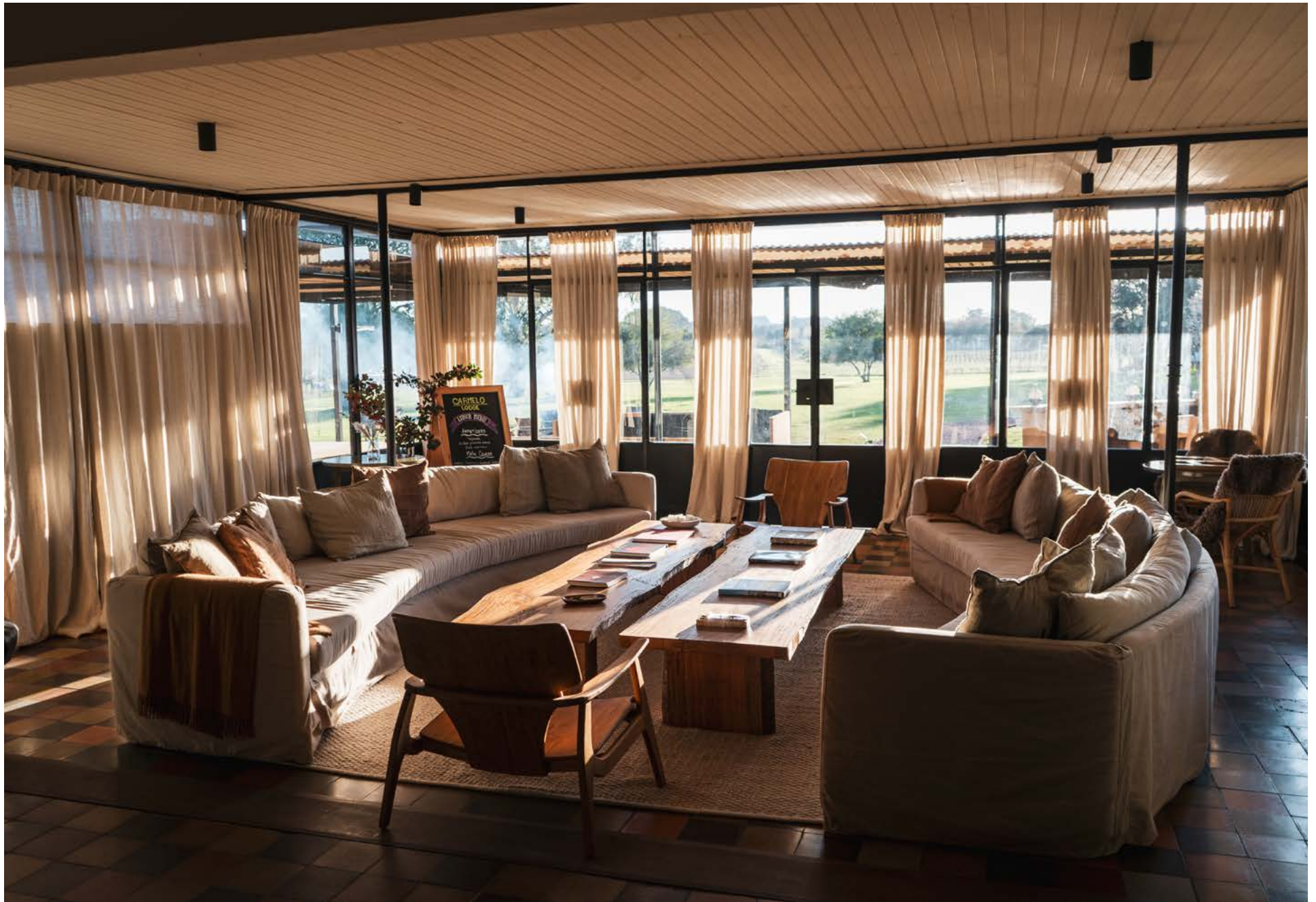
Carmelo Lodge features fine accommodations combined with a refined and inviting vineyard, right in the heart of Uruguay's high volume dove hunting.