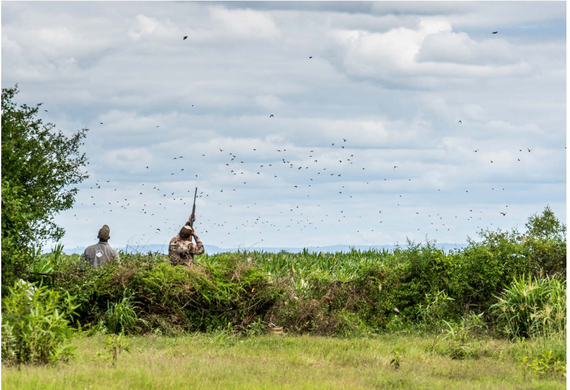
Dove shooting in Carmelo is just as thrilling as any other location in South America, as one can witness hundreds of doves soaring in magnificent waves that surpass imagination.