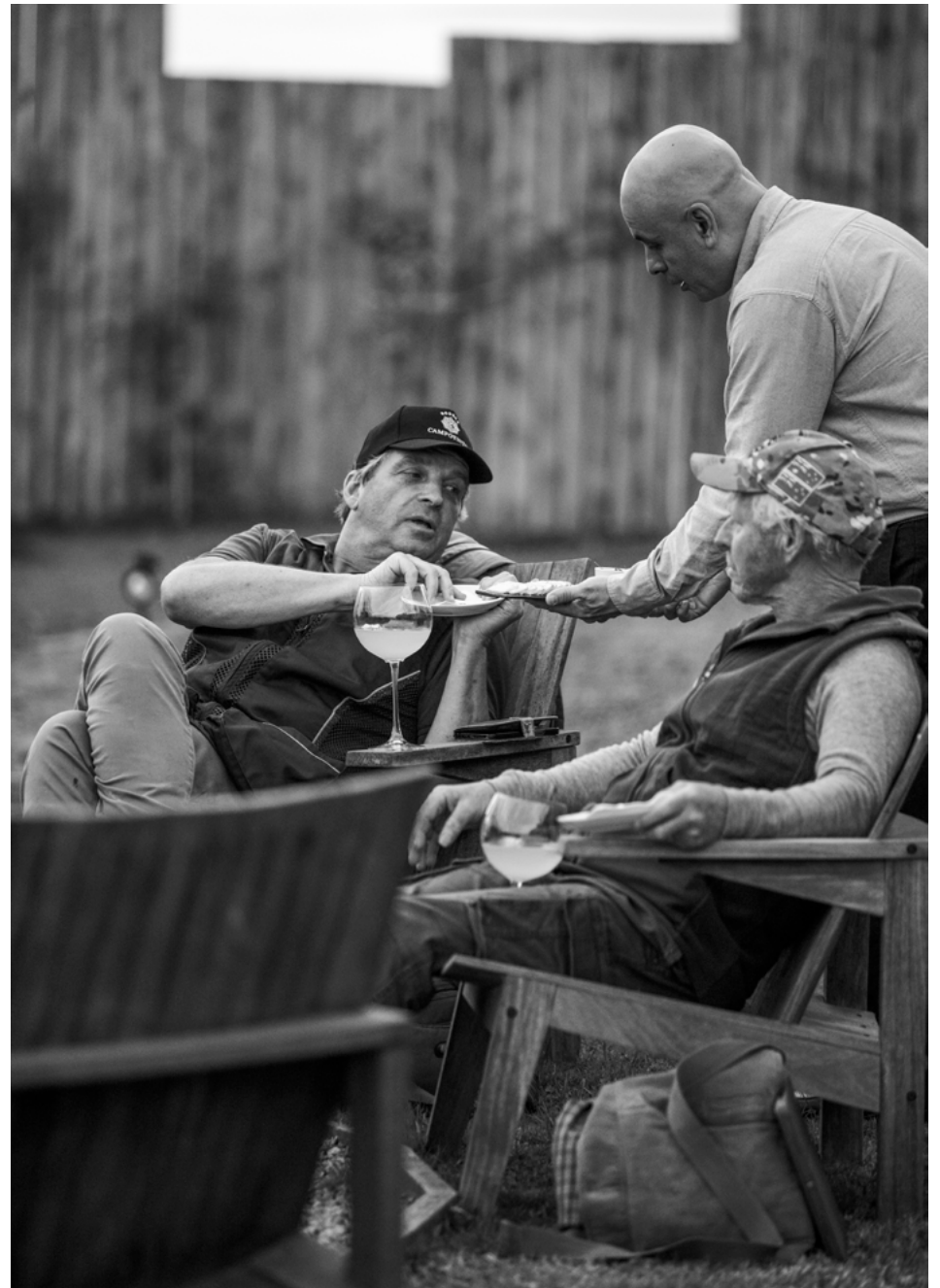
The inviting fire pit in the main courtyard often becomes the center of the lodge life once the hunting day is complete, offering a relaxing respite from the fast paced days in the dove fields.