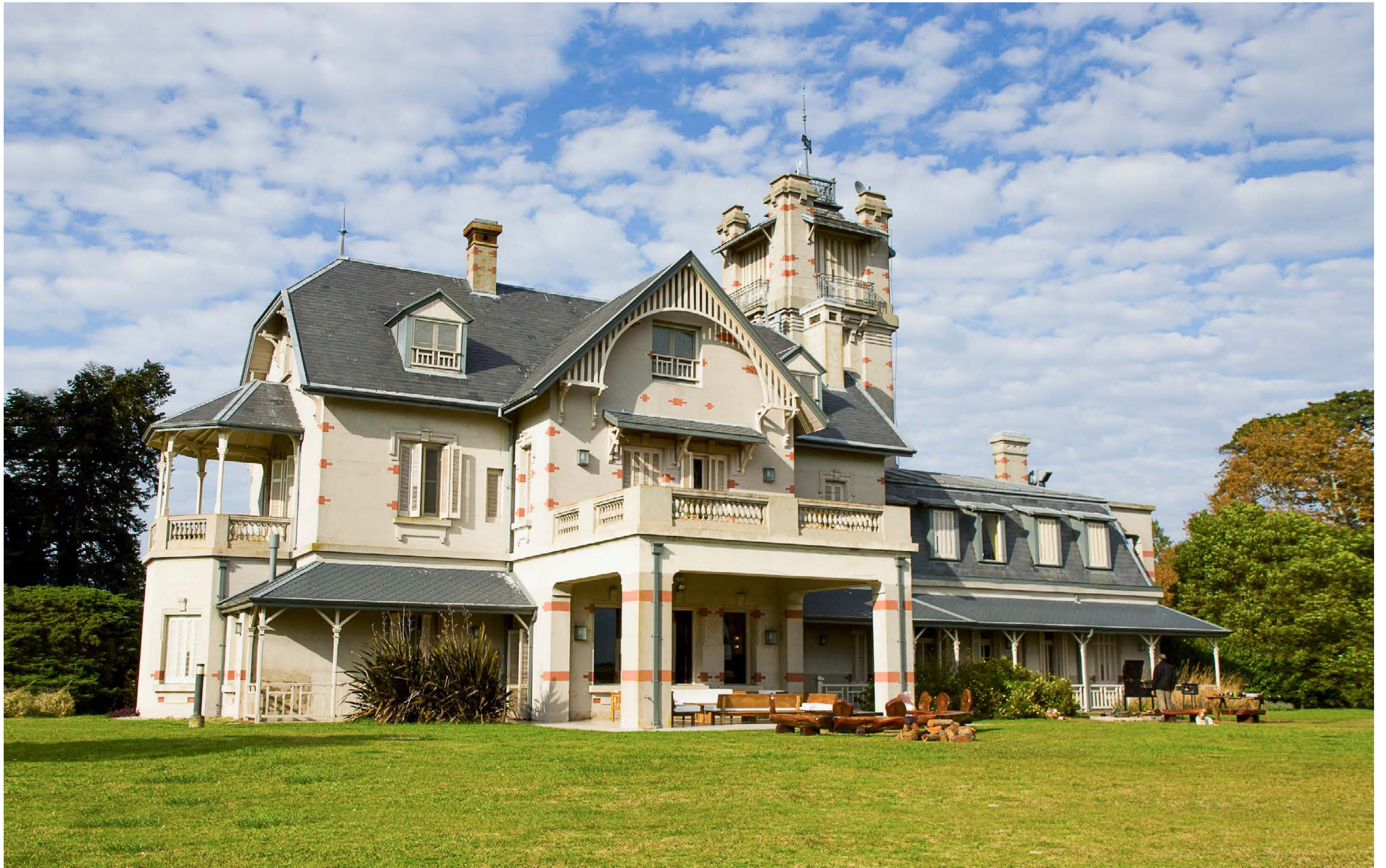
Los Crestones Lodge lies on a sophisticated and luxurious compound situated on 60 hectares of preserved natural argentinian woodlands