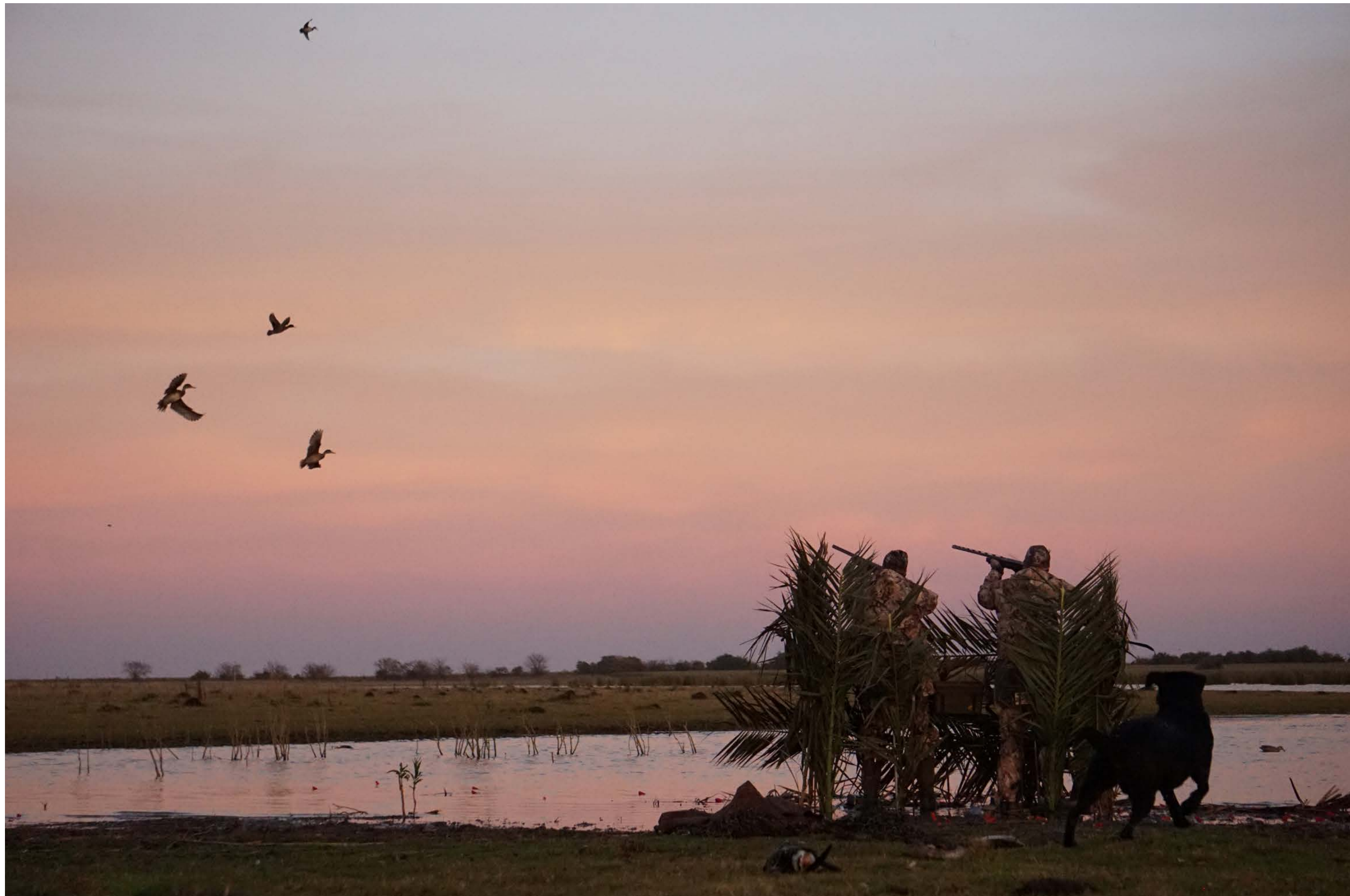
Most mornings are spent hunting ducks from comfortable blinds with our professional guides and their retrievers at the ready...