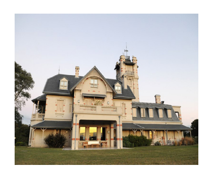
Los Crestones Lodge Duck, Perdiz & Doves hunting Buenos Aires, Argentina