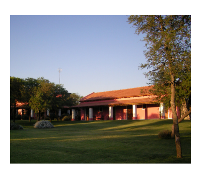
Cordoba Lodge Dove shooting Córdoba, Argentina