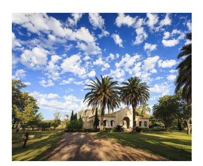
Pica Zuro Lodge Dove shooting Córdoba, Argentina