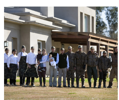
Jacana Lodge Duck hunting Buenos Aires, Argentina