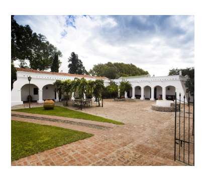
Montaraz Lodge Pigeon hunting Córdoba, Argentina