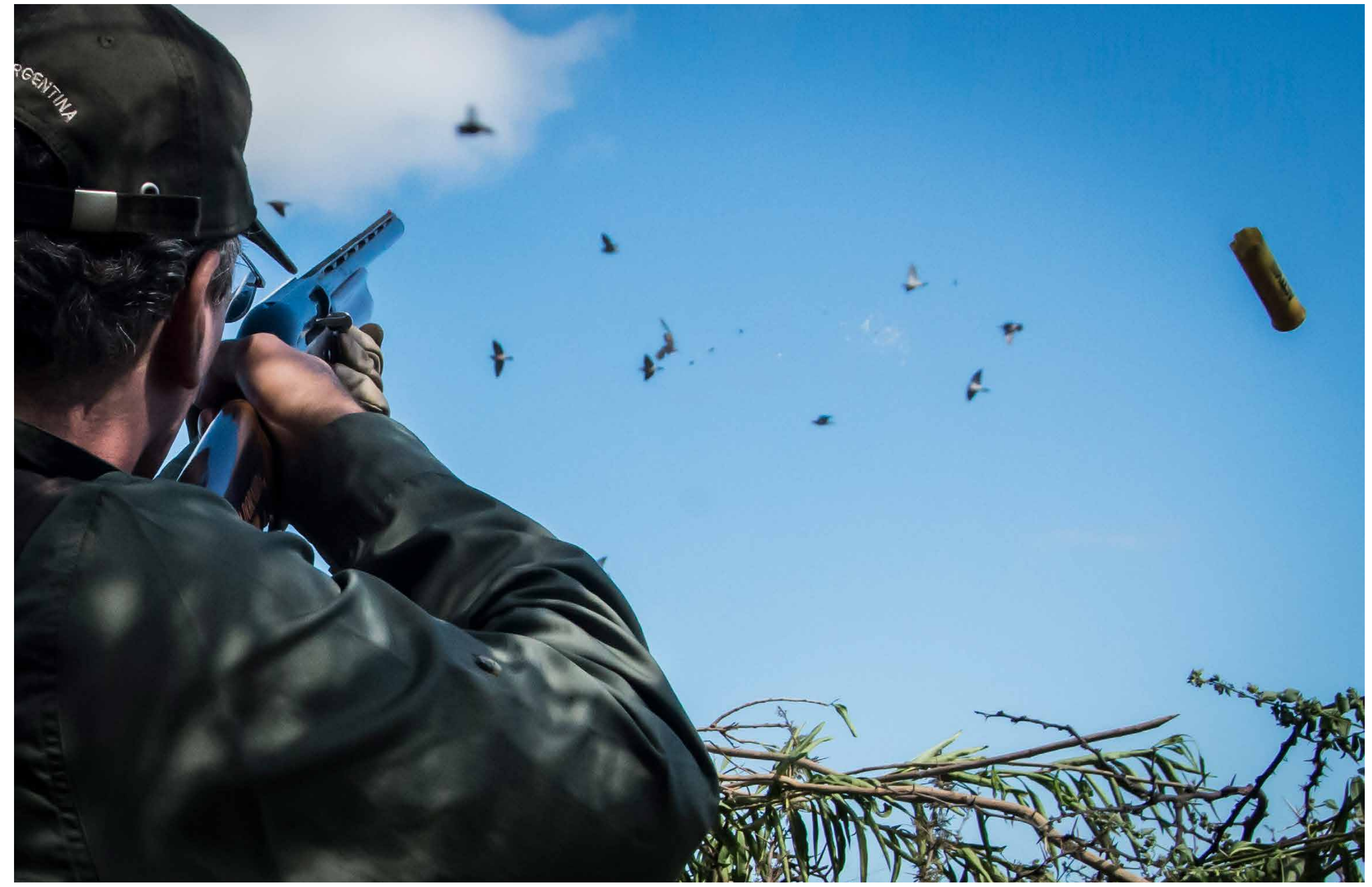
In the afternoon, dove shoots take place in some of the largest roosts in all of Uruguay, within short drives from our lodge.