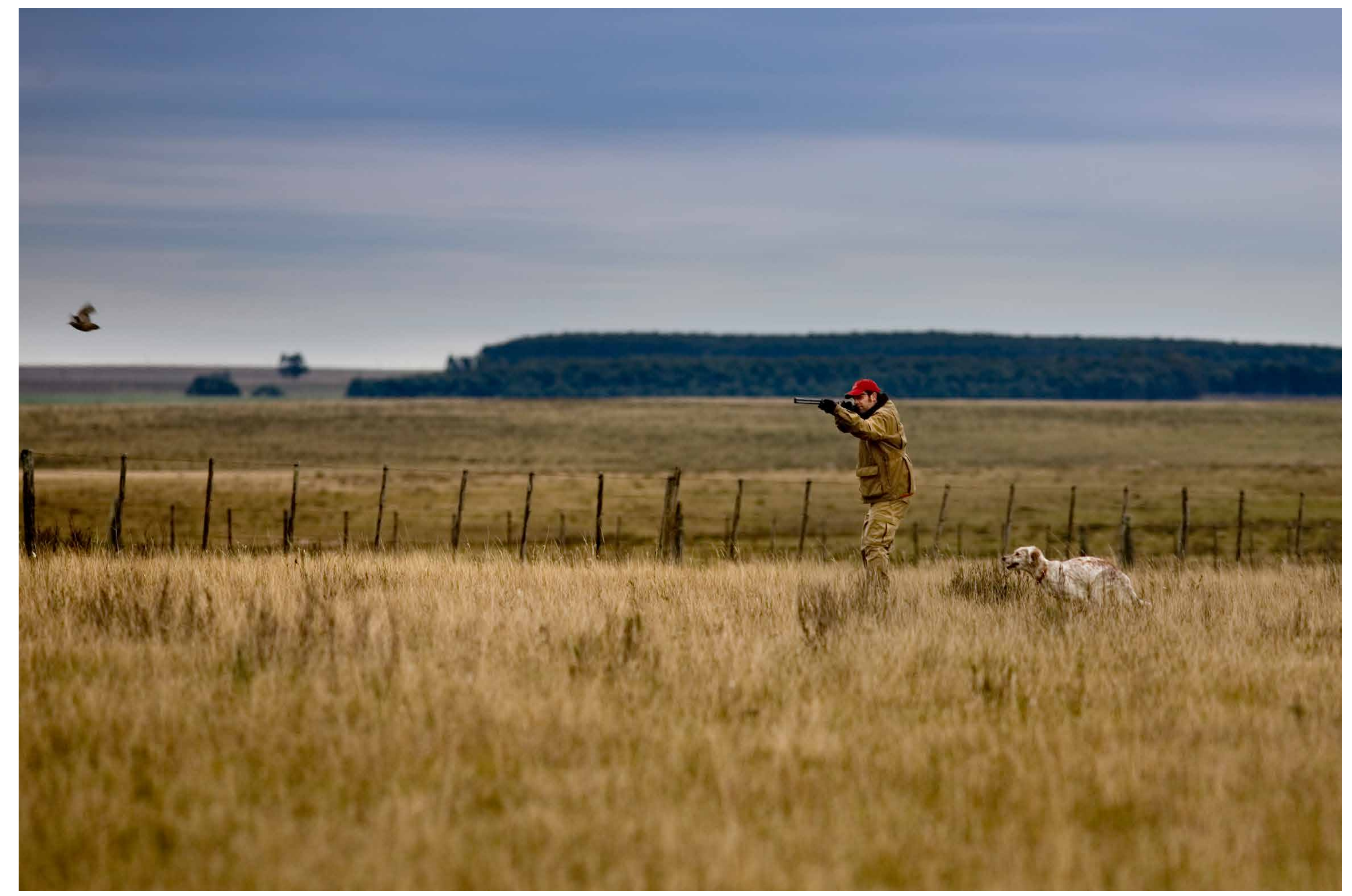
Most mornings at San Juan are spent pursuing hard flying perdiz, across short grass pastures over well trained English pointers and English setters...