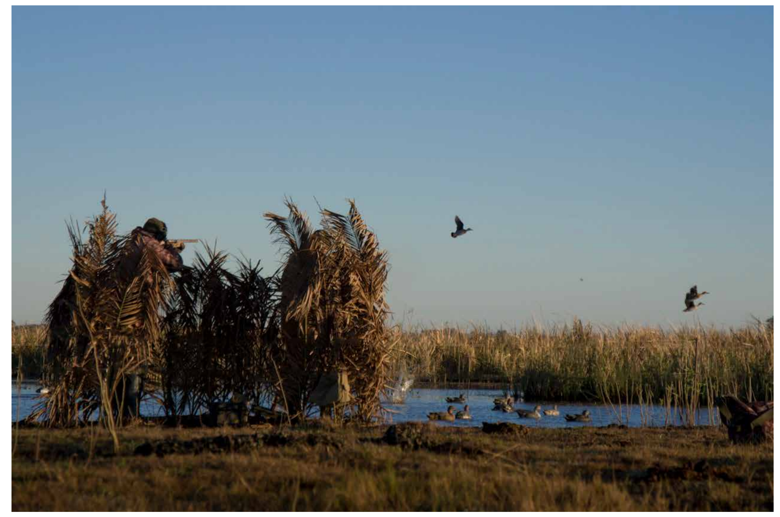
...or at one of our dozens of nearby ponds, where you will experience the best duck hunting in all of Uruguay.