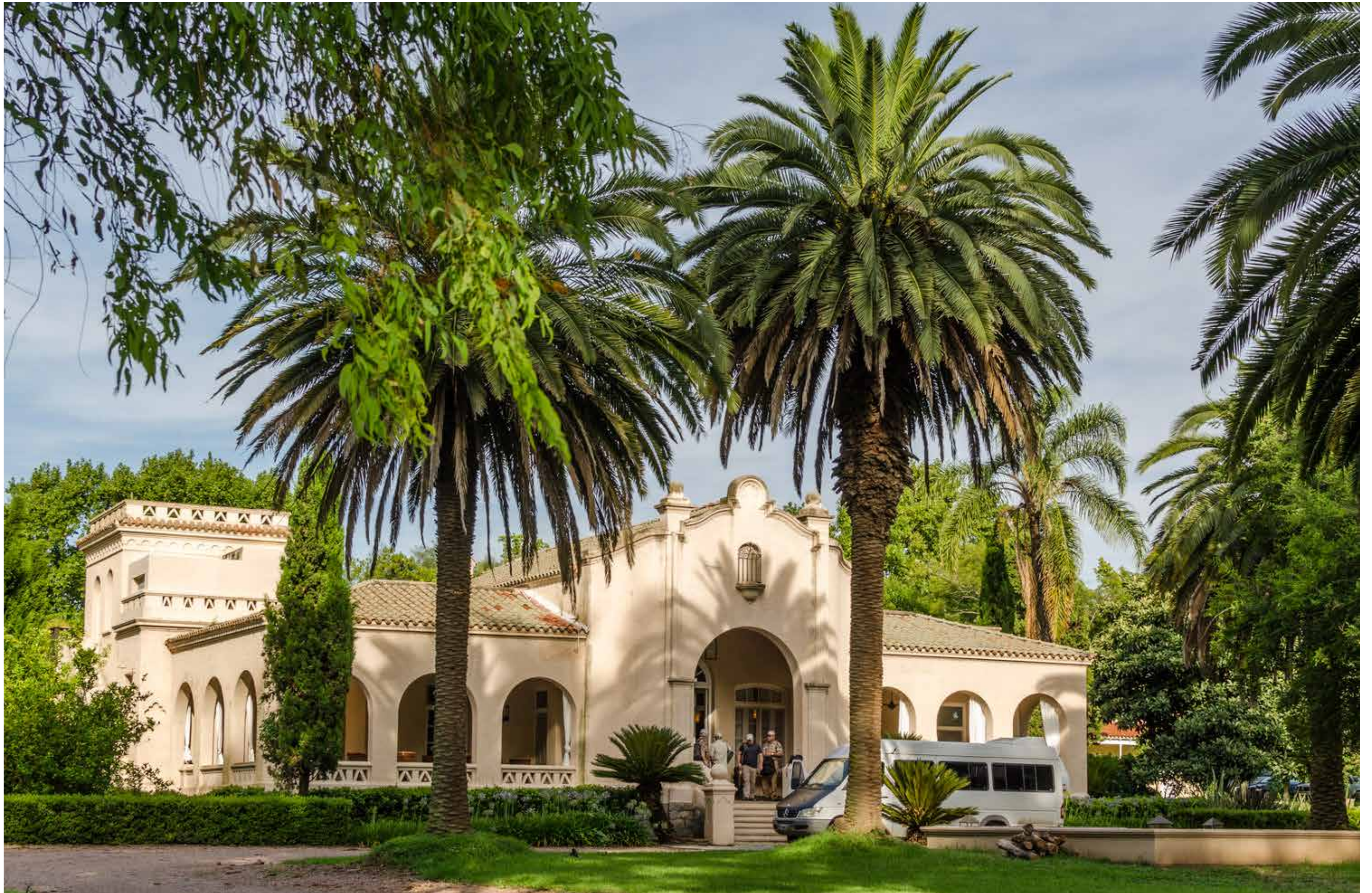
At Pica Zuro Lodge, live like royalty in the dove shooter's kingdom.