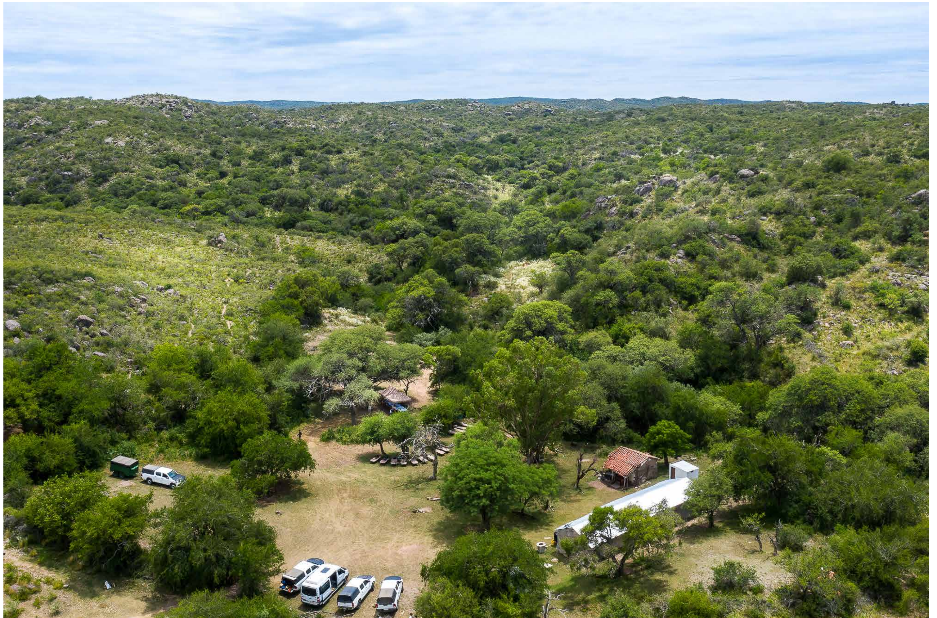
Safari-style, tented lunch in the field assures a full day of hunting with no time lost driving to and from the lodge.