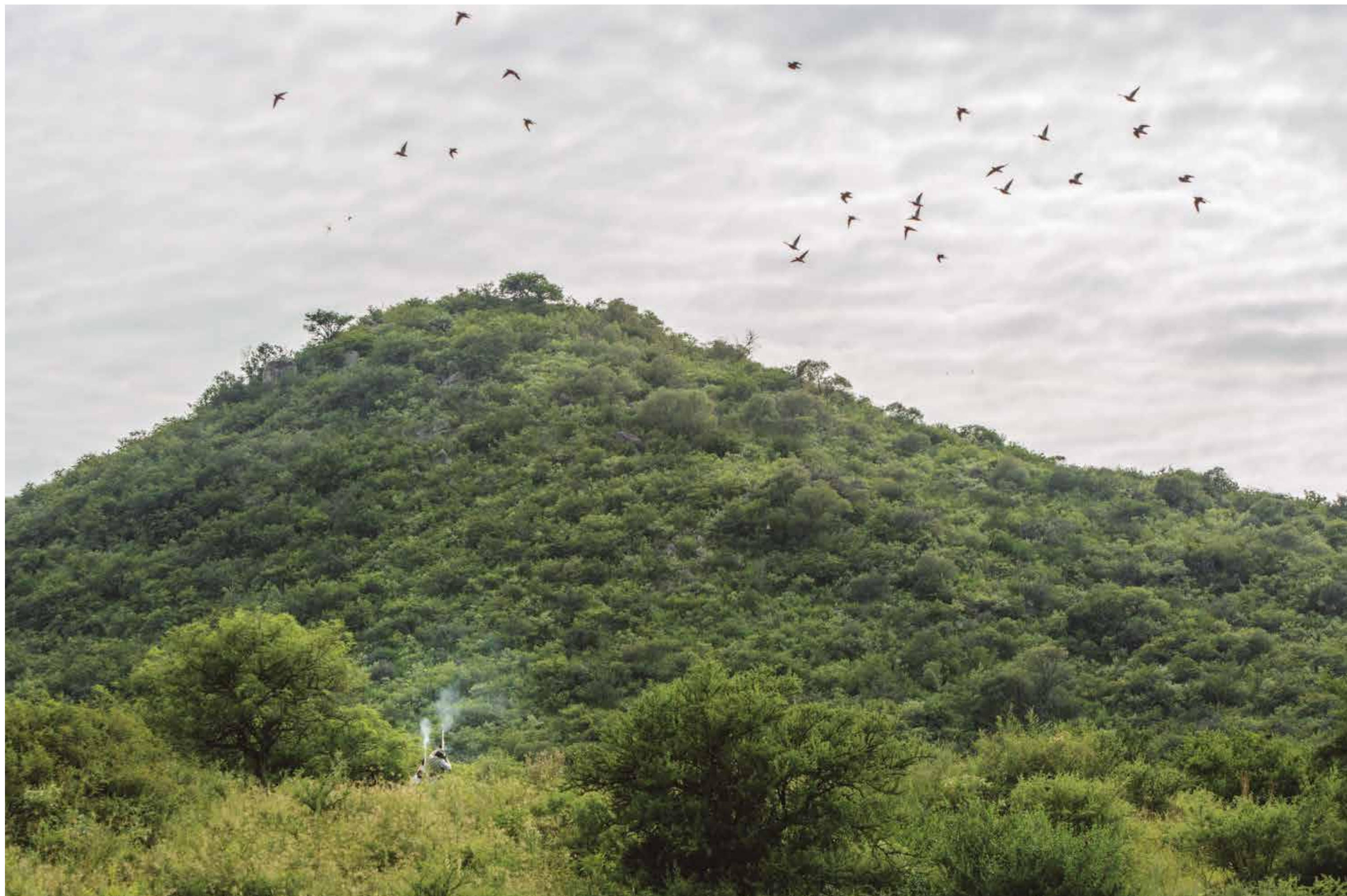
For more than 35 years, seasoned international bird hunters have recognized Córdoba as the world's leading destination for high-volume dove hunting.