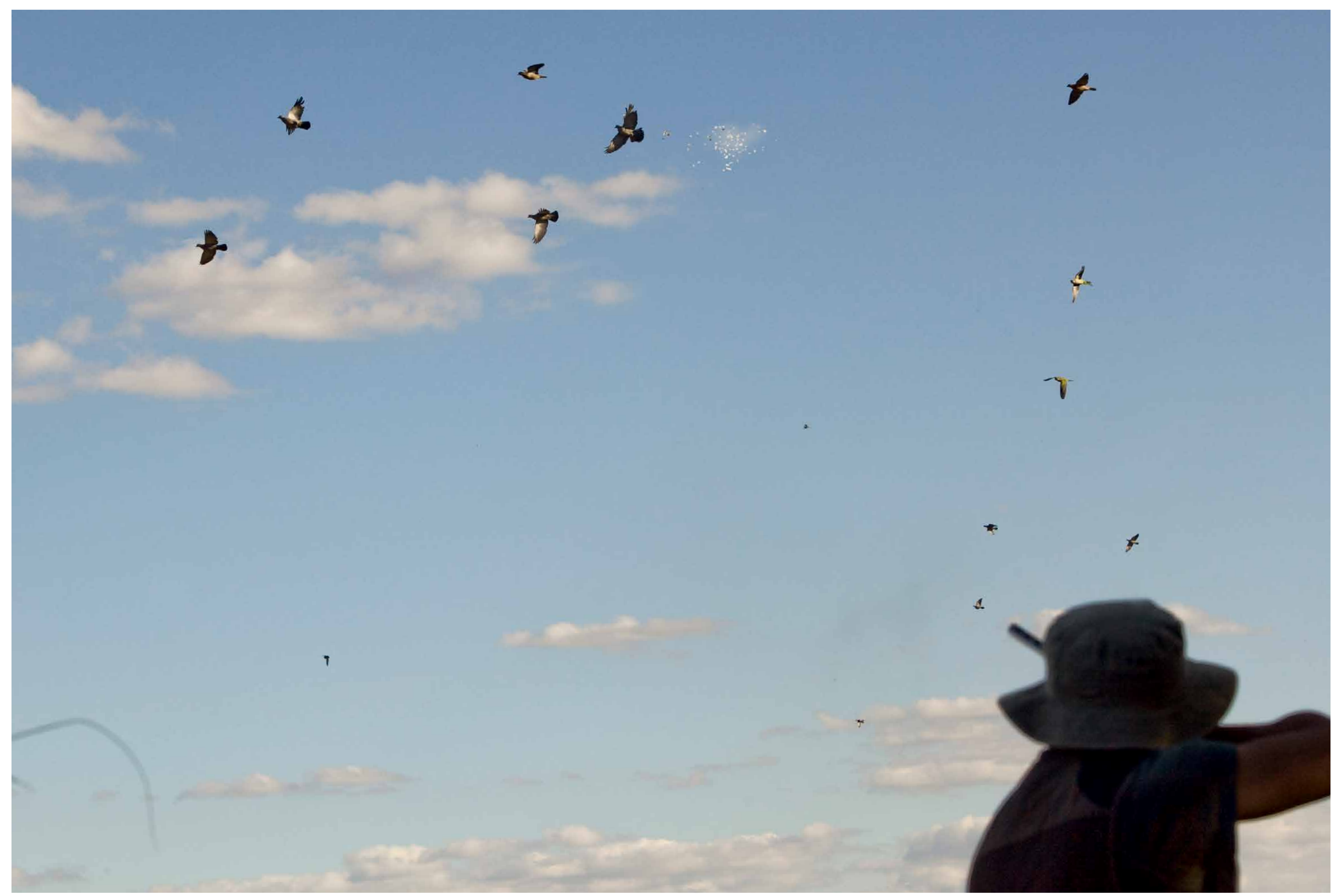
Montaraz Lodge is in the heart of it all, with 45 hunting fields located in an area annually inhabited by more than 5 million pigeons