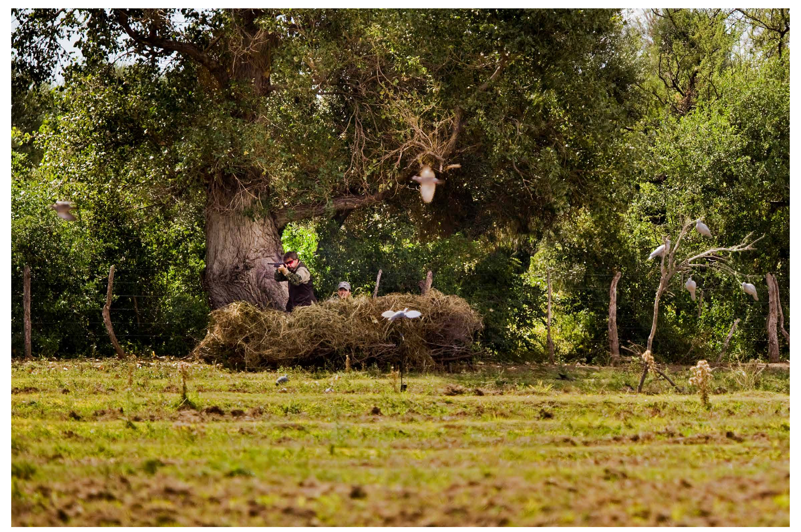
Pigeons not only fly fast and erratically, but they are also a smart and observant quarry, providing an all around sporting challenge over the decoy spread.