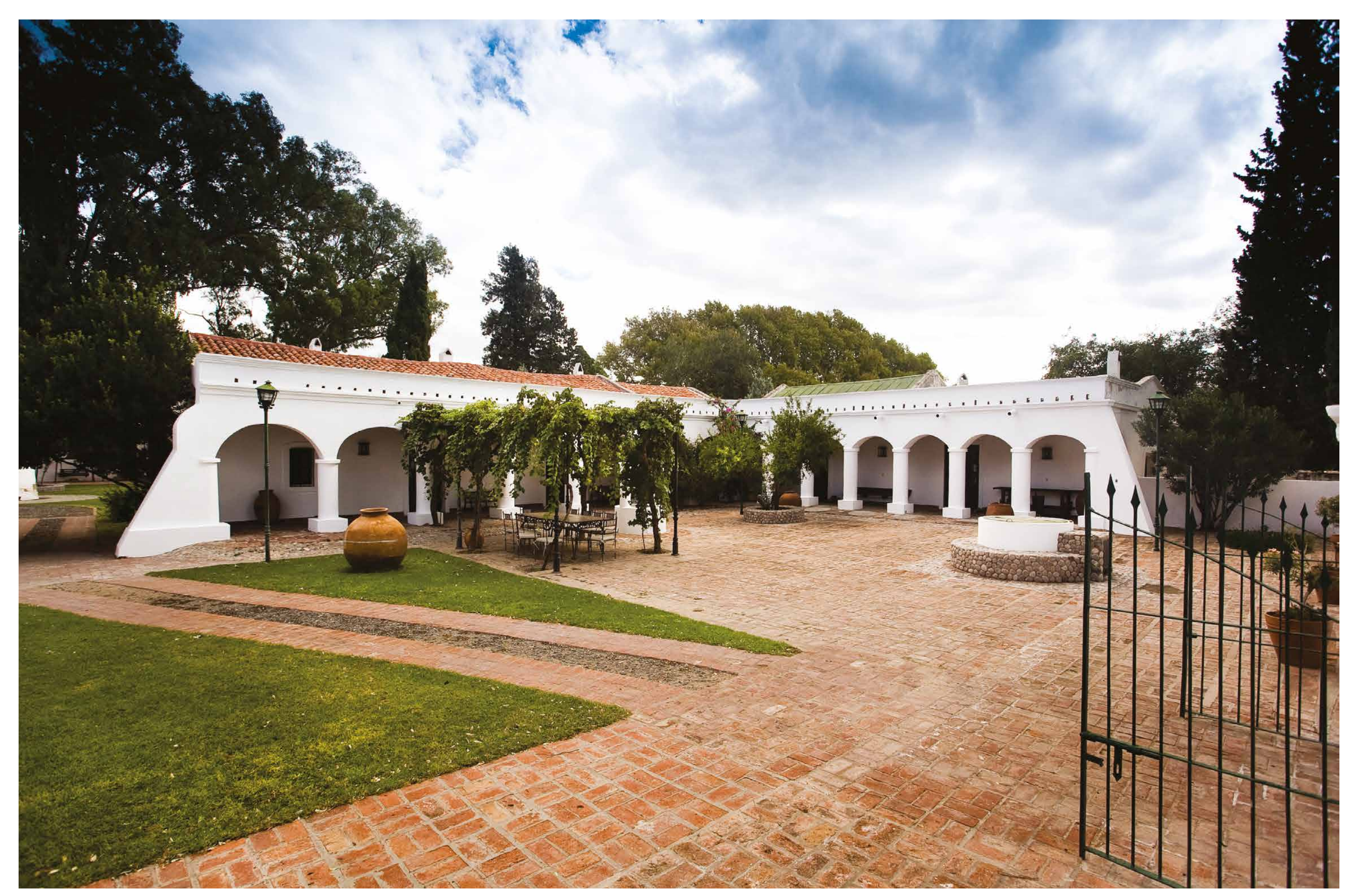
Montaraz Lodge, founded as a Jesuit mission in 1669, brings together historical elegance, with well appointed modern comfort.