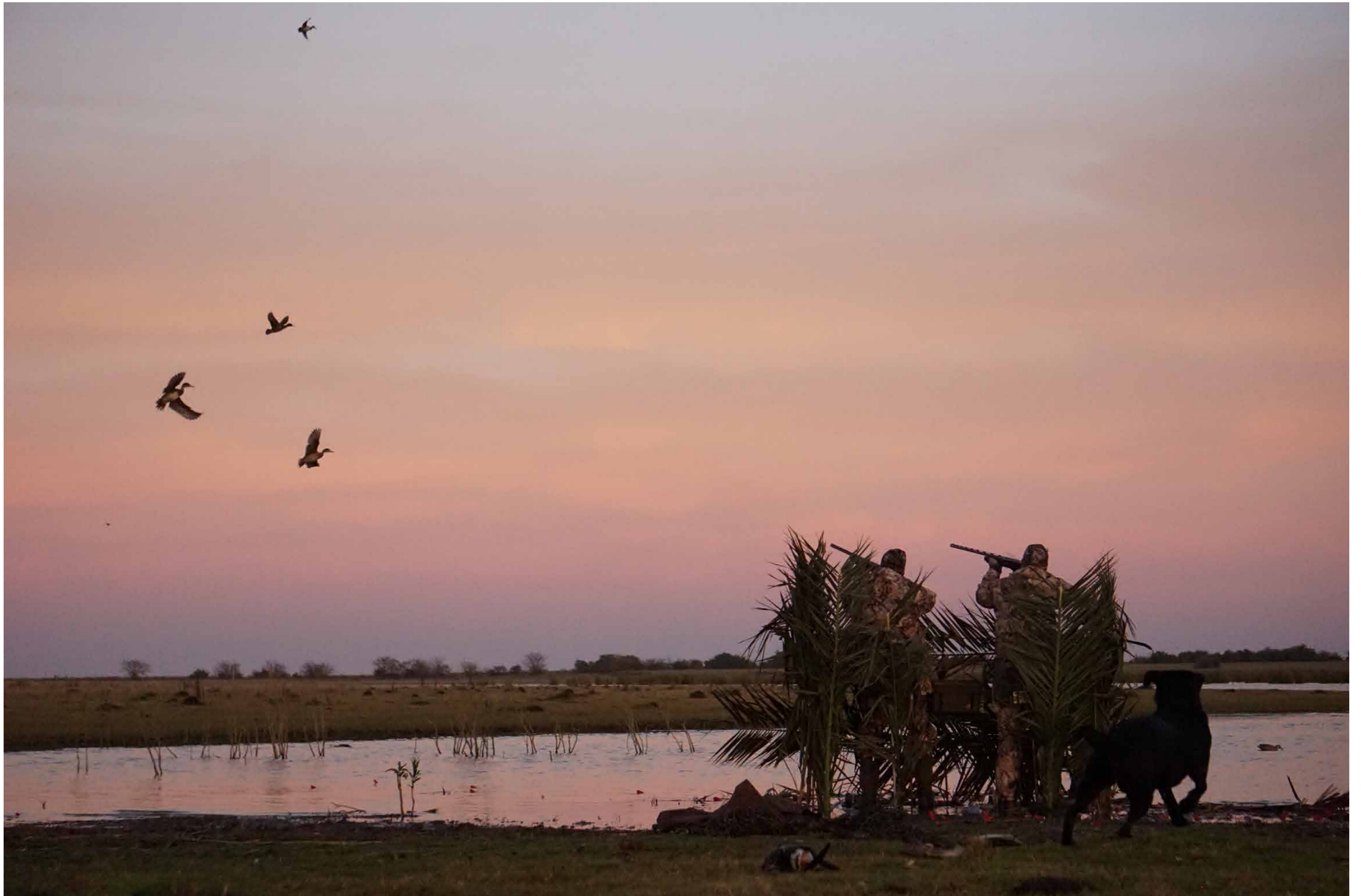
Most mornings are spent hunting ducks from comfortable blinds with our professional guides and their retrievers at the ready...