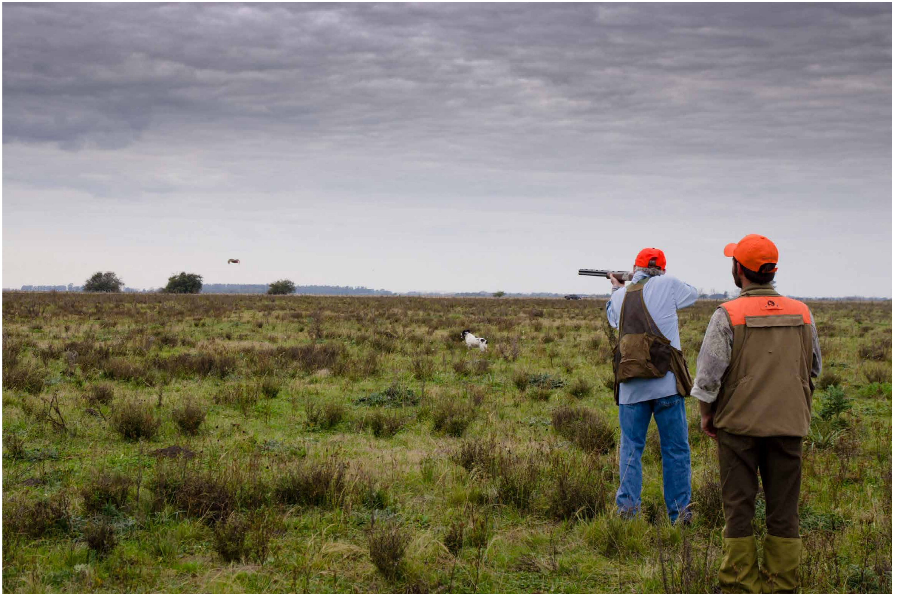
...in the afternoon, you will experience fast paced perdiz hunting with experienced upland guides, over their well trained pointers...