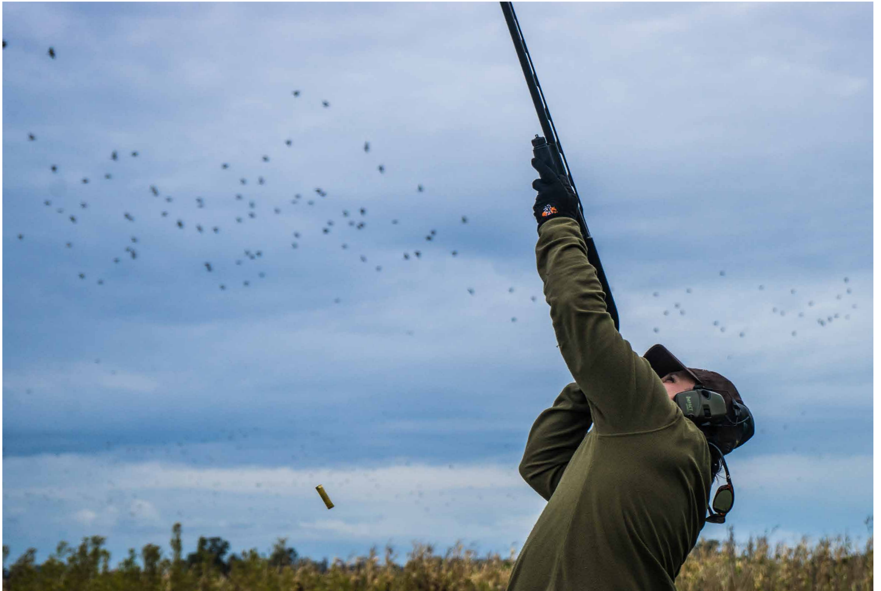
...or experience the thrill of Argentina doves at one of our nearby roosts.