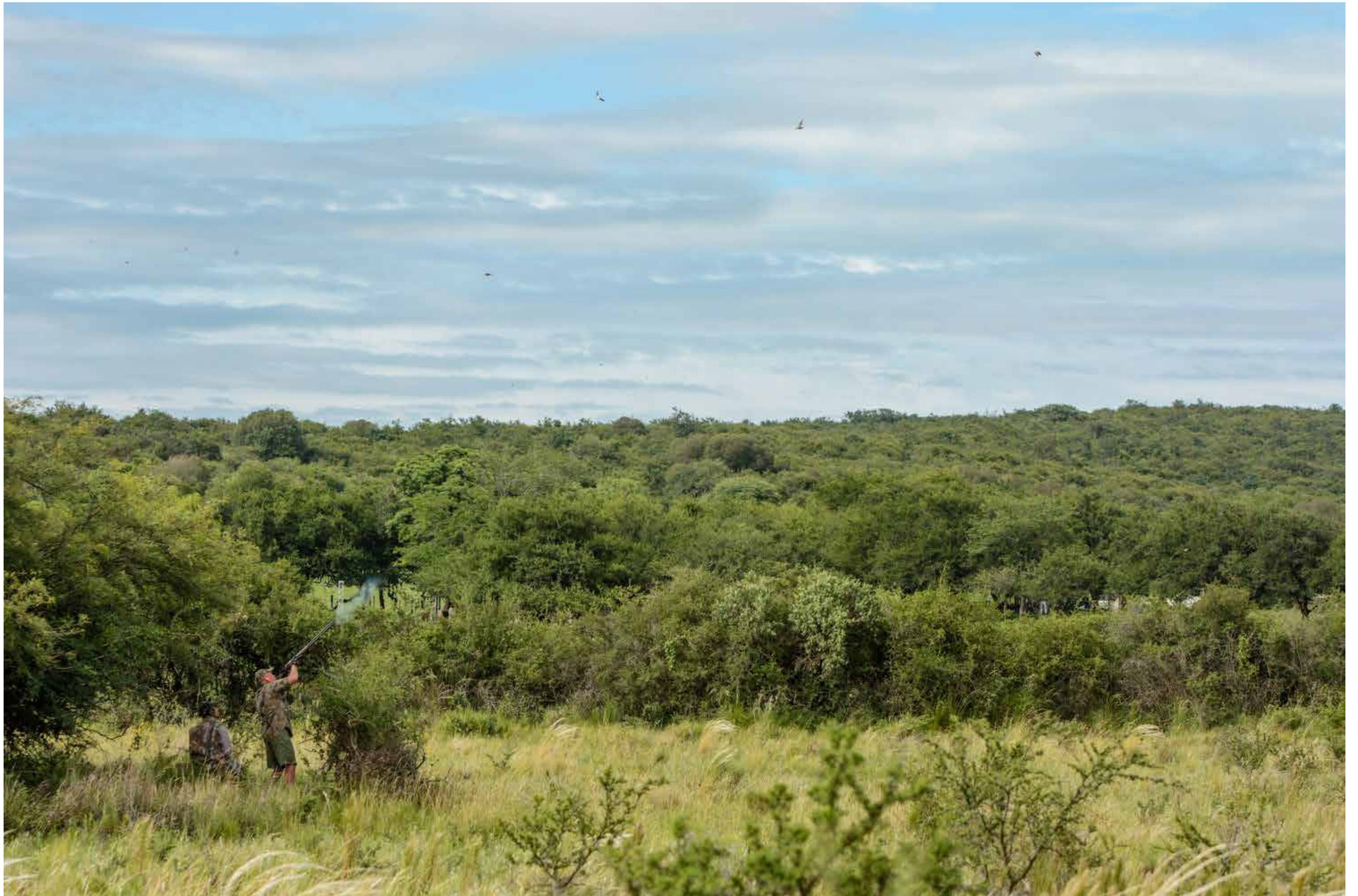
With access to over 250,000 acres of prime dove hunting ground, there is virtually no end to the variety of shooting scenarios we can offer.