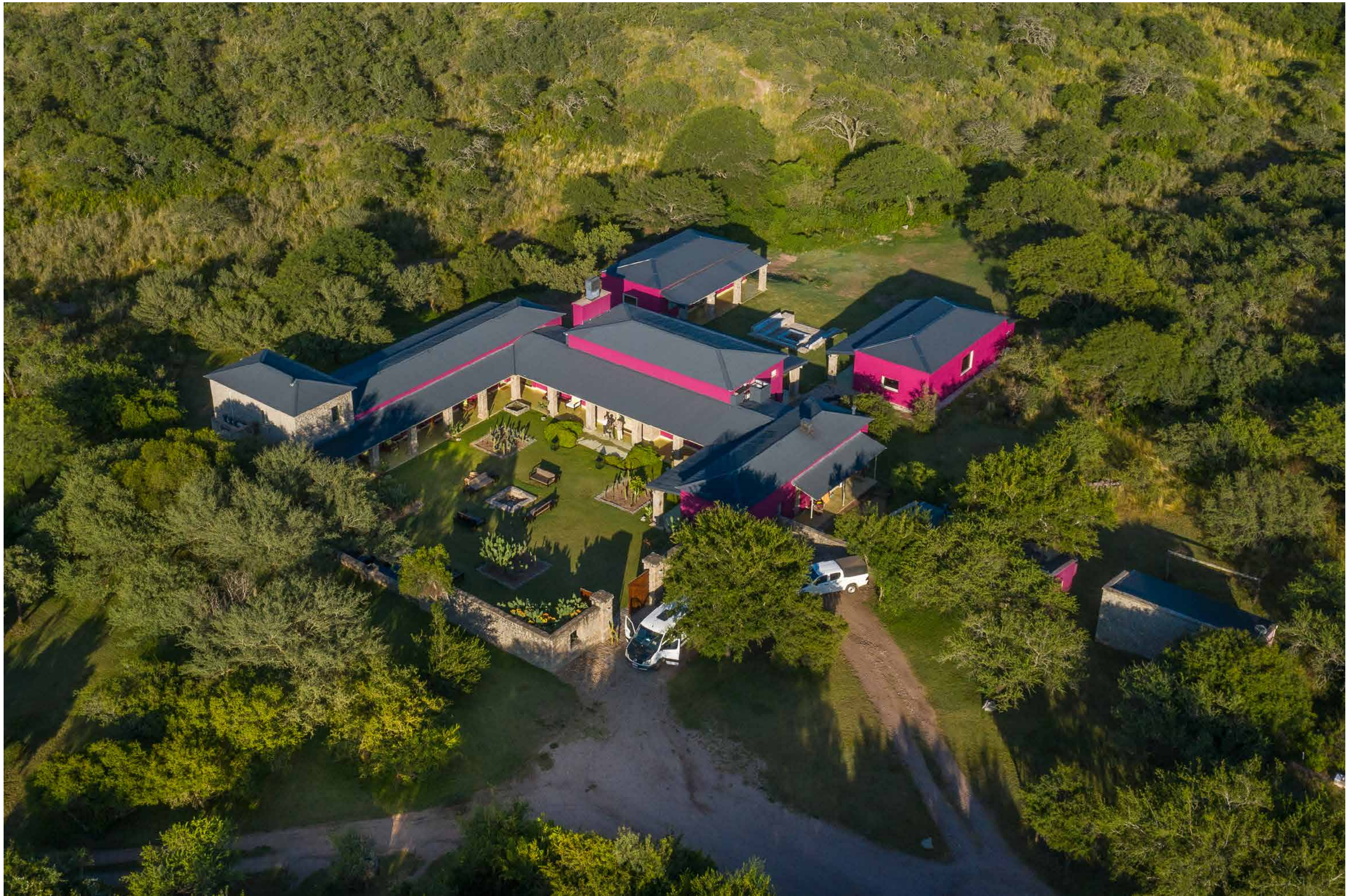
La Dormida Lodge offers the best dove hunting in the world coupled with the finest accommodations. Ideal for private parties looking for an unrivaled sporting getaway.