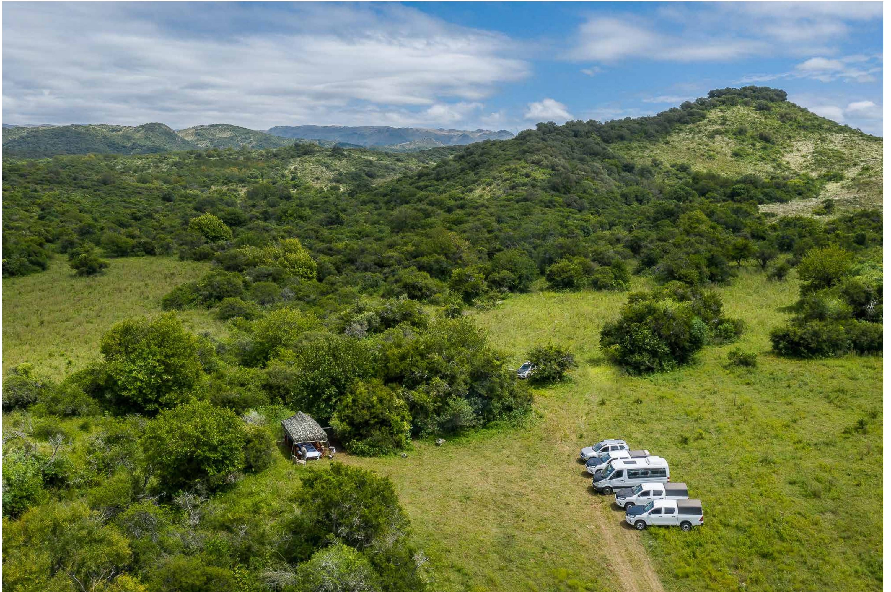
You'll be treated to an incredible Asado-style field lunch, served in the shade of a comfortable safari tent, showcasing Argentina's famous beef and superb wines.