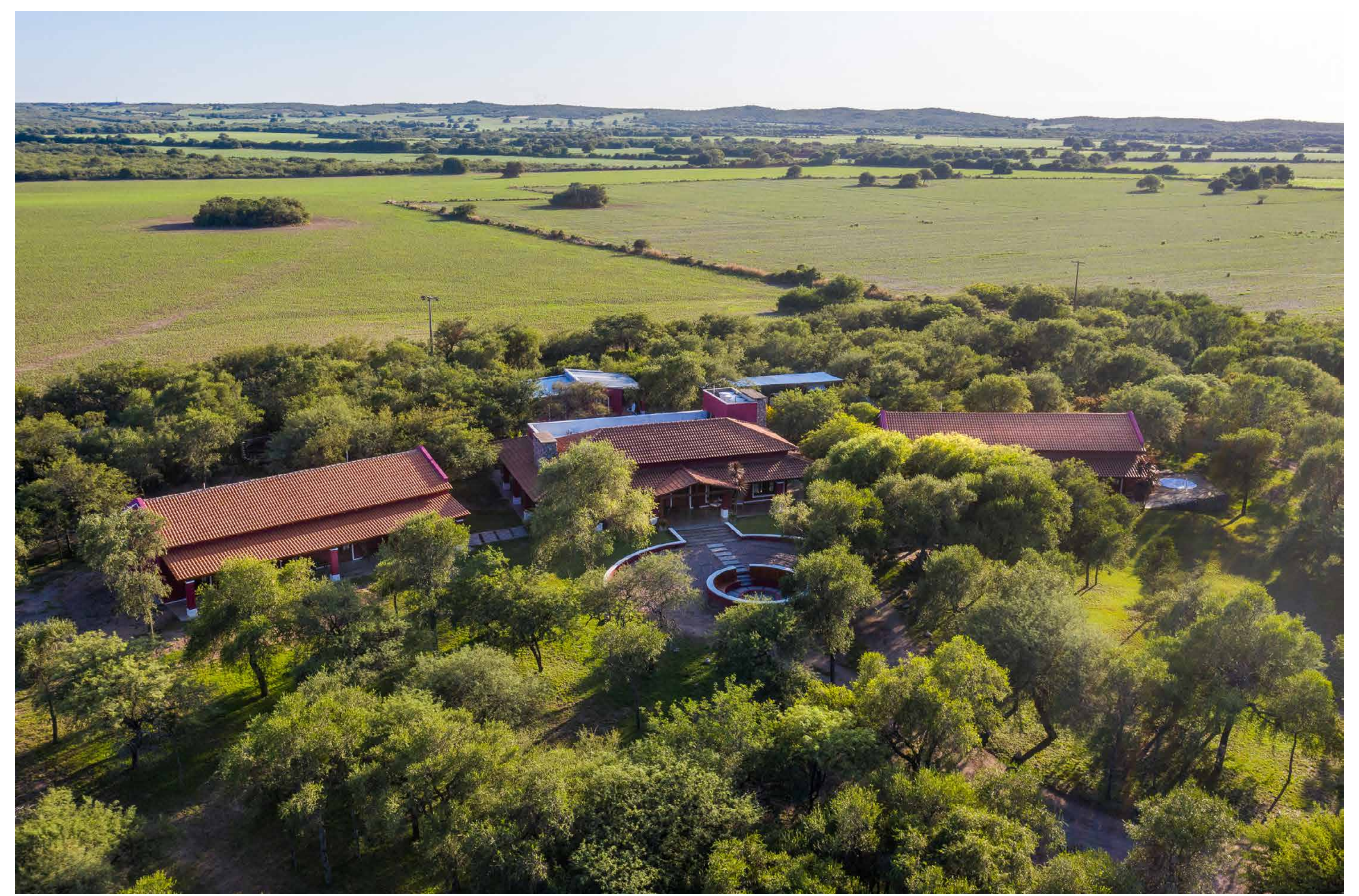
Córdoba Lodge features comforable shared rooms, fine service and superb logistics, right in the heart of Cordoba's high volume dove hunting.