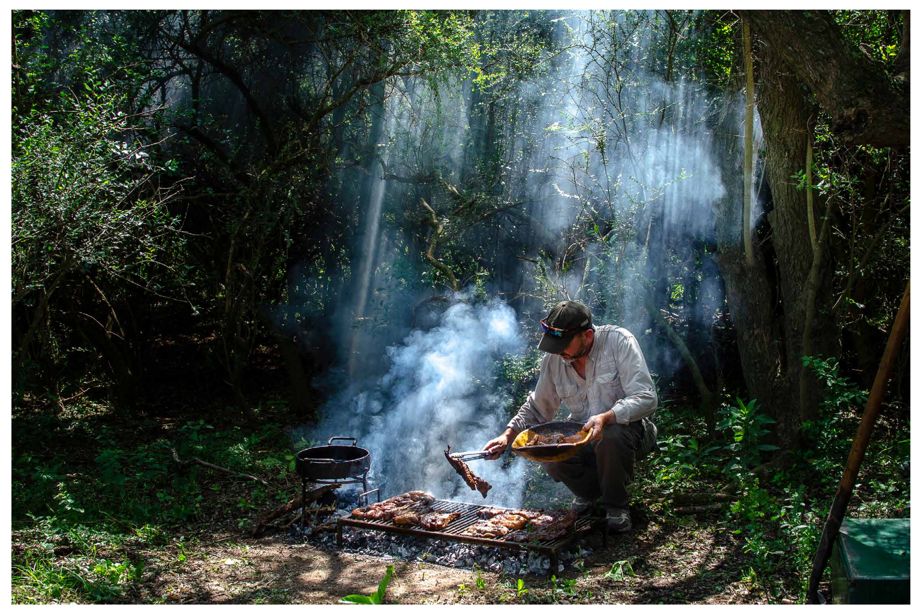
You'll be treated to an incredible Asado-style lunch, served in the shade of a comfortable safari tent, featuring Argentina's world renowned beef and superb wines.