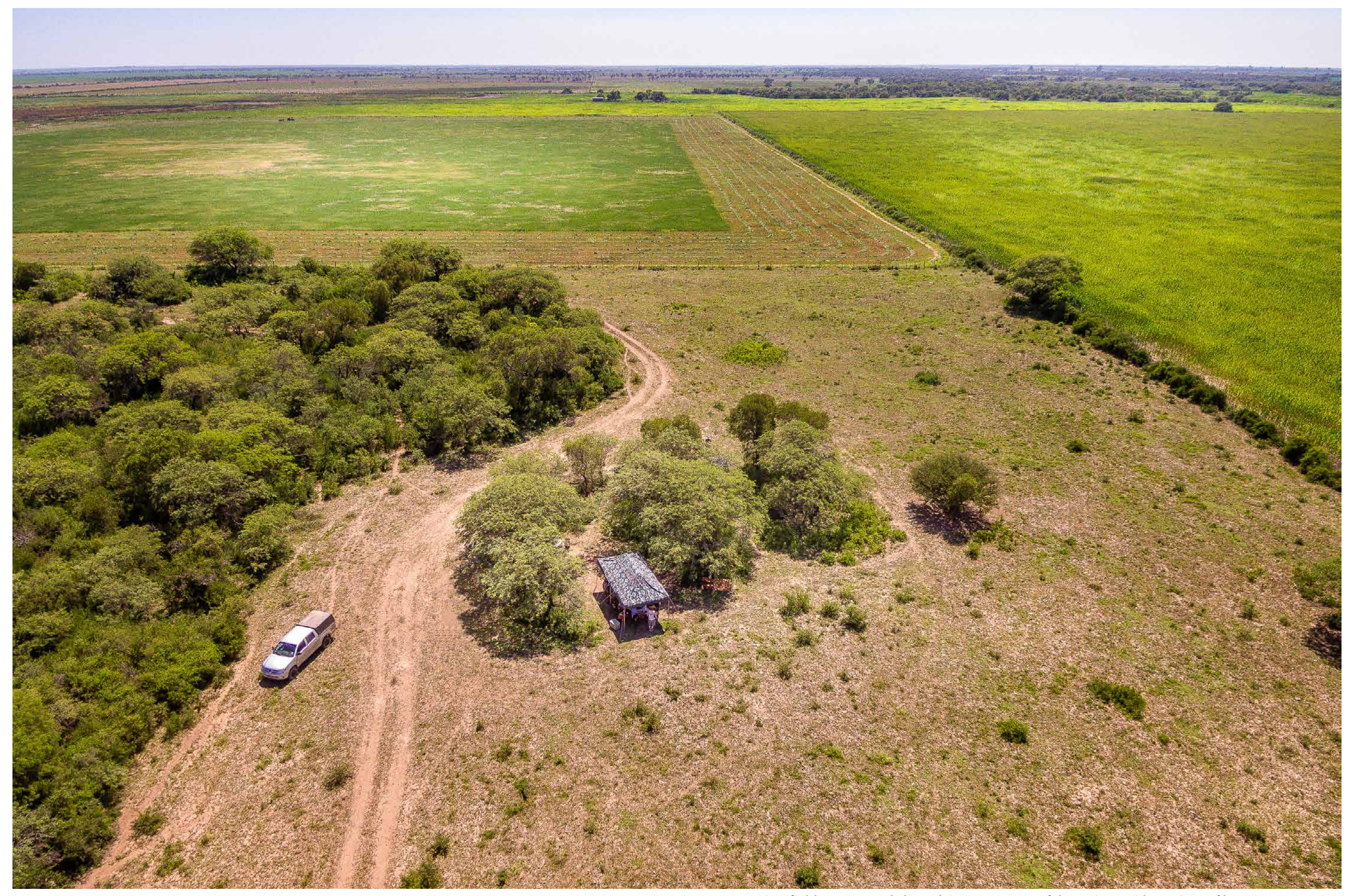
Fine field service and short drives to waves of doves in a wide variety of hunting scenarios.