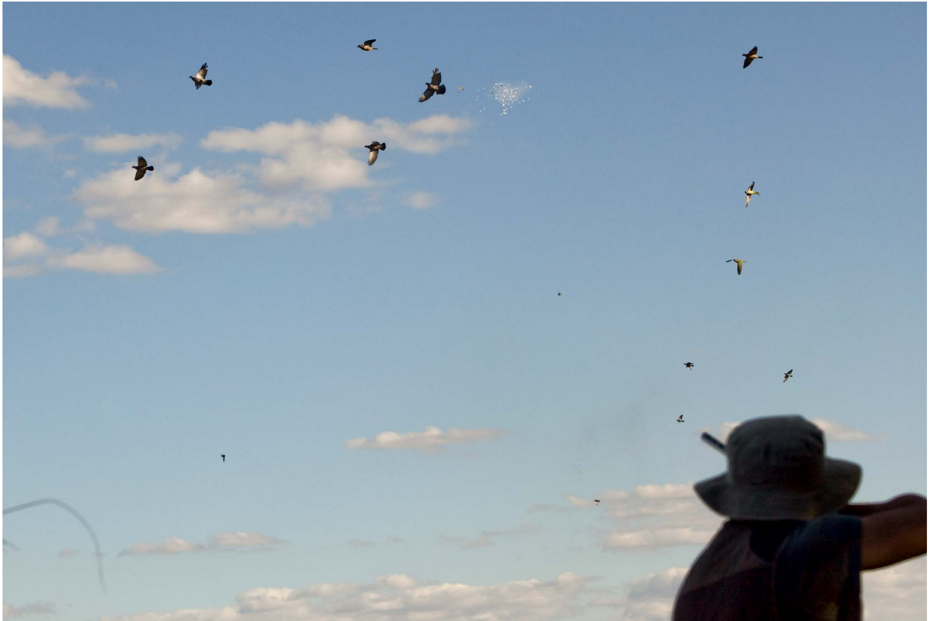
La Torcaza Lodge is in the heart of it all, with 45 hunting fields located in an area annually inhabited by more than 5 million pigeons