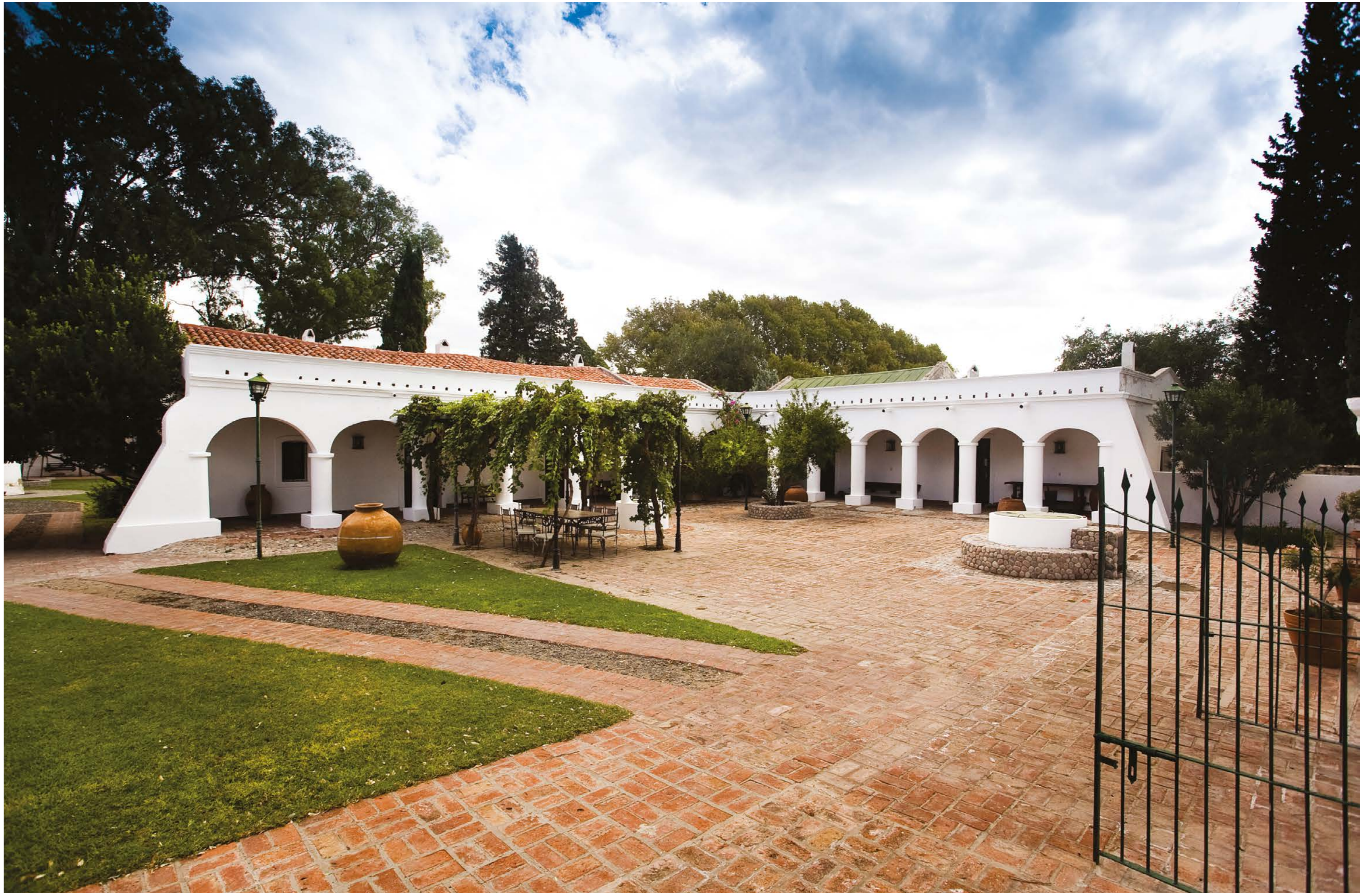
La Torcaza Lodge, founded as a Jesuit mission in 1669, brings together historical elegance, with well appointed modern comfort.