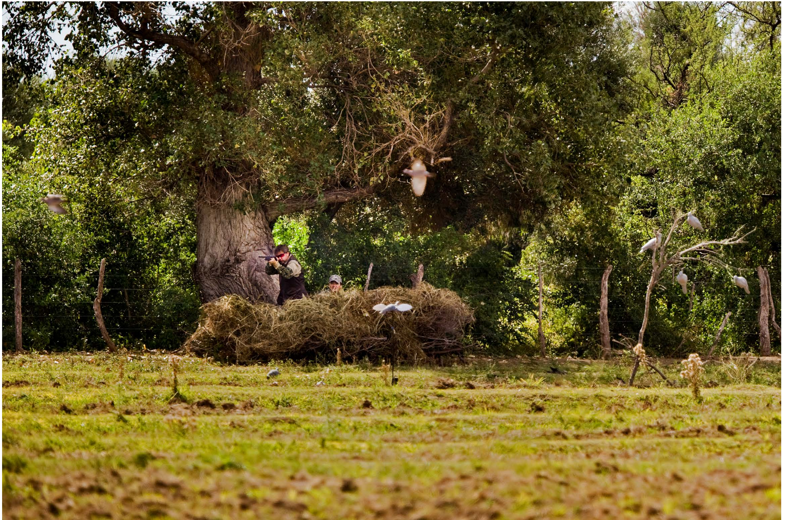
Pigeons not only fly fast and erratically, but they are also a smart and observant quarry, providing an all around sporting challenge over the decoy spread.